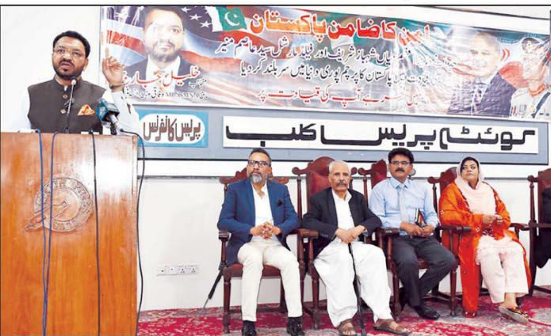
QUETTA: A view of rush near civil hospital creating problems for patients'.

The speakers said that the world was saved from a major disaster due to the joint efforts of the Prime Minister and the military leadership, Pakistan played an important and effective role in establishing peace in the region and brokered a ceasefire between Iran and the US, which saved the region from a major disaster. Pakistan's positive and constructive diplomacy has proven effective at the global level.