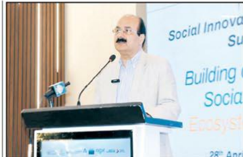
ISLAMABAD: Chairman of the Prime Minister's Youth Programme Rana Mashood Ahmad Khan addressing on SIA Summit 2.0 .

Ecosystem in Pakistan" in Islamabad, Khan praised organisers including BPF, UN Women and OGDCL for fostering women led entrepreneurship. He reflected on Pakistan's "pivotal moment of progress," stressing that empowering youth particularly women is central to the economic strategy. Citing Indonesia as an example where boosting women's participation to 50% raised GDP by 4%, Khan called for similar gains in Pakistan. PMYP chief highlighted his past work on women's empowerment under Punjab Chief Minister Shehbaz Sharif, noting the Prime Minister's Youth Business.