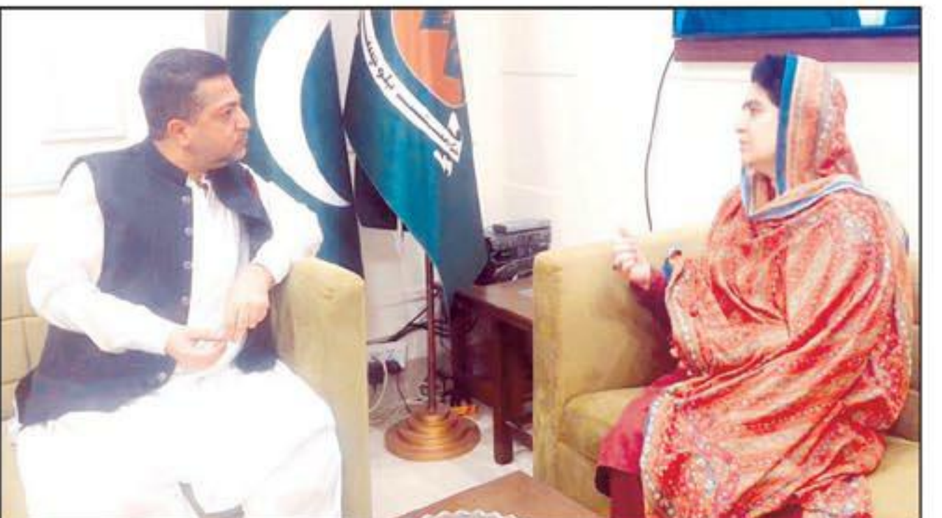
Quetta: Balochistan Home Minister Mir Ziaullah Langov in a meeting with Provincial Education Minister Raheela Hameed Khan Durrani.

The report revealed that the PTI founder was diagnosed with a serious eye condition known as central retinal vein occlusion (CRVO).