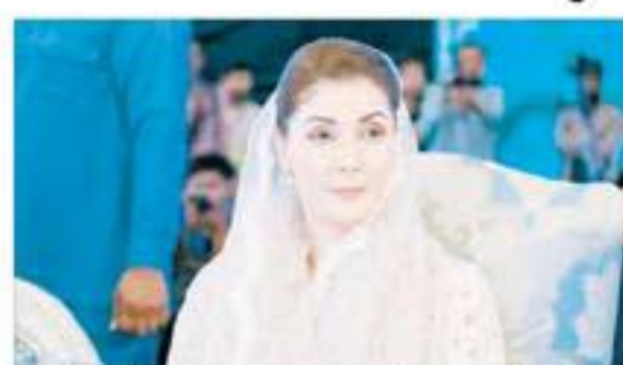
protective measures to safeguard workers from any harm.

The Chief Minister directed the Labour Department and other relevant institutions to take strict action against those violating workplace safety laws. She said all industrial and business units must ensure the availability of safety equipment and