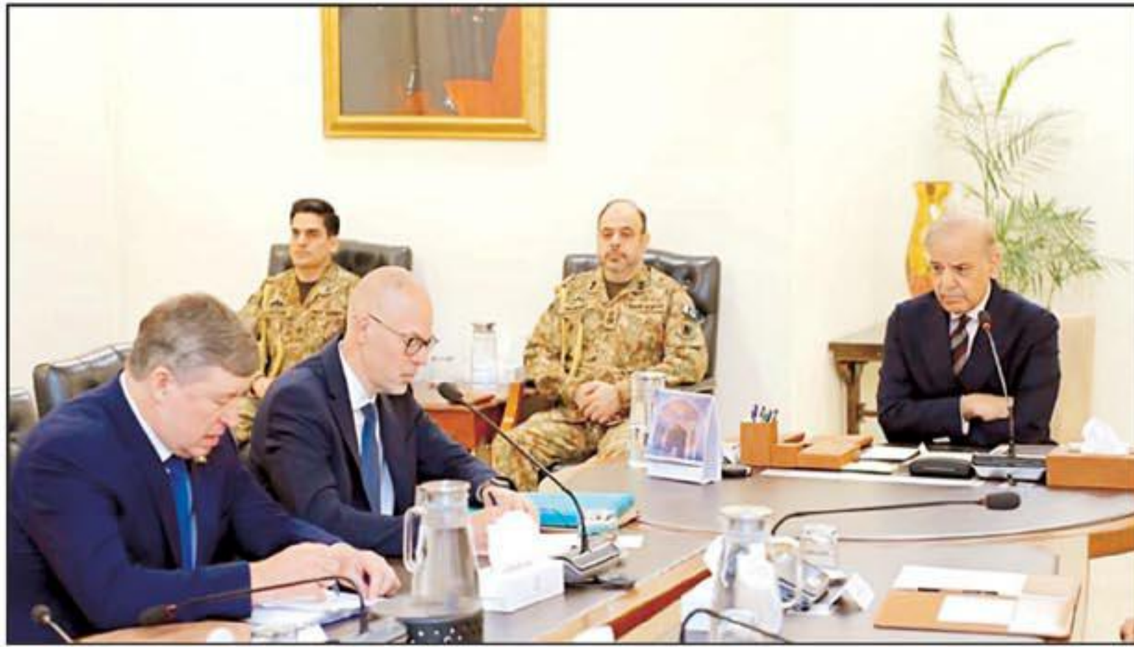
ISLAMABAD: A business delegation of European Union called on Prime Minister Shehbaz Sharif.

Hopes of reviving peace efforts have receded since the US president scrapped a visit planned for last weekend by his special envoy Steve Witkoff and son-in-law Jared Kushner to mediator Pakistan.