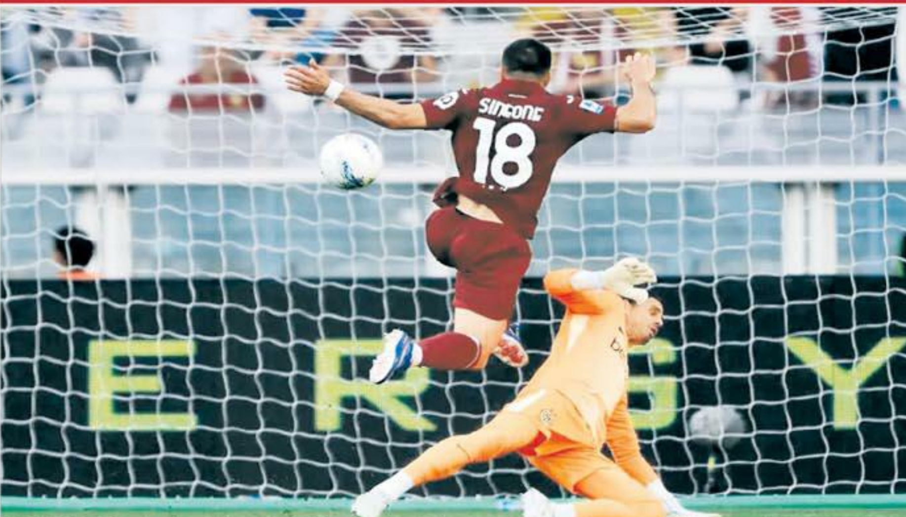
TURIN: Torino's Giovanni Simeone (L) scores past Inter Milan goalkeeper Yann Sommer during their Serie A match at the Olympic Grande Torino Stadium.

Last season's Bundesliga title was Kane's maiden team trophy, at the age of 31. Having added another league crown this season, Bayern's habit of hoovering up trophies is already rubbing off on the England captain.