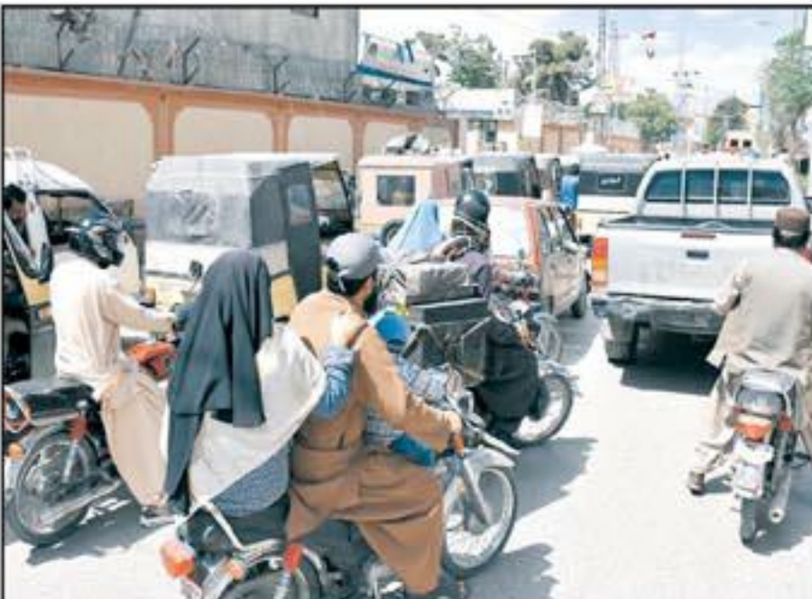
QUETTA: A view of rush near civil hospital creating problems for patients'.

"This is where a global shift is happening. Today, the world is moving toward integrating medicine with nutrition, food, and plant-based.