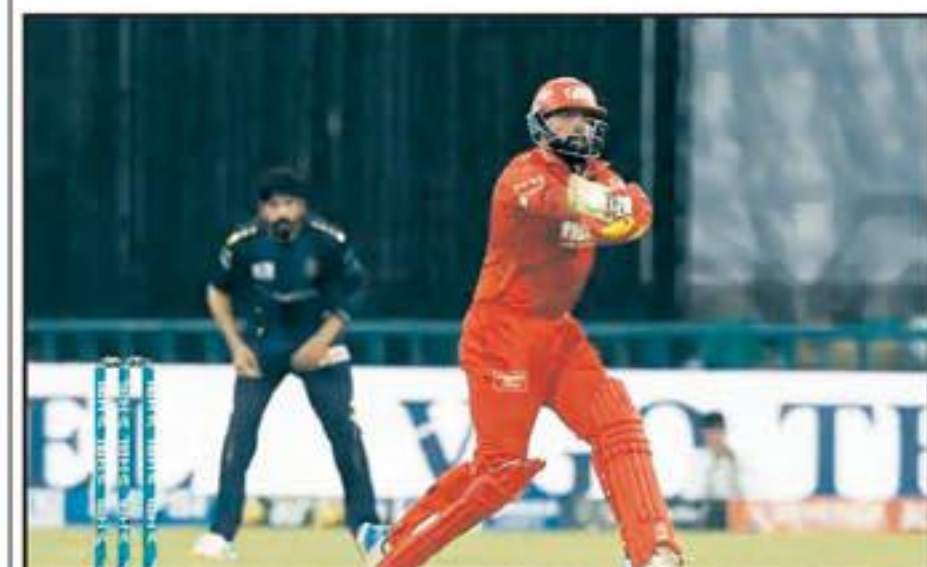
ISLAMABAD United captain Shadab Khan plays a shot during the Pakistan Super League match against Quetta Gladiators at the Gaddafi Stadium.