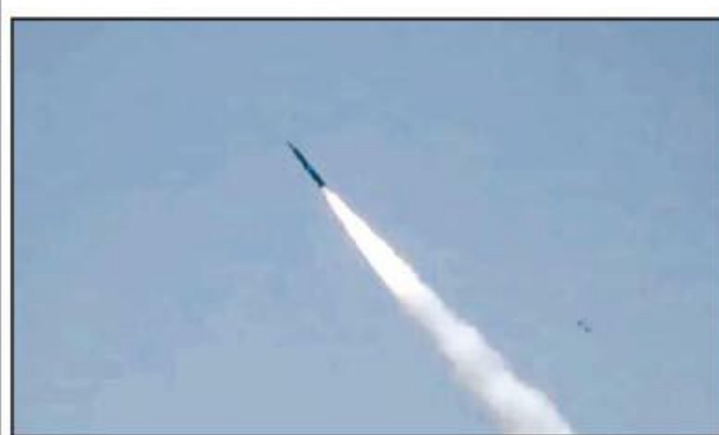
Launch of the Fateh-II Missile System.

Forces and Chief of Army Staff, Field Marshal Asim Munir, and services chiefs "appreciated the technical prowess, dedication and commitment of all those who contributed towards the successful training fire of the missiles," the ISPR concluded.