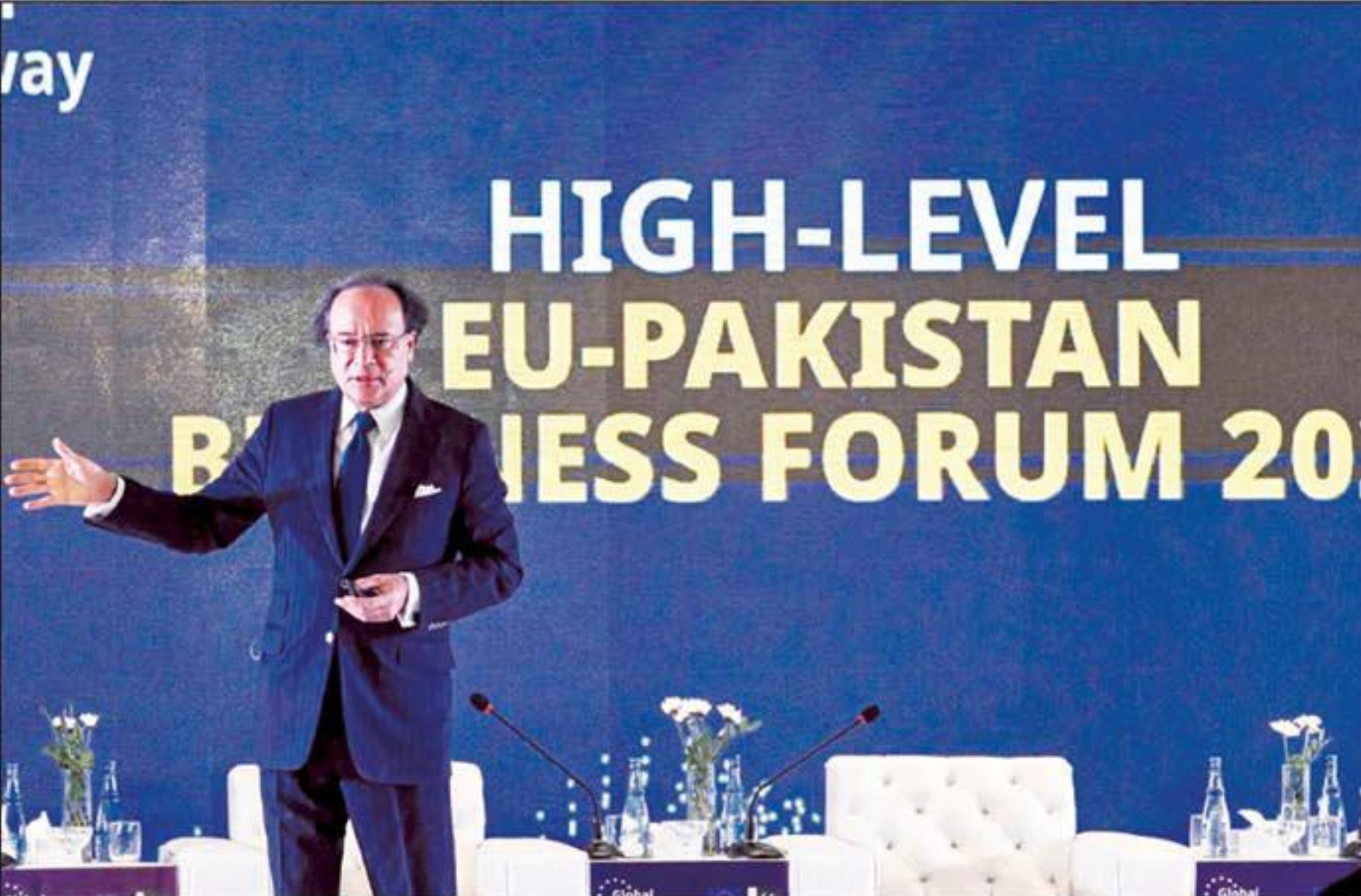
Finance Minister Muhammad Aurangzeb, speaks during the High-Level European Union-Pakistan Business Forum (EU-PKBF) in Islamabad

As a maritime State with "unwavering faith in international law and diplomacy", Pakistan will continue to engage with the Security Council and with all like-minded countries for preserving hard-won gains in strengthening global governance — "both in the gentle tides of peace and amity and amid the rising storms of conflict and conflagration".