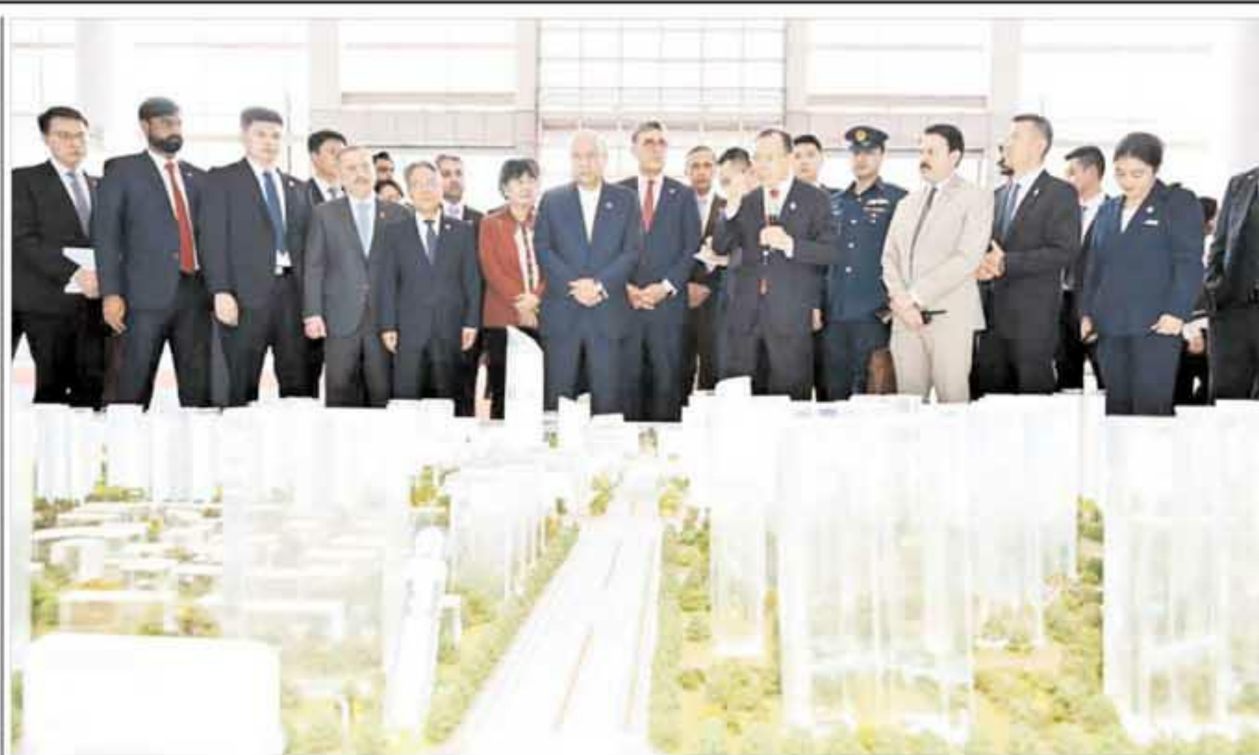
Changsha, China: President Asif Ali Zardari being given a detailed overview of the plant layout and manufacturing processes at Sany Heavy Industry Co, Ltd.

The official said citizens would now only need to bring their Computerized National Identity Card (CNIC) to obtain a driving licence from Islamabad Traffic Police.