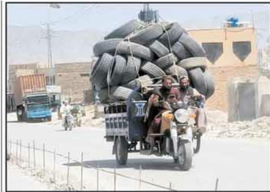
Laborers Transport Tires on Rickshaw in Quetta.