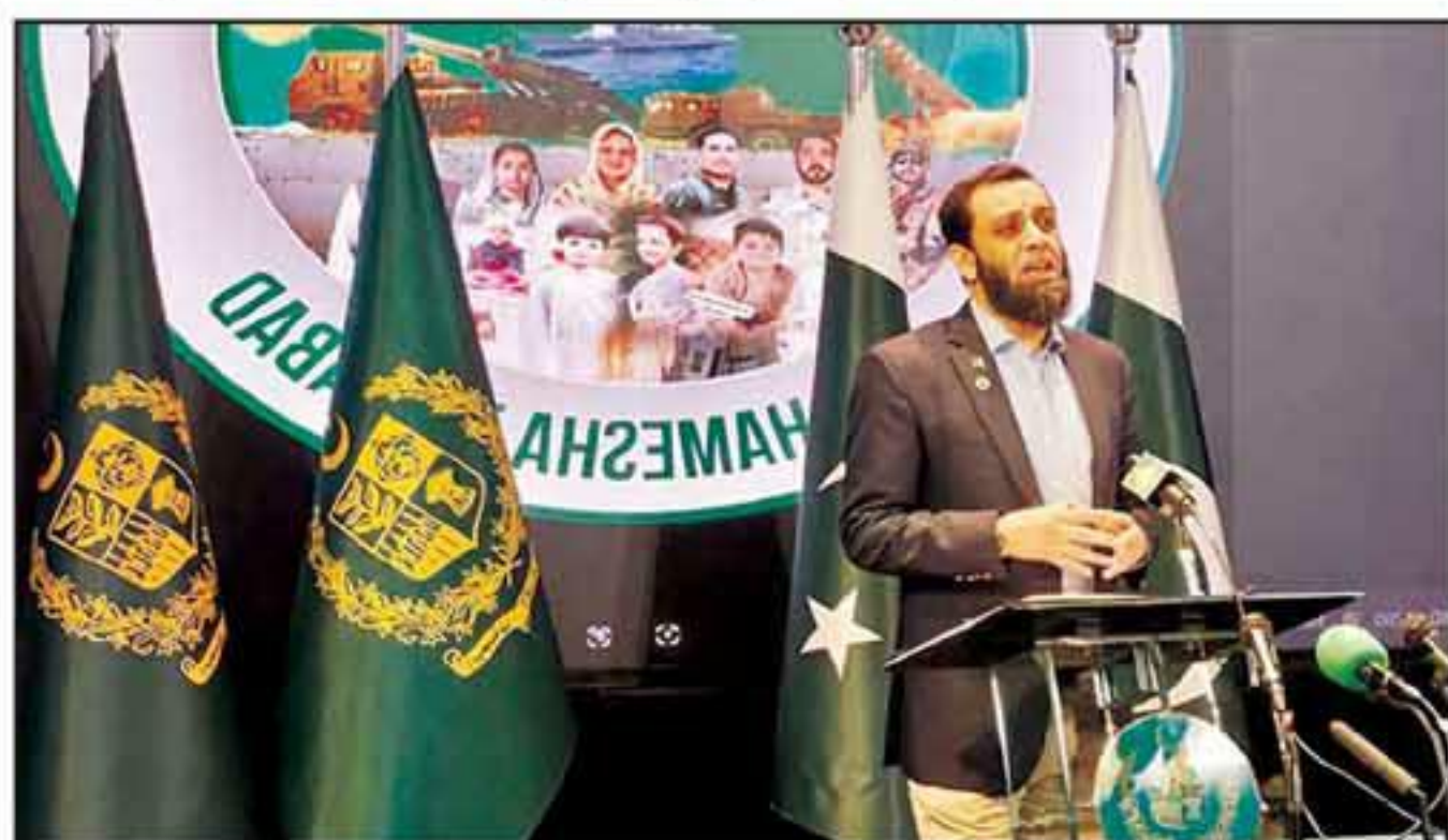
Islamabad: Federal Minister for Information and Broadcasting, Mr. Attaullah Tarar addressing a press conference.

Commenting on the recent crisis, Gilani said that Pakistan was playing a responsible and active role in promoting peace, dialogue.