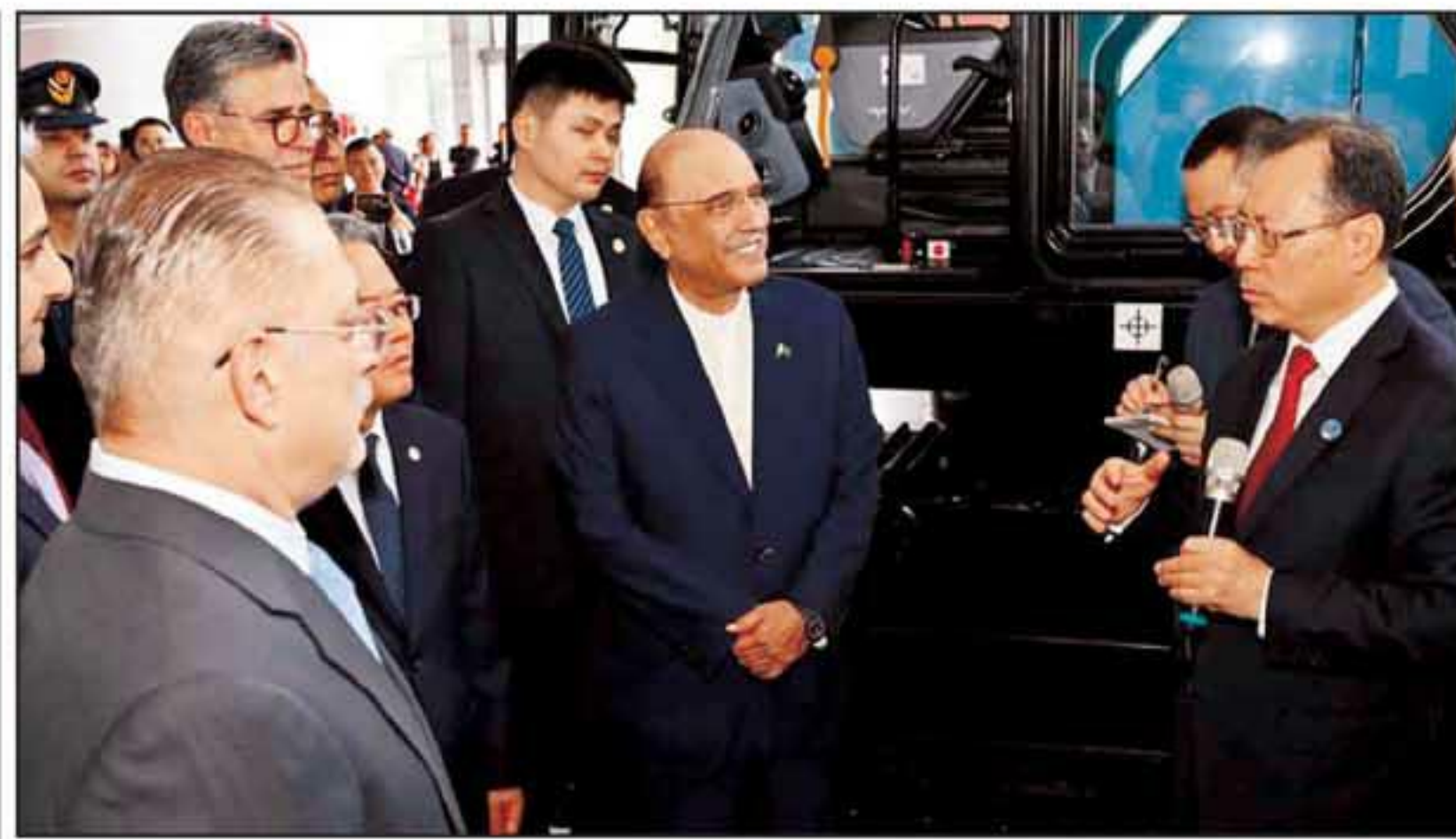
Changsha, China: President Asif Ali Zardari being briefed on machinery, equipment and production capacity during his visit to Sany Heavy Industry Co, Ltd.

Araghchi "listened to His Majesty's views on ways to advance these efforts in a manner that enhances opportunities for reaching sustainable political solutions and limits the repercussions of crises on the peoples of the region", the statement said. It added that the sultan affirmed the importance of prioritising the language of dialogue and diplomacy in addressing issues, in a way that contributed to consolidating the foundations of peace. Araghchi expressed Iran's appreciation for Oman's positions in "supporting dialogue efforts and enhancing endeavours for security and stability in the region, especially amid the current regional challenges."