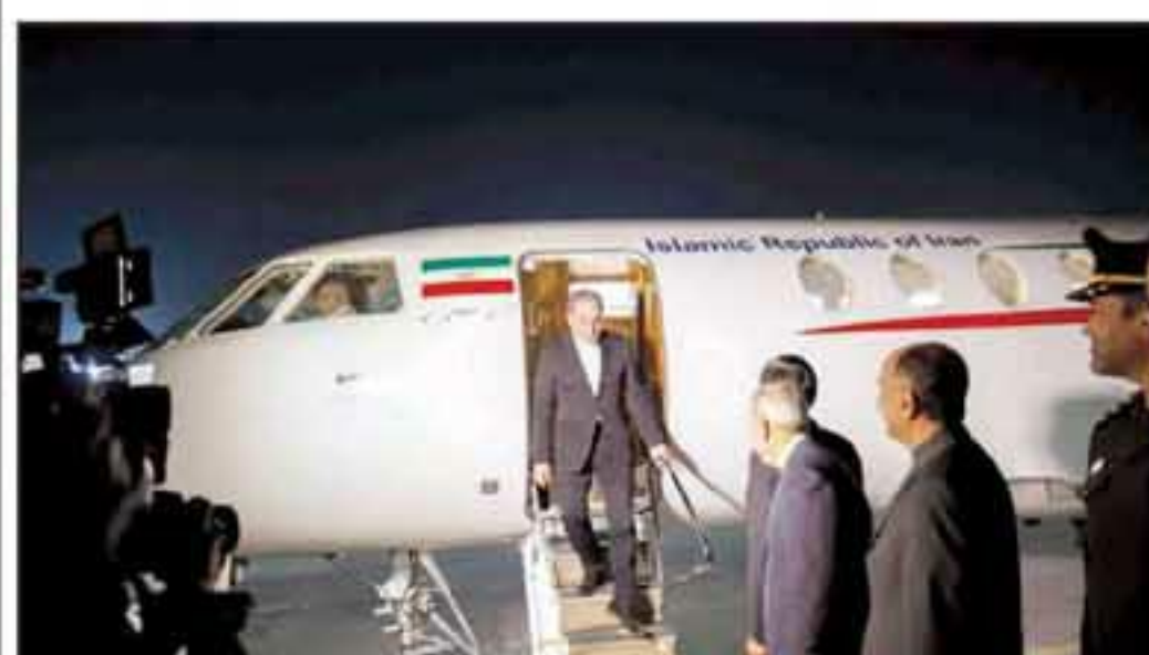
Iranian Foreign Minister Abbas Araghchi arrives in Pakistan.

During the visit, the president toured the company's history gallery and observed a presentation on tea processing and tea culture. He also attended a tea tasting session.