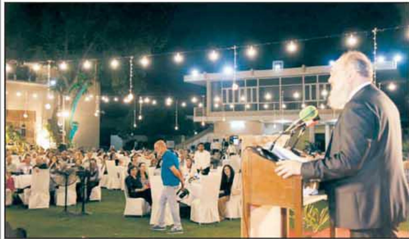
Karachi: Federal Minister for commerce Jam Kamal Khan addressing the audience at the Karachi Parsi Institute, appreciating the Parsi community's 133-year legacy of service, dedication and contributions to Pakistan's development.

The conflict in the Middle East, however, cast a cloud over the outlook as volatile energy prices and tighter global financial conditions risk putting upward pressure on inflation and weighing on growth and the current account.