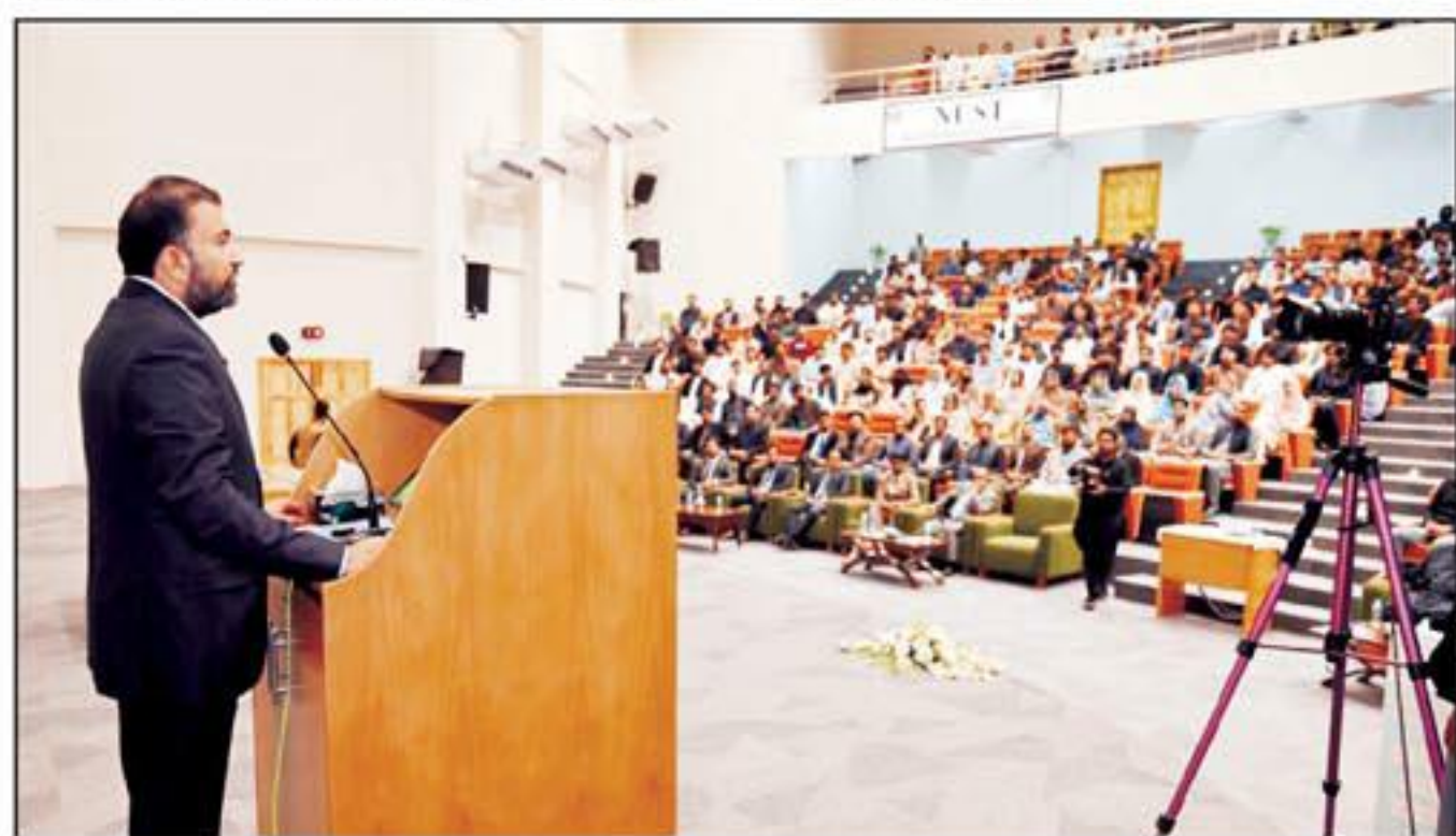
QUETTA: Balochistan Chief Minister Mir Sarfraz Bugti Speaking at the event.