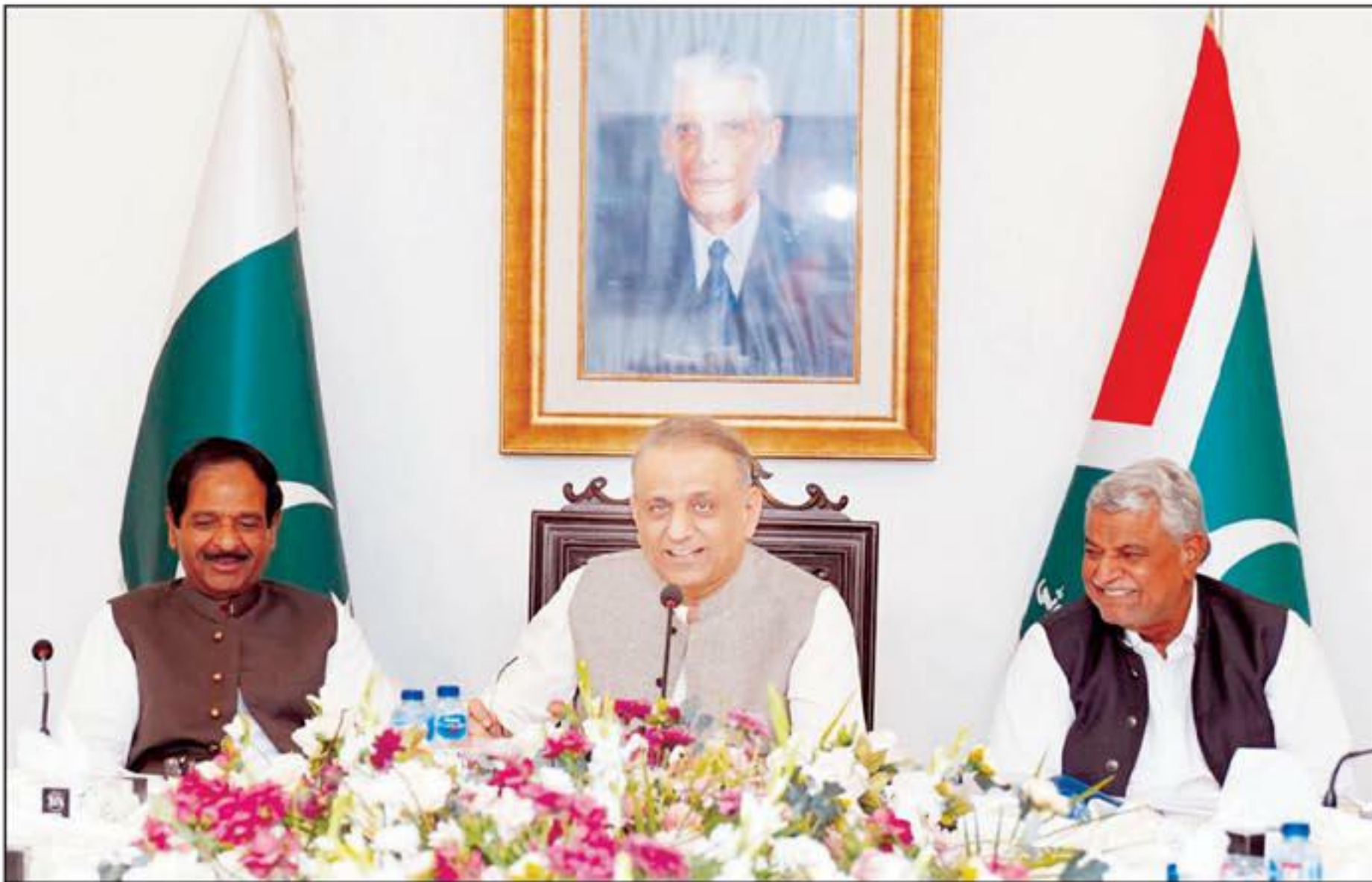
Gilgit-Baltistan Election, Electoral Board of Istehkam-e-Pakistan Party held meeting chaired by Central President Abdul Aleem Khan.

Drawing on broader social trends, she observed that while women's global participation in the workforce increased after World War II, they have continued to balance professional responsibilities with household duties. In Pakistan, however, women have consistently demonstrated their potential when provided equal opportunities.