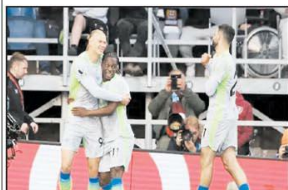
Manchester City's Erling Haaland celebrates scoring their first goal with Jeremy Doku and Rayan Ait-Nouri.

With the race so tight, however, they would have expected to sweep Burnley aside by a wider margin on Wednesday and given themselves the edge on goal difference. It certainly looked that way at the start as Burnley keeper Martin Dubravka made a great save from Rayan Cherki before Haaland was played through and the Norwegian advanced before dinking a subtle left-footed finish past the keeper.