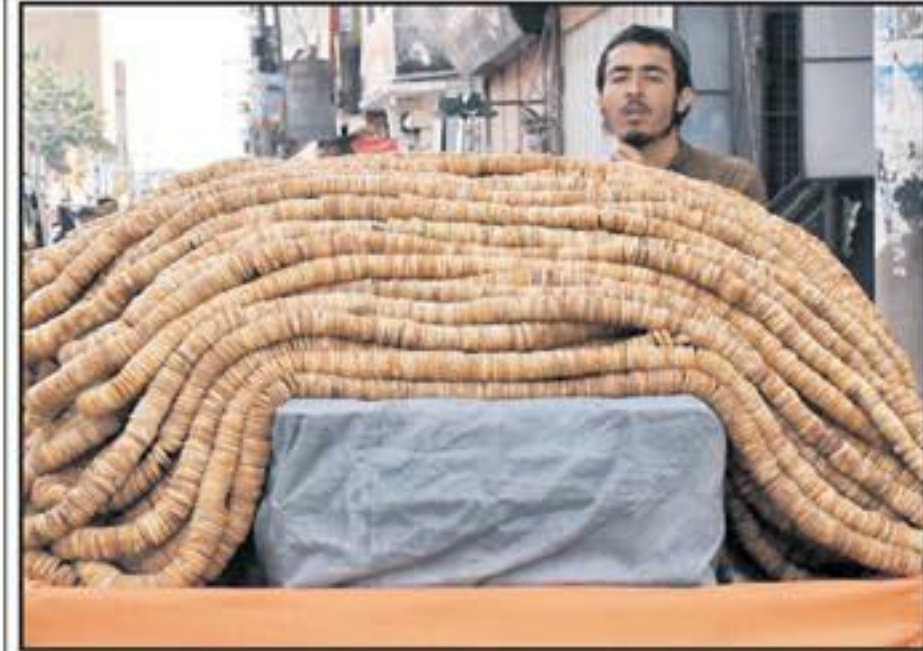
QUETTA: A vendor selling anjeer on his hand cart clay water pots on joint road.

The officials said the initiative reflects the province's renewed commitment to climate resilience.