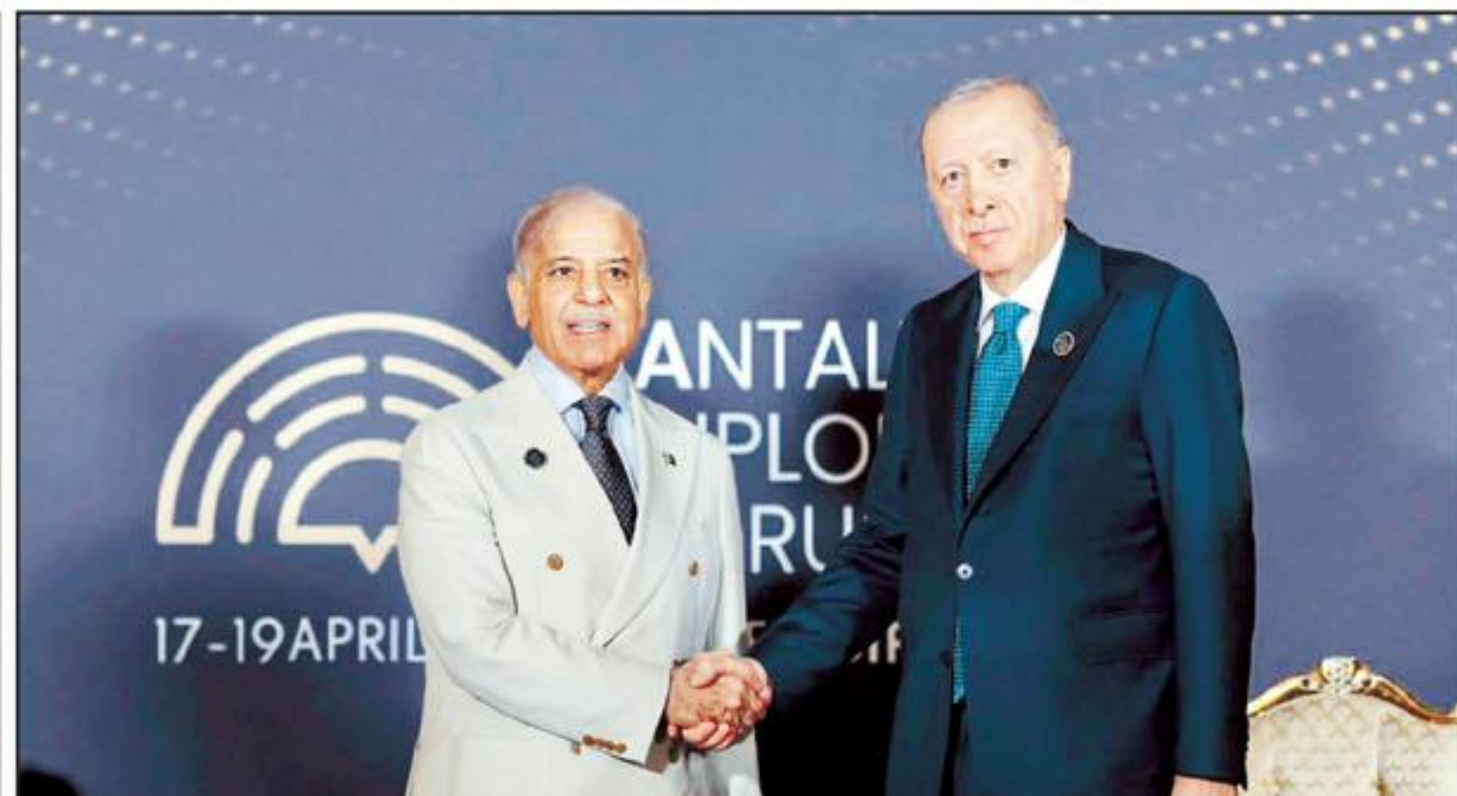
ANTALYA: Prime Minister Muhammad Shehbaz Sharif held a bilateral meeting with President Recep Tayyip Erdogan of Türkiye on the sidelines of the 5th Antalya Diplomacy Forum (ADF 2026).

"The two leaders emphasised the importance of effectively utilising the current window of opportunity to advance a durable and lasting regional peace," the statement said.