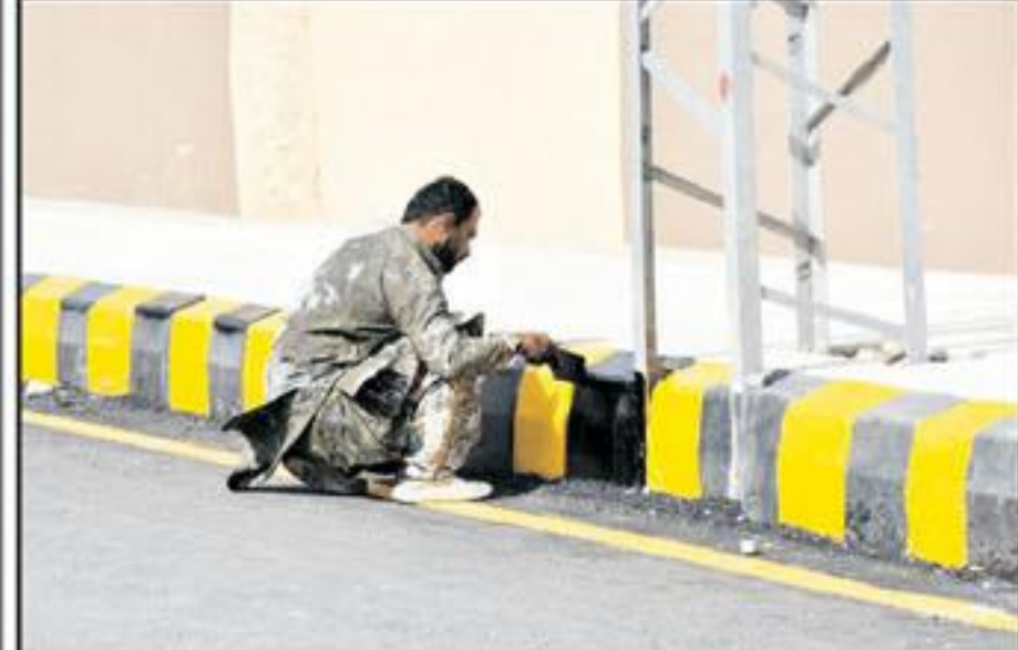
QUETTA: A worker busy in paint on the sideline of the Pashin stop.

In 2024-25 alone, HEC awarded 3,946 scholarships under the Need-Based Scholarship Programme. The programme empowers disadvantaged youth and promotes quality education.