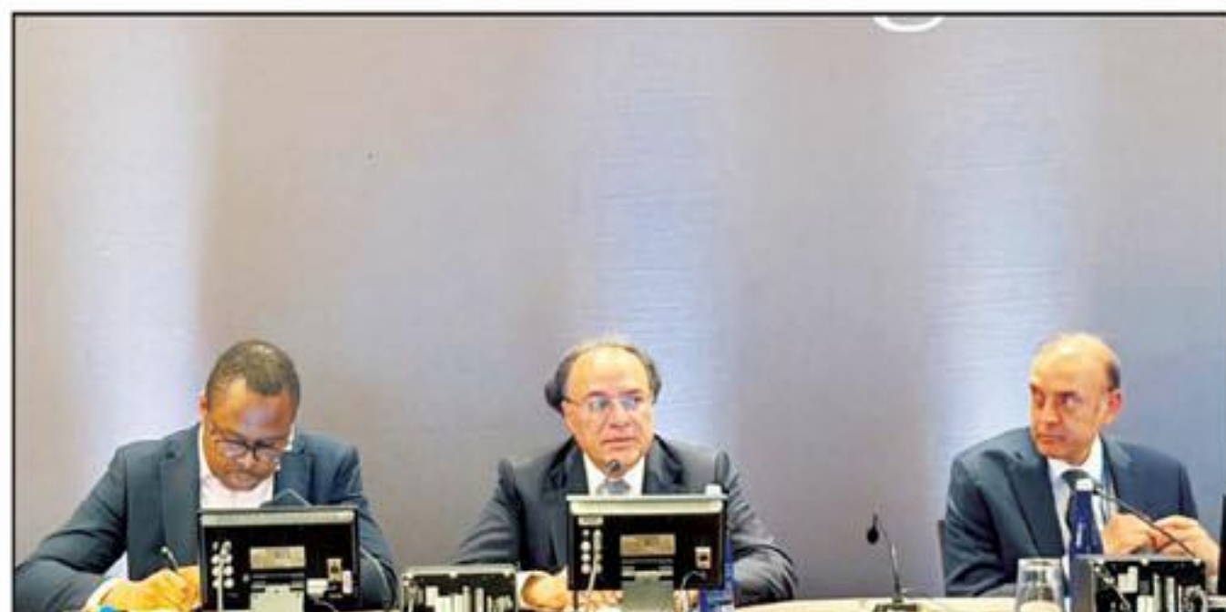
WASHINGTON, DC: Federal Minister for Finance and Revenue, Senator Muhammad Aurangzeb, participated in the J.P. Morgan Investment Seminar titled "Pakistan: Economic and Monetary Policy Outlook", where he engaged with global institutional investors on the sidelines of the World Bank-IMF Spring Meetings 2026. The Governor, State Bank of Pakistan, also joined the session.

Shehbaz Sharif thanked the Turkish Foreign Minister for the warm welcome and traditional hospitality, and said that he was pleased to be visiting Türkiye, which he described as his second home.