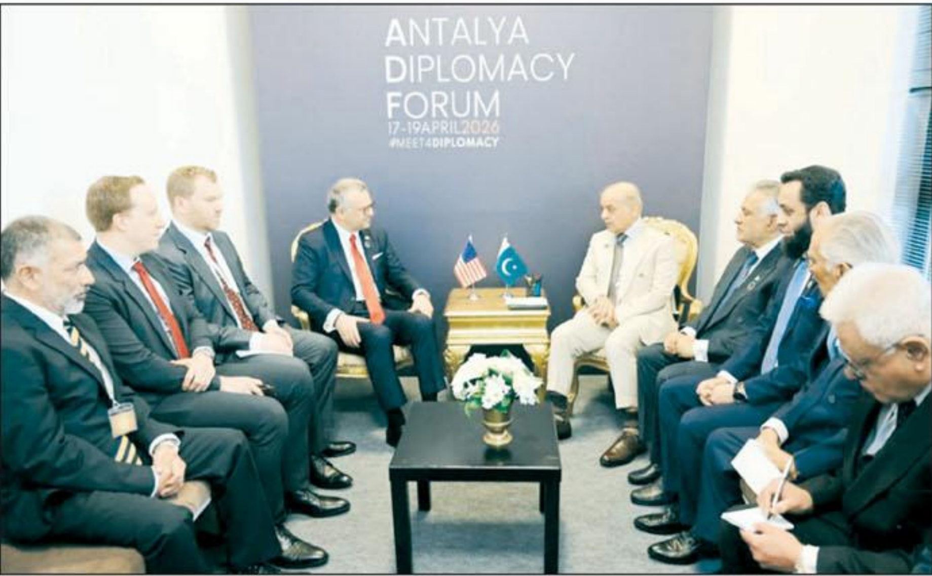
ANTALYA: Senior Advisor to the U.S. President for Arab and African Affairs, H.E. Mr. Massad Boulos calls on Prime Minister Muhammad Shehbaz Sharif, on the sidelines of the 5th Antalya Diplomacy Forum (ADF 2026) in Antalya, Türkiye.