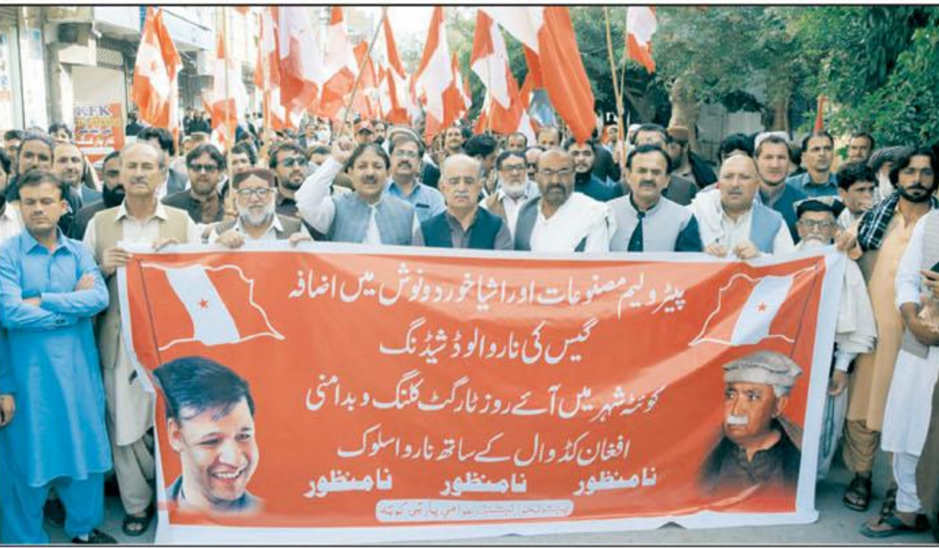
QUETTA: Pashtunkhwa Milli Awami Party activates hold protest against shortage of electricity and Sui Gas supply in Quetta city.