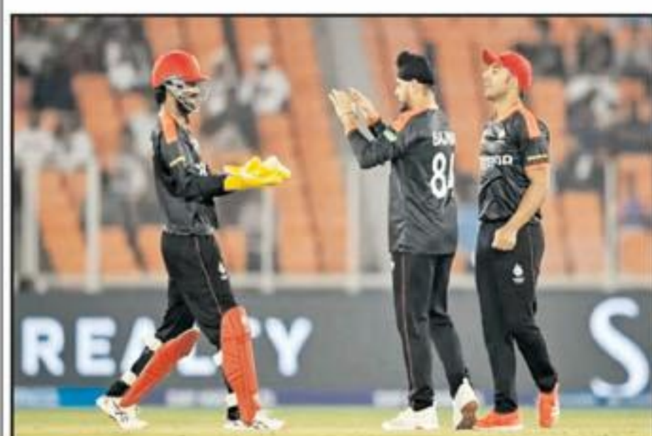
This image shows Canada captain Dilpreet Bajwa during the match against South Africa during the T20 World Cup.

"Where matters are raised, we are committed to reviewing them responsibly and taking appropriate steps as needed."