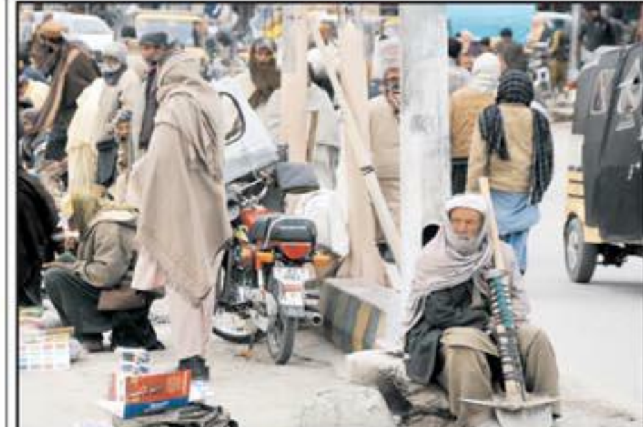
QUETTA: Daily wages labour sit with their work tools at Bacha Khan chowk looking some work.

Highlighting the Pakistan Peoples Party's democratic milestones, Senator Khalid said the 18th Constitutional Amendment, passed during the presidency of Asif Ali Zardari, strengthened the parliamentary system and granted provinces the autonomy.