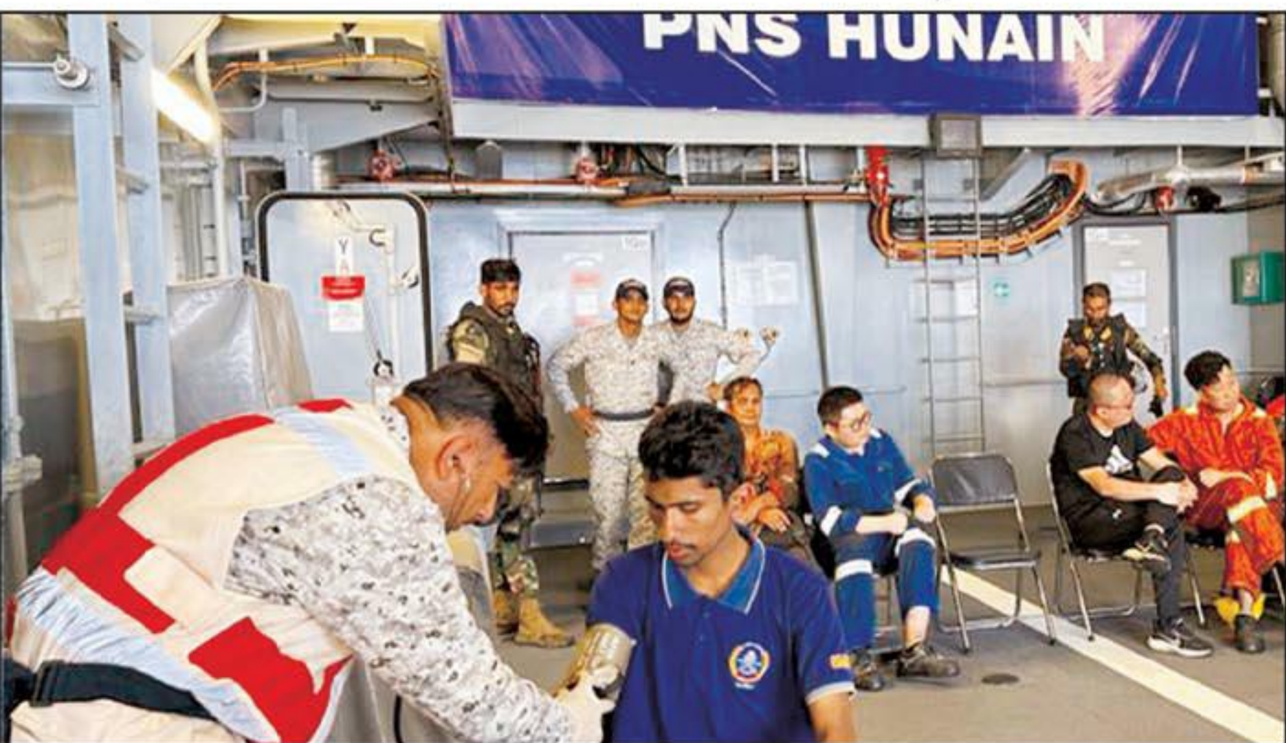
KARACHI: Pakistan Navy undertakes rescue operation for crew of MV.GOLD AUTUMN off Pakistan coast.