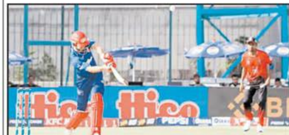
ISLAMABAD United opener Devon Conway in action during the Pakistan Super League match against Lahore Qalandars at the National Bank Stadium.

Sikandar Raza attempted to rebuild with a measured knock, striking boundaries through placement rather than power, but scoring remained laborious. The Zimbabwean all-rounder eventually departed for 25 off 19 balls in the 16th over, sweeping Green straight to short fine leg as the Qalandars' hopes, who were now 91-7, of a late recovery faded.