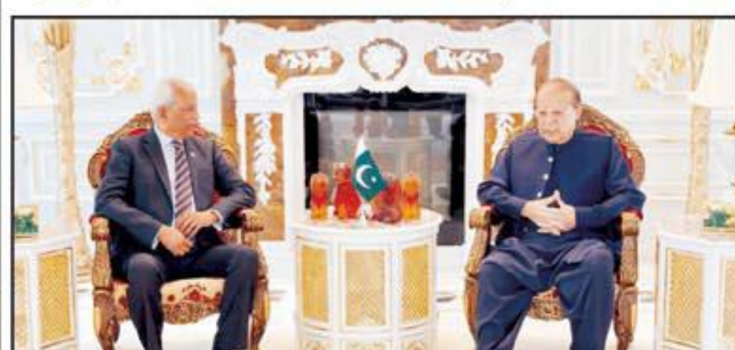
LAHORE: PML-N leader Nawaz Sharif in a meeting with Sindh Governor Syed Nihal Hashmi.

adding that the evacuated crew members were safely transported to Karachi for further medical care and subsequent repatriation to their respective countries.