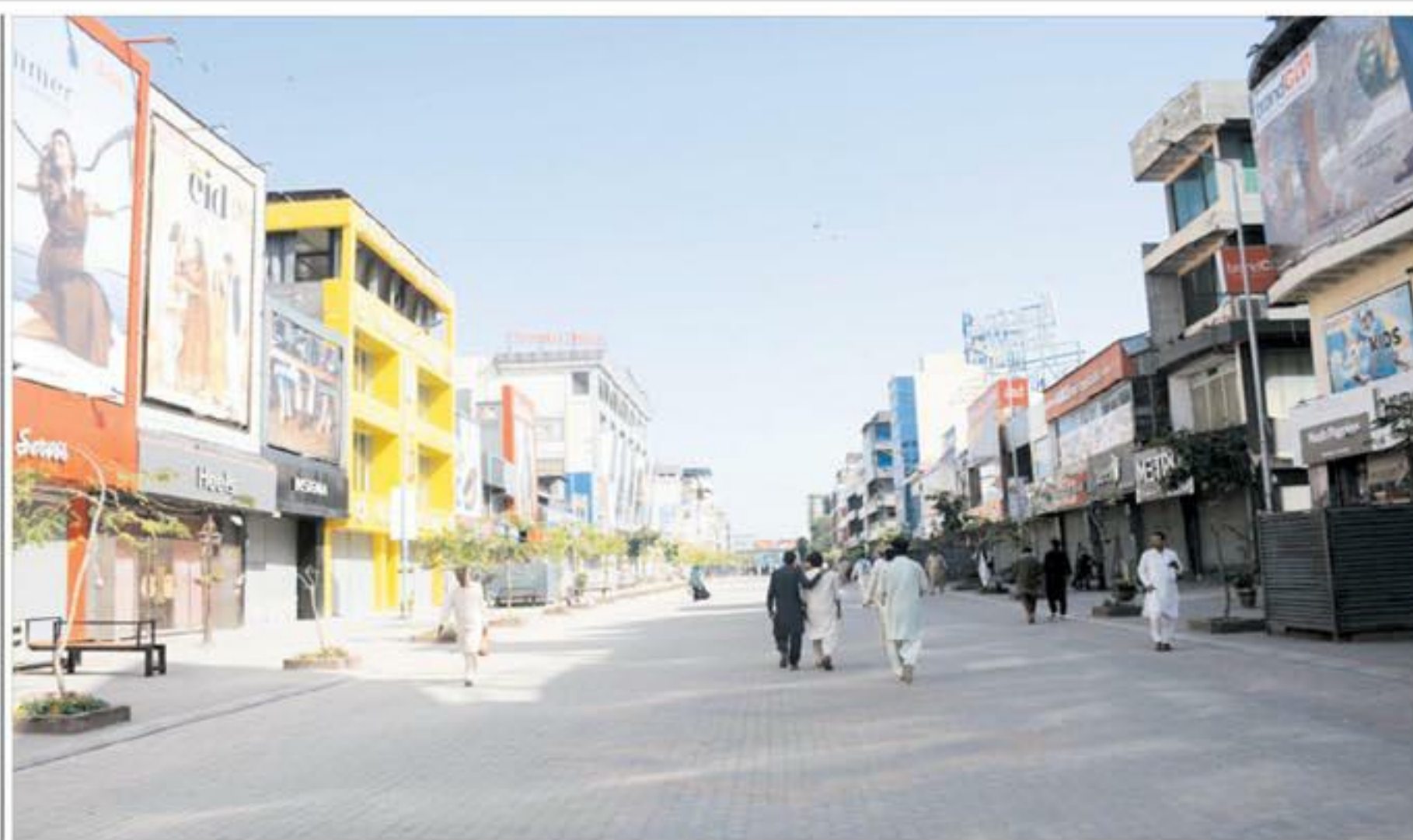
RAWALPINDI A closed view of Saddar Bazaar in Pakistan, as peace talks between Pakistan, Iran, and the US take place, with the area shut down for security reasons.

However, he cautioned that the road ahead remains complex.