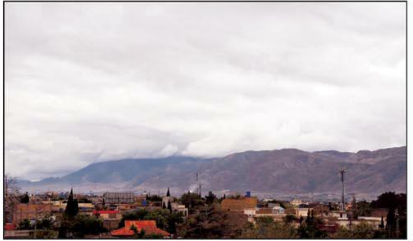
QUETTA: A view of clouds hovering over sky in provincial capital.

He particularly appealed to religious scholars and the general public to offer special prayers during Friday sermons, urging them to pray for the success of ongoing negotiations and for lasting peace in the region and across the world.