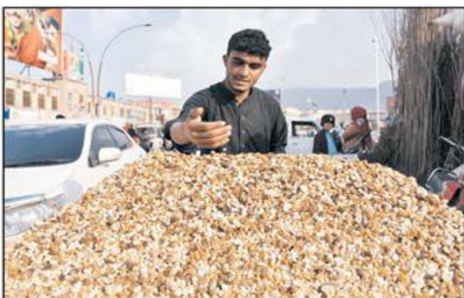
QUETTA: A vendor selling dry fruit on his hand cart.