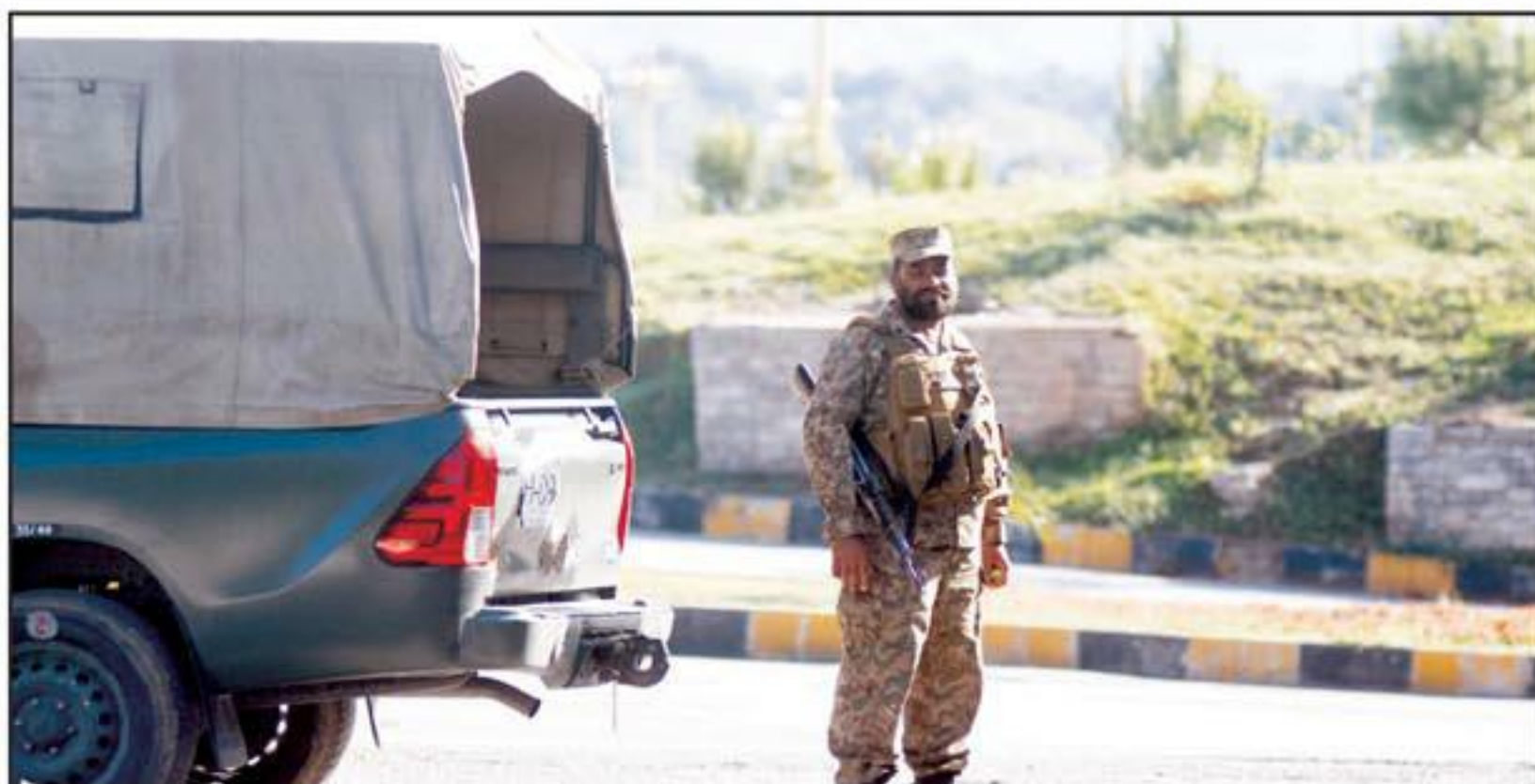
ISLAMABAD: An army personnel stand alert at D Chowk in the Federal Capital as the security tighten for Iran-US talks. Islamabad host talks between the United States and Iran on a resolution to the war and the Strait of Hormuz, which remains at a standstill despite the ceasefire.

restoration of Shahu Qalandar Shrine has not only given new life to a spiritual center but also added a beautiful and significant addition to the ancient heritage of the province. During the visit, the Chief Minister also inaugurated the newly established Women Skill Development Center under the FC Balochistan (South) Parwaz Foundation.