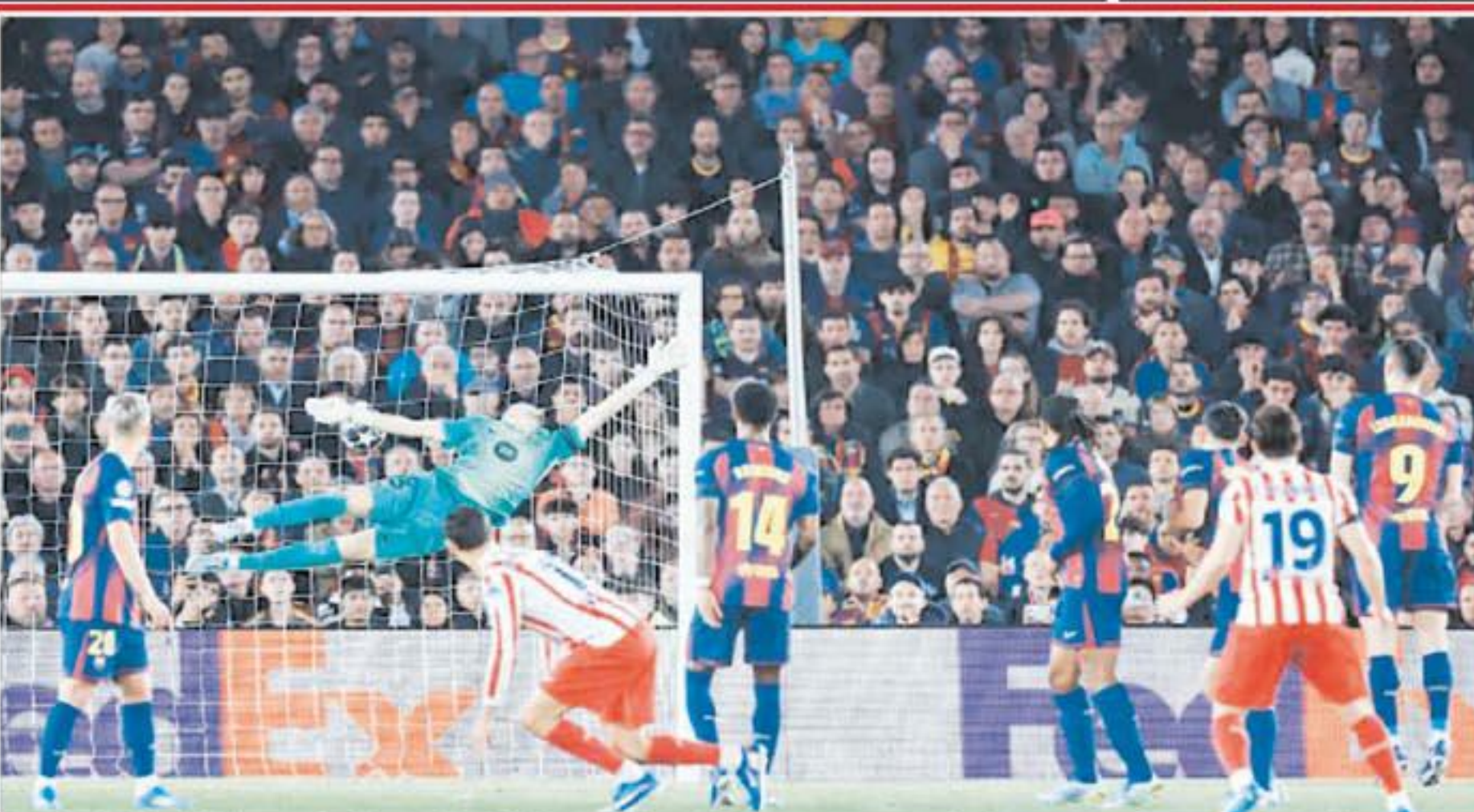
BARCELONA: Atletico Madrid's Julian Alvarez (second R) scores from a free-kick past Barcelona goalkeeper Joan Garcia during their Champions League quarter-final first leg at Camp Nou.