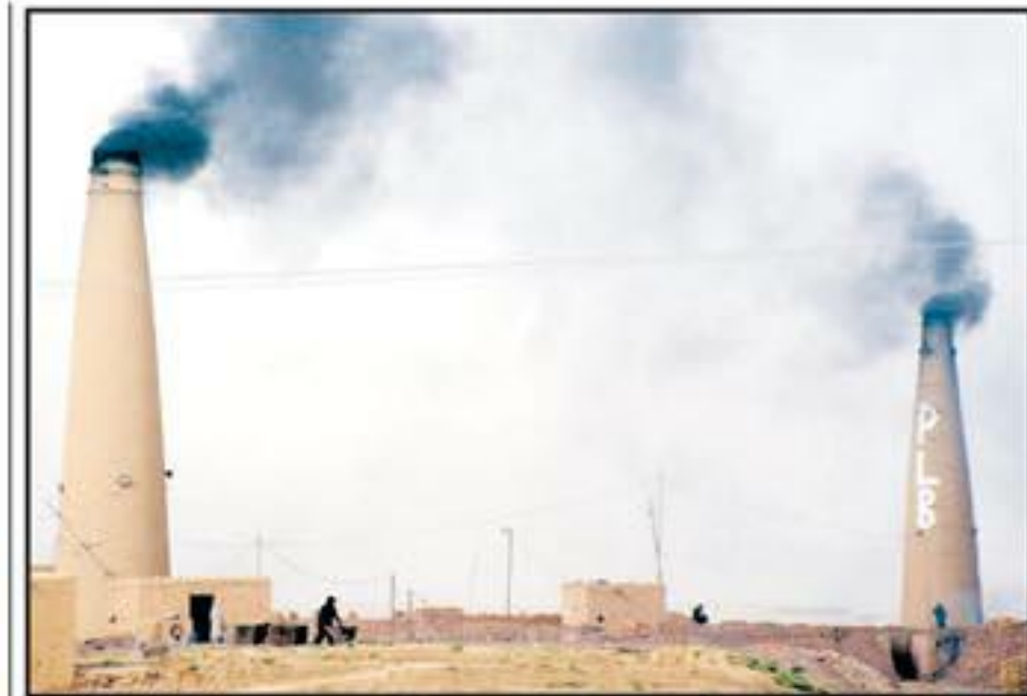
QUETTA: : A labour busy in work local bricks kilns on the eve of International Labor Day on 1 May.