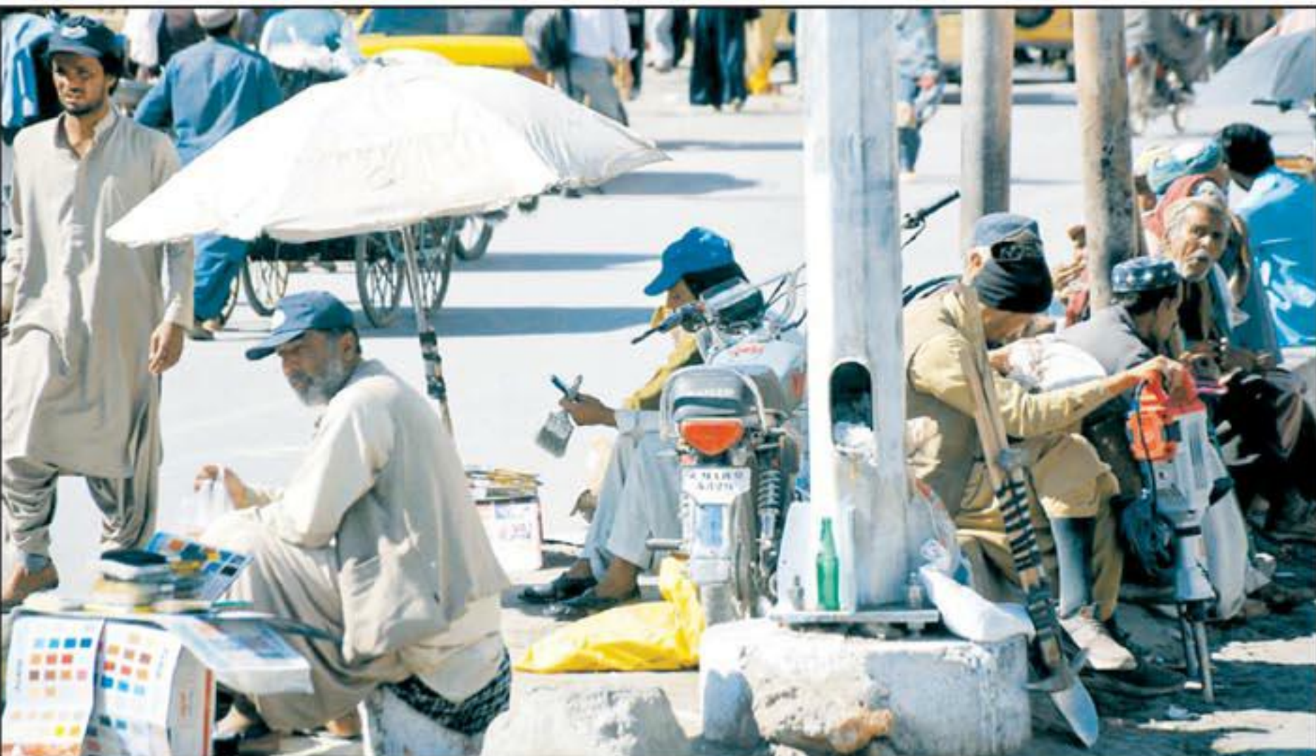
QUETTA: Daily wages laborers sitting on Bacha Khan Chowk with their work tools looking some work on the eve of International Labor Day on 1 May.

He added that Prime Minister Shehbaz Sharif, Deputy PM and Foreign Minister Ishaq Dar, and Chief of Defence Forces and Chief of the Army Staff Field Marshal Asim Munir were engaged with key stakeholders, maintaining "open channels of communication" with both sides.