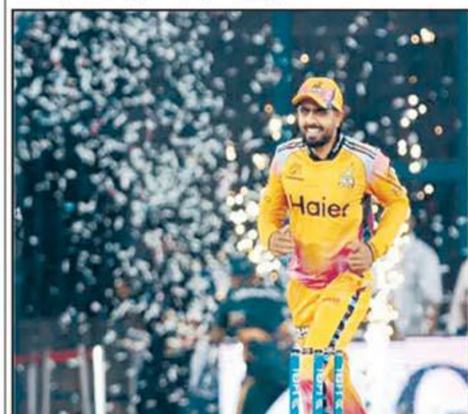
PESHAWAR Zalmi captain Babar Azam smiles after the win against Islamabad United in the Pakistan Super League Qualifier at the National Bank Stadium.

"Time teaches you everything," he reflected. "With time and experience, you keep learning."