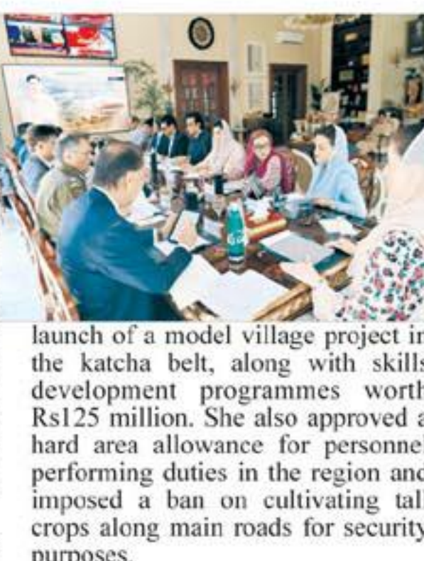
launch of a model village project in the katcha belt, along with skills development programmes worth Rs125 million. She also approved a hard area allowance for personnel performing duties in the region and imposed a ban on cultivating tall crops along main roads for security purposes.