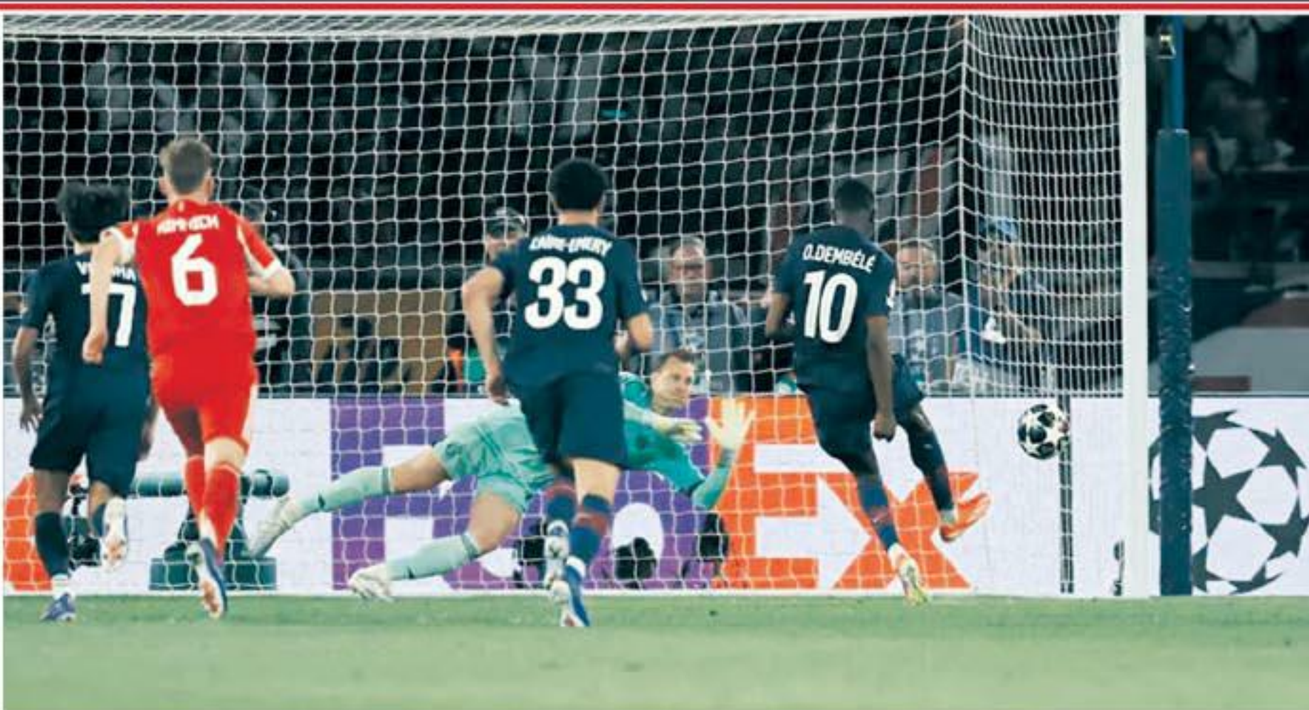
PSG'S Ousmane Dembele scores from the penalty spot past Bayern Munich goalkeeper Manuel Neuer during their Champions League semi-final first leg at the Parc des Princes Stadium.