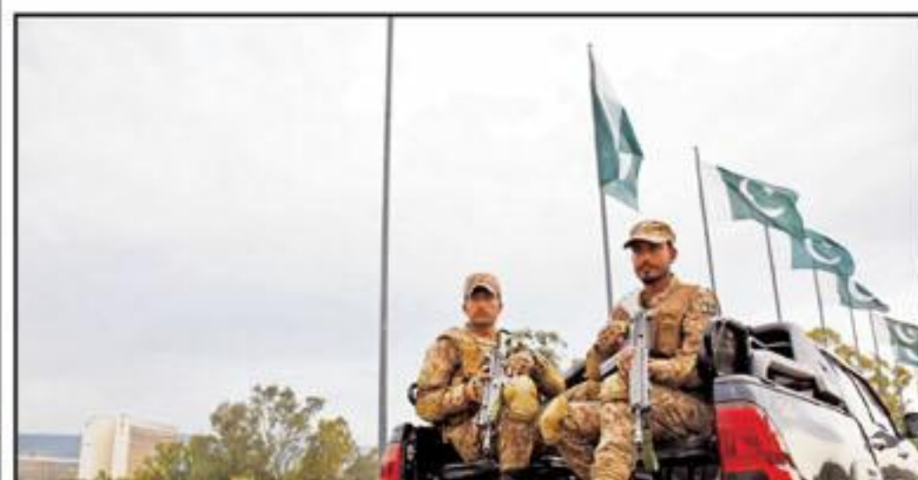
ISLAMABAD: Pak Army personals patrolling on zero-point bridge at Srinagar Highway during security high alert, in the Federal Capital, as Pakistan prepares to host the U.S. and Iran for the second phase of peace talks.

He said the people of occupied Kashmir were fighting against the usurping Indian army and continued to resist Indian occupation. Experts say the Field Marshal's historic words represent a complete defence doctrine, combining military preparedness, national resolve and Pakistan's principled stance on Kashmir.