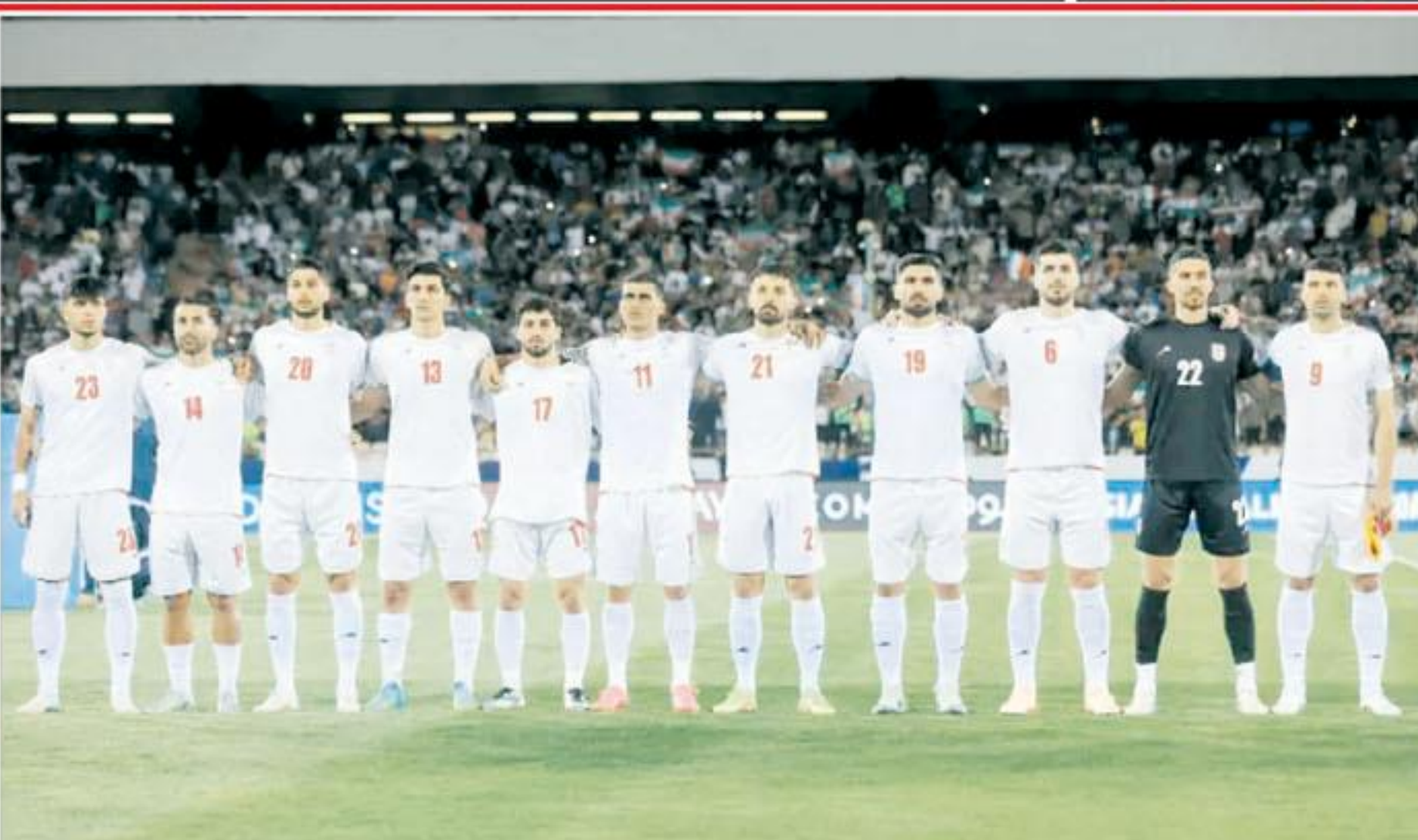
Iran players line up before the match.

Mitchell found support in Dian Forrester, who finished unbeaten on 13 and struck the winning boundary, sealing a comfortable victory with 11 balls to spare.