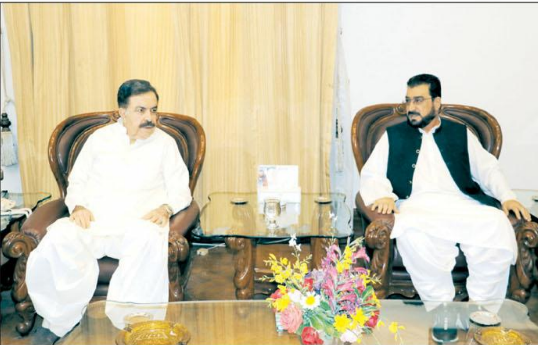
QUETTA: Governor Balochistan Jaffar Khan Mandokhel in a meeting with Provincial Minister Mir Asim Kurd Galo.

Opportunities to serve suffering humanity and the country should not be wasted, for therein lies peace of mind.