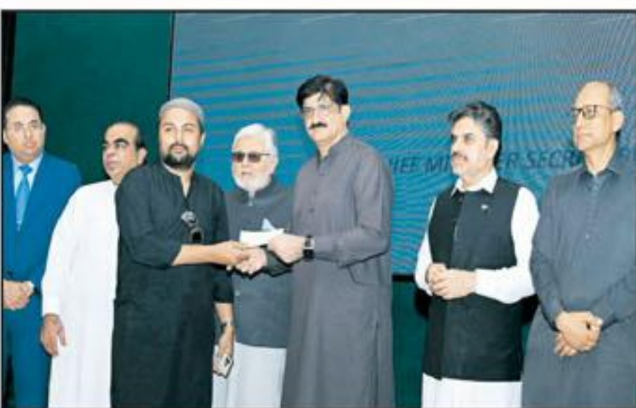
Sindh Chief Minister Syed Murad Ali Shah Distributes Compensation Cheques to Gul Plaza Tragedy Affectees at CM House Ceremony in Karachi.