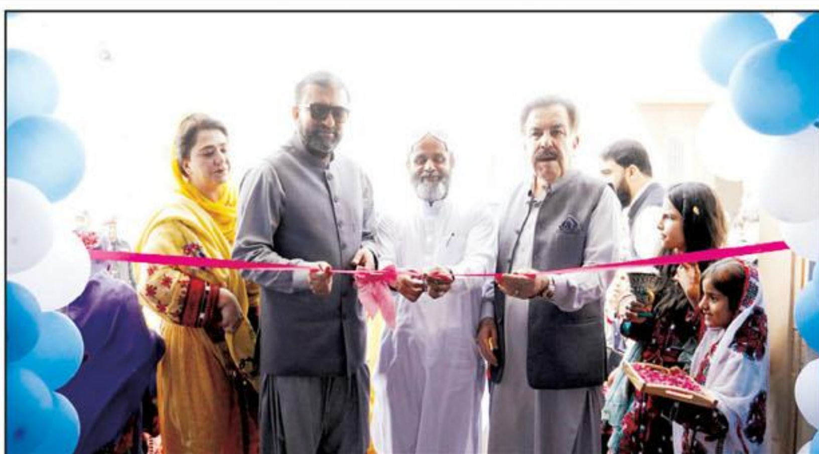
QUETTA: Balochistan Chief Minister Sarfraz Bugti has inaugurated the first-ever women's market, Gwadar Women Bazaar, in the coastal city of Gwadar.

Israel's ambassador to Washington, Yechiel Leiter, said that his country wanted a peace deal with the Lebanese government and believed Hezbollah has been weakened by the attacks on Iran's cleric-run state.