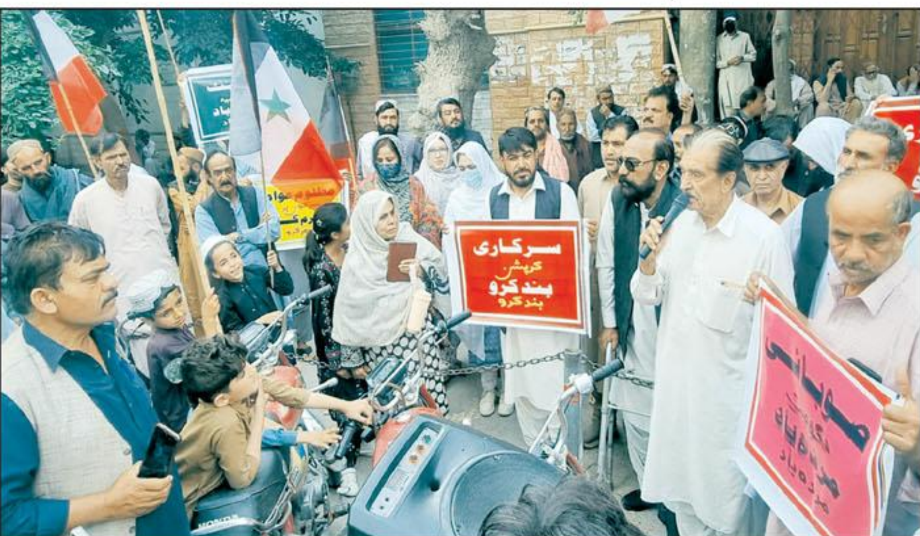
Members of Mazloom Olsi Tehreek Hold Protest Demonstration at Quetta Press Club for Acceptance of Key Demands

A total of 46 officers graduated from the 124th National Management Course and were awarded certificates by the chief guest during the ceremony.