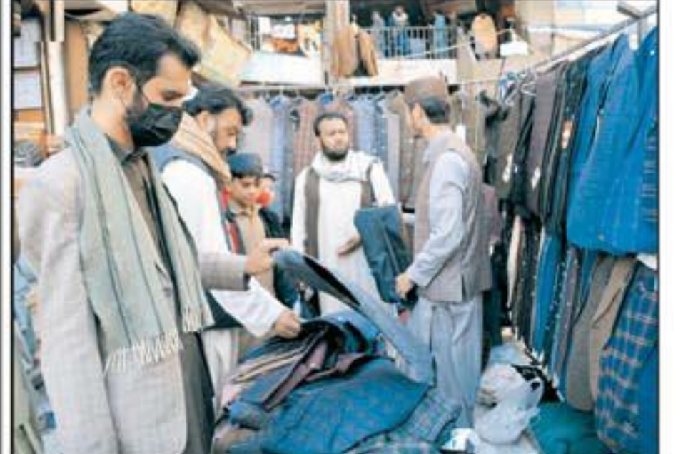
QUETTA: Peoples busy in eid shopping as Eid ul Fitr approaching.

and subsequent Buddhist, Hindu, and Muslim rule. Brig Gul remarked that during the British Raj, the Muslims of India who had hitherto been the rulers of the subcontinent had been relegated to second-class subjects, with the British often siding with the majority Hindus in India while creating and implementing policies. He said that this invariably created a sense of disenfranchisement among Muslims that grew along the way. The Pakistan resolution of 1940 was a commitment by the leaders of Muslim India to establish a state where their rights and dignity would be preserved.