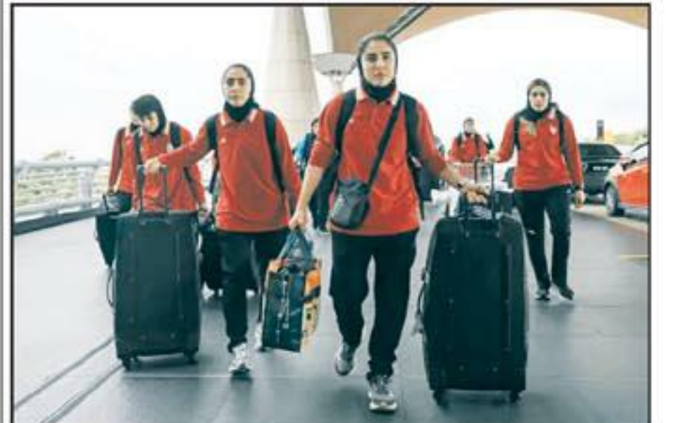
SEPANG: Members of Iranian women's football team arrive at the Kuala Lumpur International Airport .