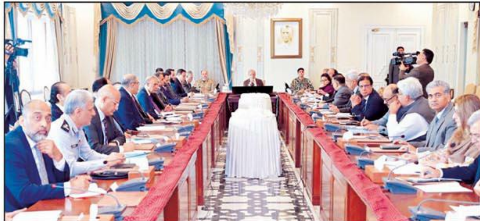
Prime Minister Muhammad Shehbaz Sharif Chairs Meeting on Austerity Measures Amid Regional and Global Challenges at PM House in Islamabad

It was informed that the country has an adequate stock of petroleum products to meet requirements. Implementation of the instructions issued by the Prime Minister is being ensured.