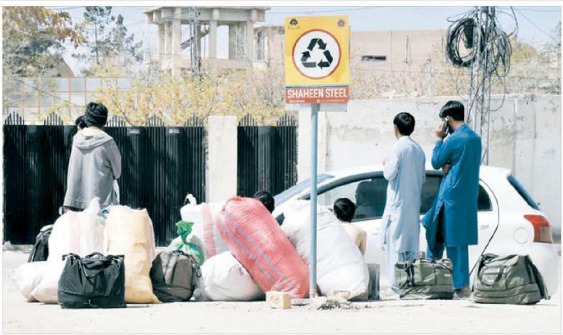
QUETTA: Peoples going railway station to leave Quetta going hometown to celebrate Eid Ul Fitr with their loves ones .

Maryam Nawaz serving people of Punjab like a caring mother: Azma Bukhari