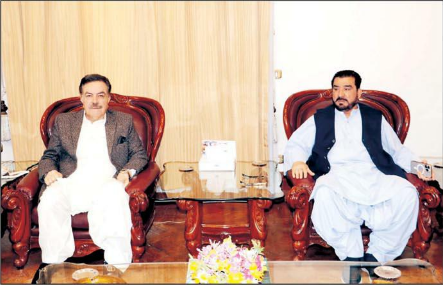
QUETTA: Governor Balochistan Jaffar Khan Mandokhel in a meeting with Provincial Minister Mir Asim Kurd Galo.

The QESCO has appealed to all agricultural consumers who have converted to solar energy to cooperate with QESCO in the process of returning transformers and other electrical equipment connected to their agricultural connections so that this project can be completed at the earliest.