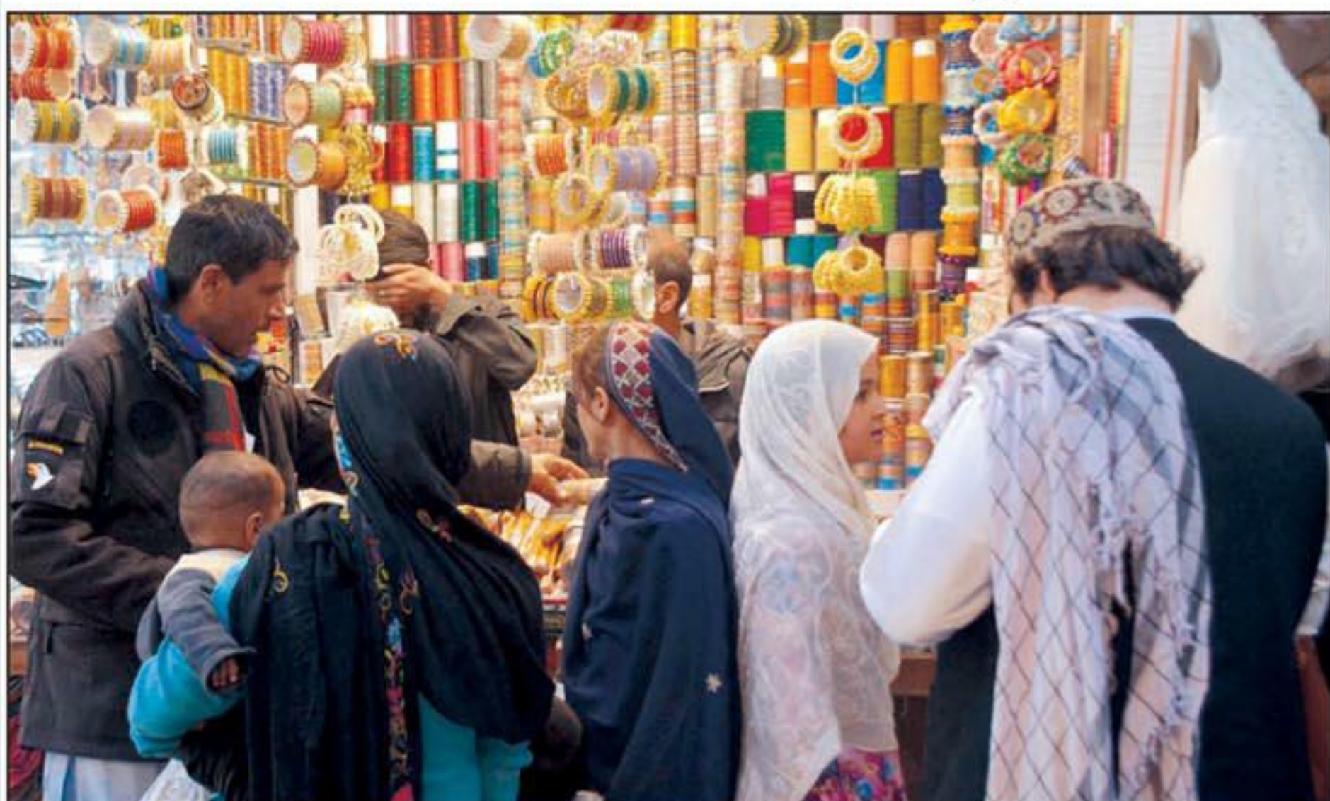
QUETTA: Peoples busy in eid shopping as Eid ul Fitr approaching.

Concluding the event, Senator Zehri reaffirmed her commitment to continuing public service and ensuring that all possible assistance is provided to those in need, with the aim of building a welfare-oriented and stable society.