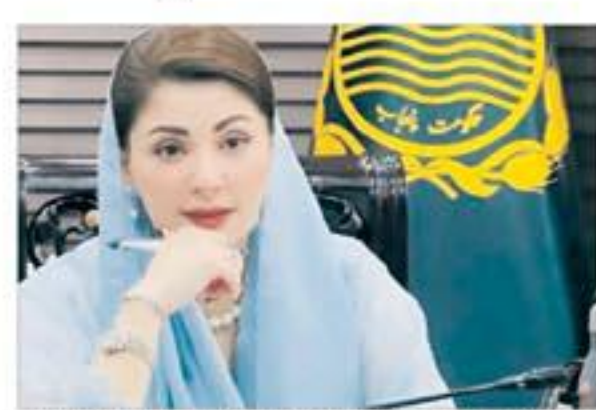
provide farmers with essential agricultural services, inputs and guidance under one roof. On the directions of Chief Minister Punjab Maryam Nawaz Sharif, construction of 10 additional Model Agriculture Malls is underway across Punjab to further facilitate farmers.

interns are working in the field to guide farmers and provide technical assistance. The presence of these interns is expected to help improve wheat production across the province. Through the CM Agriculture Internship Programme, many interns have also secured employment in the private sector after gaining practical experience in farming and crop management. As part of the initiatives introduced under the leadership of Chief Minister Punjab Maryam Nawaz Sharif, Model Agriculture Malls have been made operational in four major cities of the province. These malls