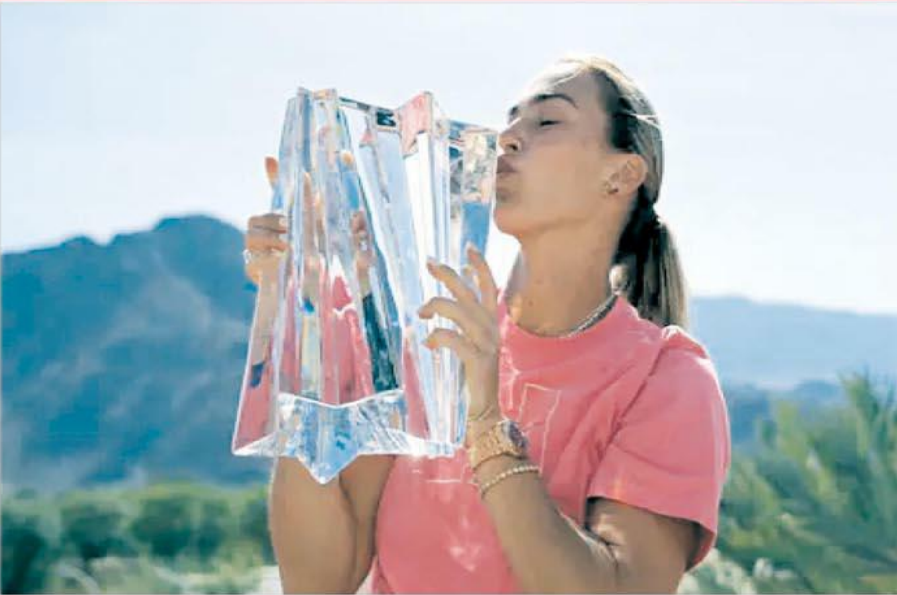
BELARUS' Aryna Sabalenka poses with the Indian Wells trophy after winning the women's final against Elena Rybakina of Kazakhstan at the Indian Wells Tennis Garden.