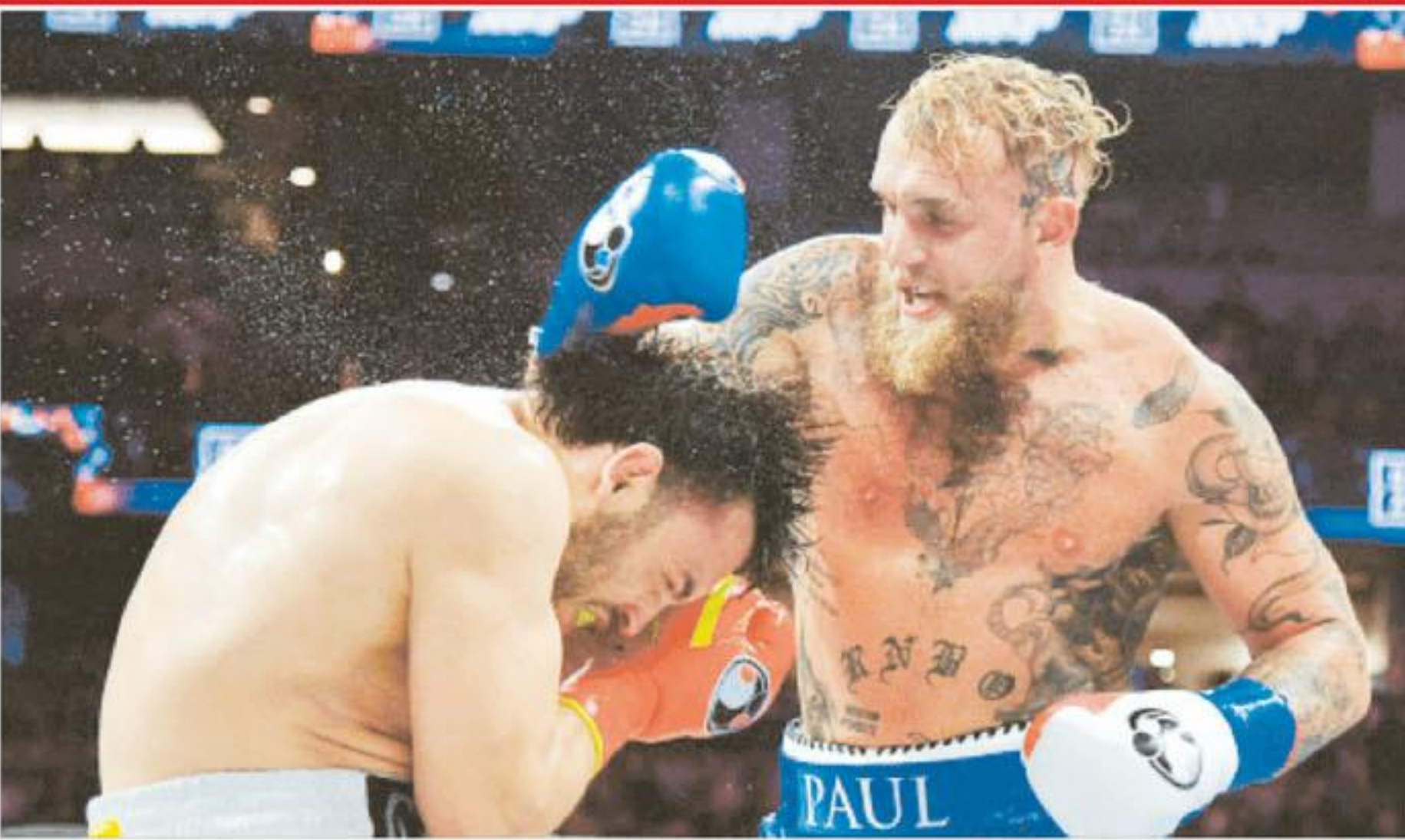
ANAHEIM (California): Jake Paul (R) fights Julio Cesar Chavez Jr. at Honda Center.