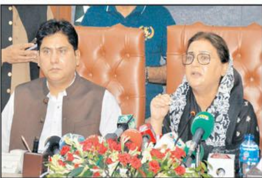
Punjab Information Minister Azma Bukhari addressing a press conference Commissioner office in the city.

She particularly lauded the Punjab Assembly for setting exemplary standards in reinforcing the constitutional supremacy and contributing to the unity of the Federation of Pakistan.