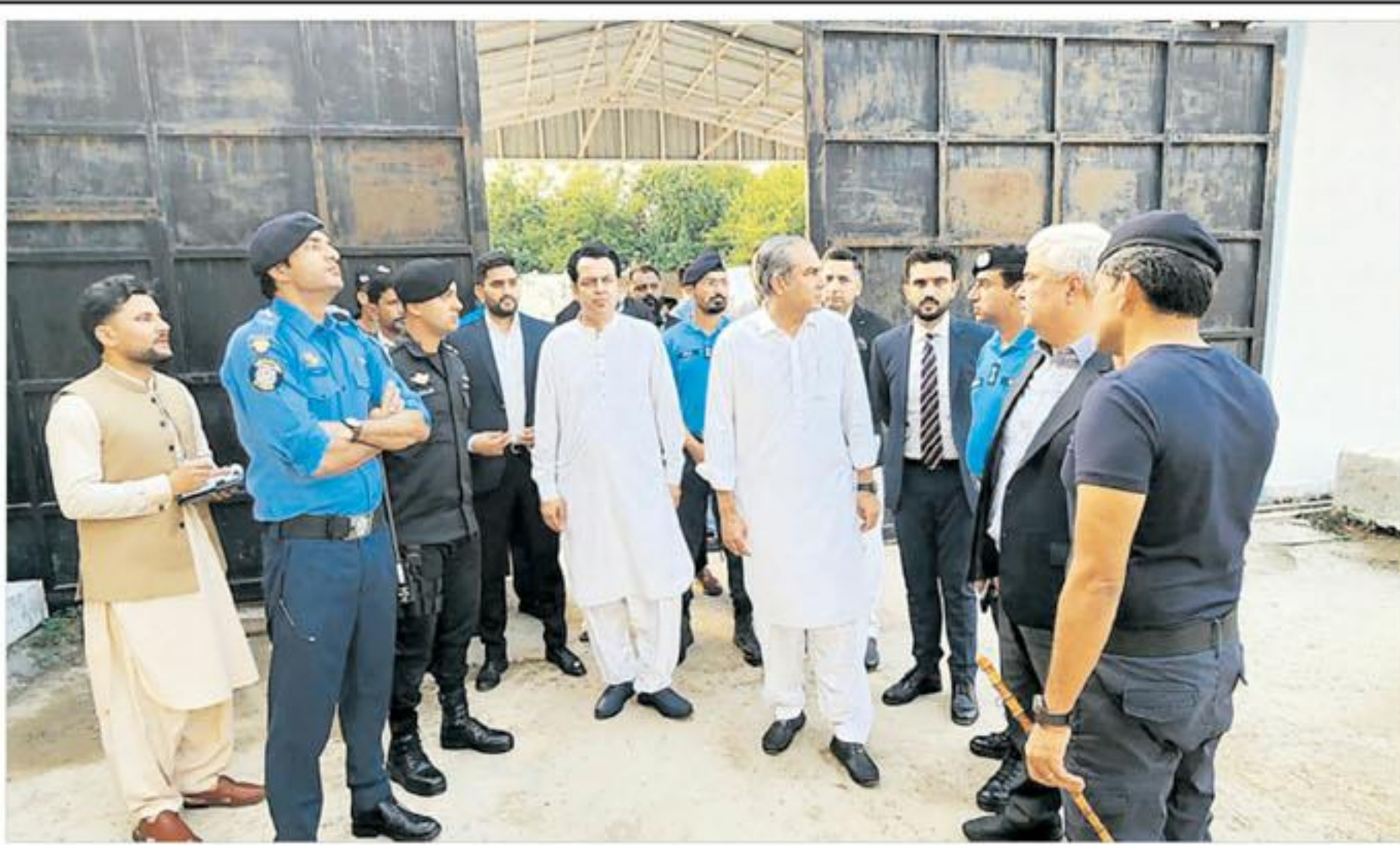
ISLAMABAD: Federal Interior Minister Mohsin Naqvi along with Minister of State for Interior Talla Chaudhary visiting the Central Imambargah Asna Ashari in G-6, Islamabad.

Highlighting the broader challenges in the healthcare system.