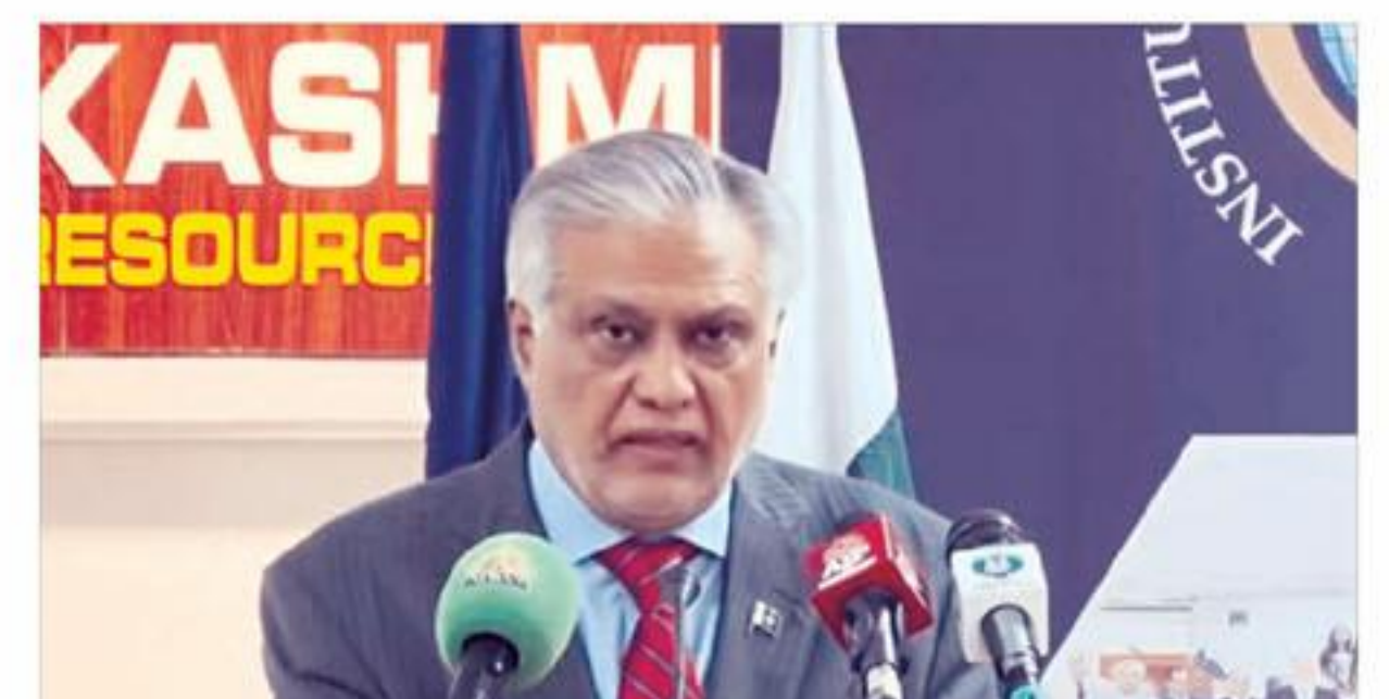
ISLAMABAD: Deputy Prime Minister and Foreign Minister Ishaq Dar on Monday reaffirmed Pakistan's commitment to a foreign policy rooted in geo-economics and unwavering adherence to international peace and security.

He emphasized that sustainable peace in South Asia remained contingent on a just and lasting solution of the Jammu and Kashmir dispute in accordance with the UN Security Council resolutions and the wishes of the Kashmiri people. As regards the recent developments in the Middle East, DPM Dar said Pakistan condemned Israel's completely unjustified aggres-