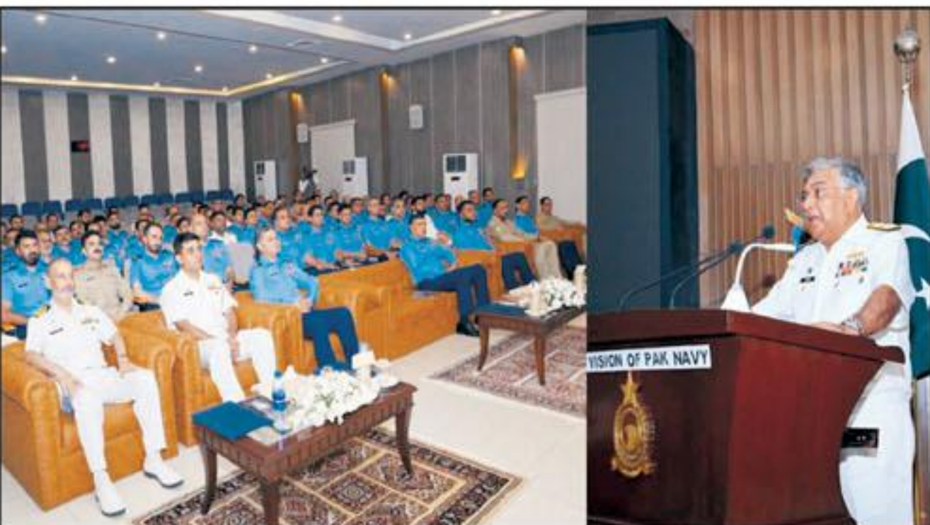
Karachi : Admiral Naveed Ashraf, Chief of the Naval Staff, Pakistan Navy, addressing the participants of Air War Course at PAF Air War College Institute.