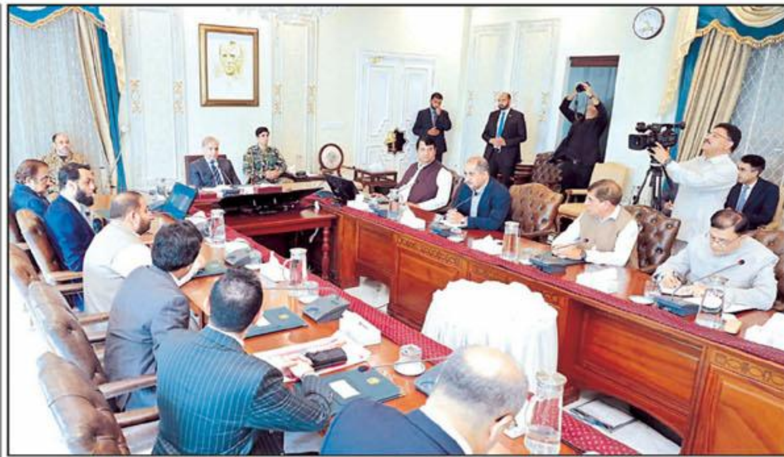
ISLAMABAD: Prime Minister Muhammad Shehbaz Sharif chairs a meeting with regard to promotion of tourism in the country.

The court noted that it had thoroughly reviewed the treaty and found no provision that allows either party to suspend it unilaterally. The ruling comes in response to India's announcement on April 23, 2025, declaring the immediate suspension of the Indus Waters Treaty following a militant attack in Pahalgalam.