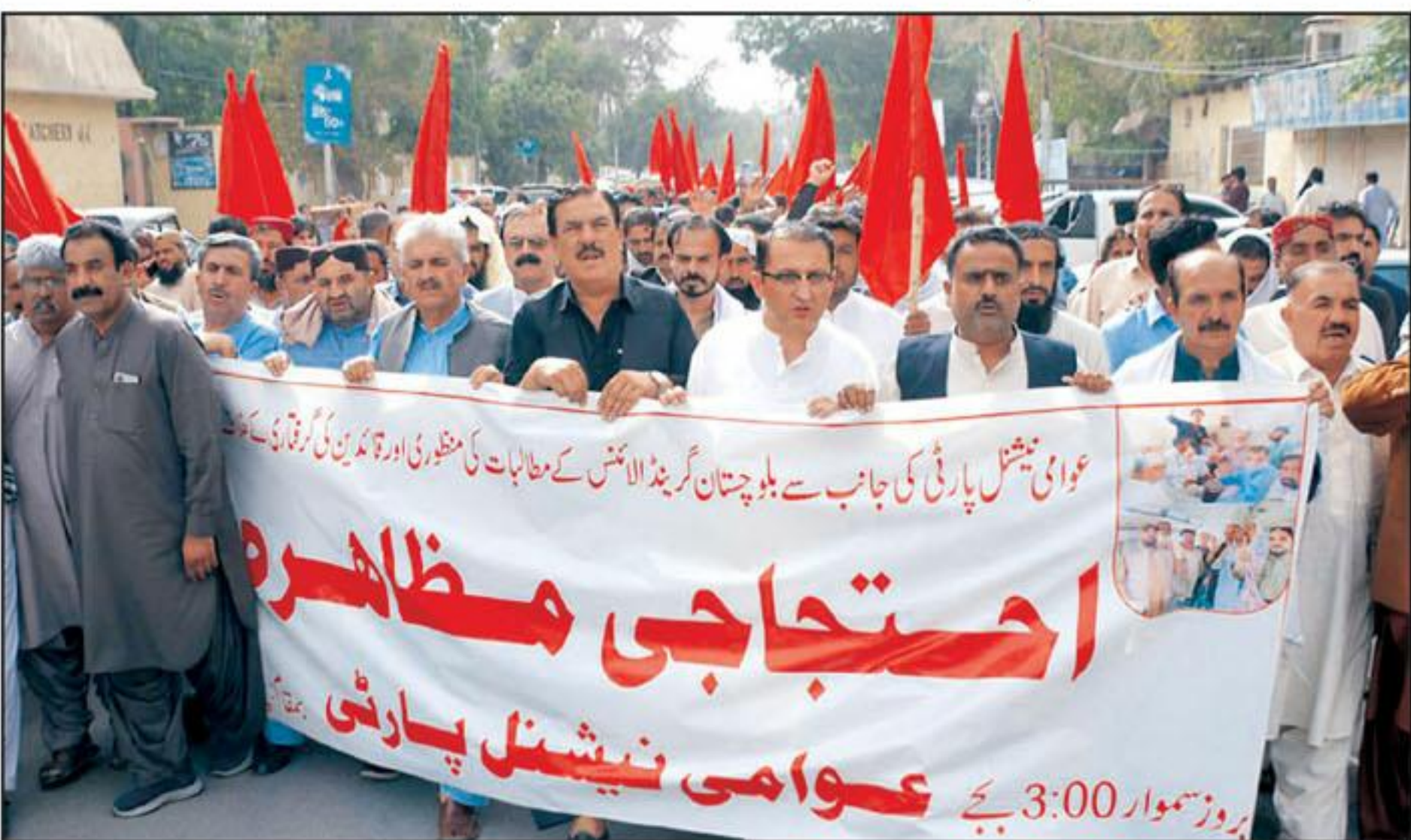
QUETTA: Activists of ANP hold protest rally.

The Chairman stated that the authority, in close coordination with provincial and district administrations, is actively engaged in efforts to reduce potential risks and enhance preparedness. He emphasized that NDMA plays a pivotal role in providing timely early warnings to all relevant agencies to ensure swift response to potential emergencies.