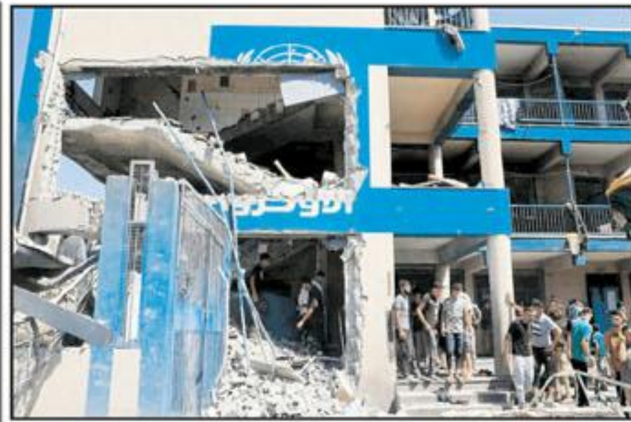
Gaza - A view of a damaged UNRWA facility, as the agency reports that over 810 civilians have been killed by Israeli forces while sheltering in its premises across Gaza since the beginning of the war.

Reaffirming her belief in democracy, she said, "Through a strong and inclusive parliament, we can strengthen our institutions and work collectively for the progress and prosperity of the nation."