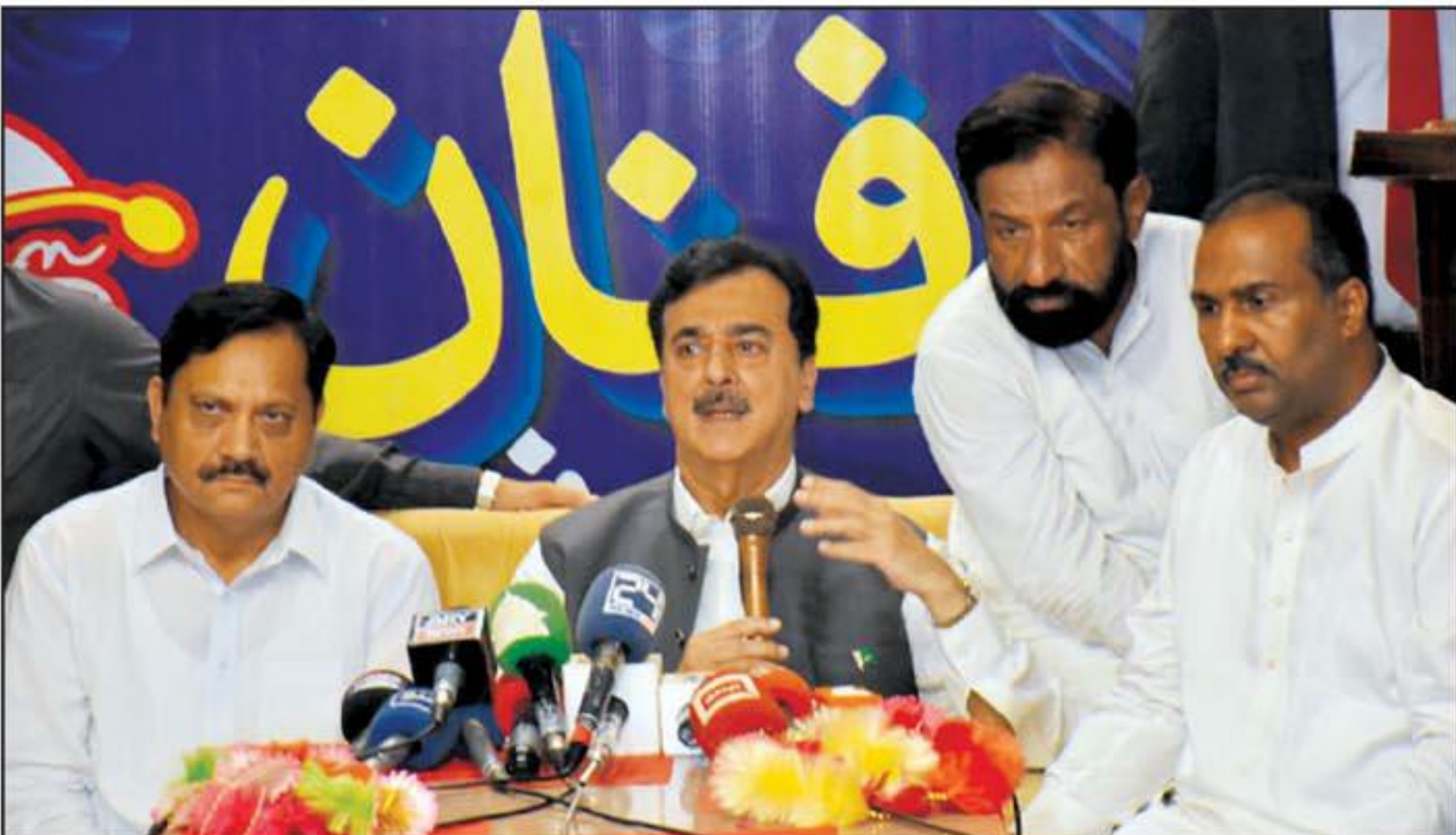
Chairman Senate, Syed Yousuf Raza Gilani addresses to media persons during press conference, in Multan .

The exchanges highlighted the need for closer global coordination and the role emerging markets like Pakistan can play in shaping the next chapter of the digital economy.