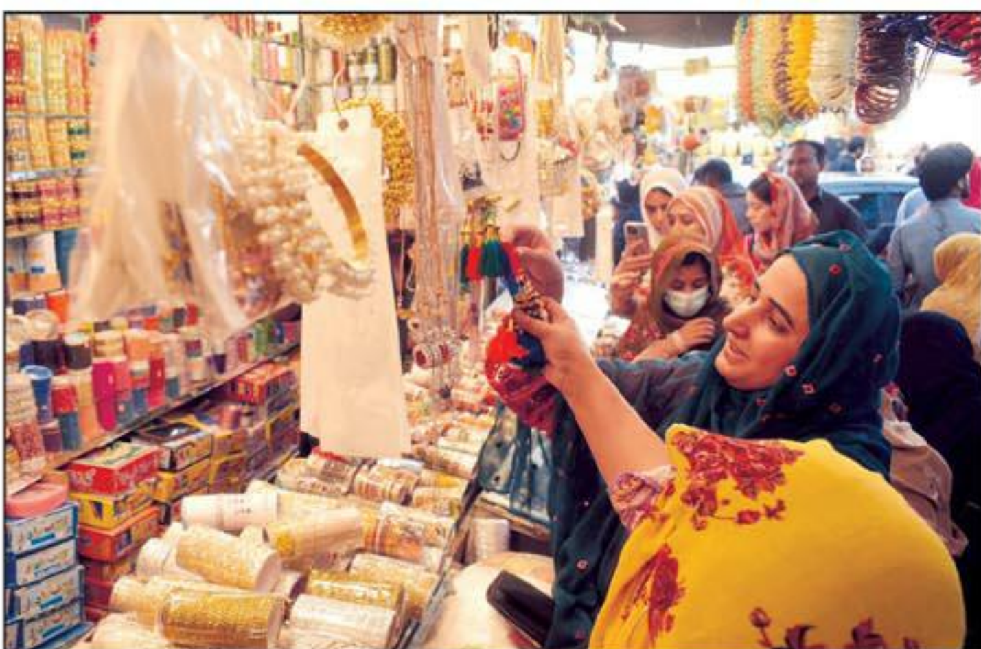
QUETTA: Women buying artificial jewelry on the eve of Eid-ul-Azha.

judicial traditions of Pakistan. Legal experts have expressed optimism that Justice Rozi Khan Bareech's tenure will contribute to strengthening judicial independence and promoting timely dispute resolution in the province.