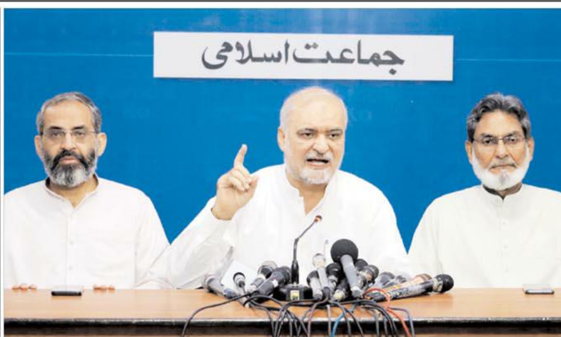
Jamate-Islami (JI) Chief, Hafiz Naeem-ur-Rehman addresses to media persons during press conference, at Idara-e-Noorul Haq in Karachi.

Both religious events will be celebrated with full devotion at Gurdwaras across Pakistan, where local Sikh communities will participate.