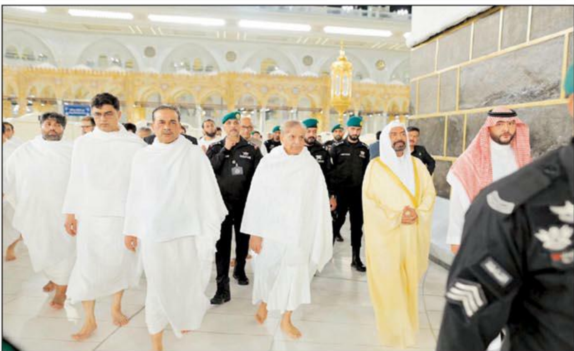
MAKKAH, SAUDI ARABIA: Prime Minister, Muhammad Shehbaz Sharif along with Field Marshal Syed Asim Munir, Chief of Army Staff (COAS) and Pakistani delegation are performing Umrah in Makkah.