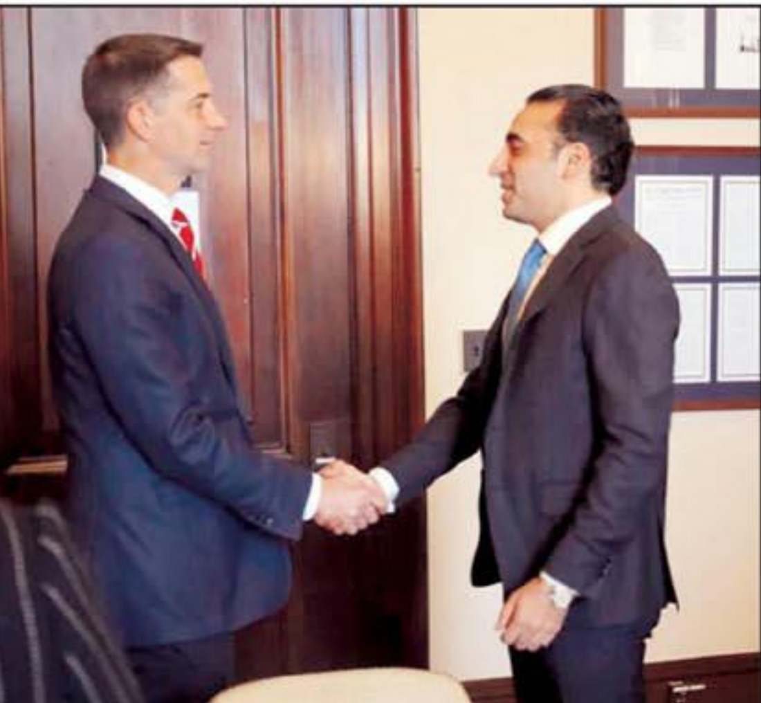
Former foreign minister and Pakistan Peoples Party (PPP) Chairman Bilawal Bhutto-Zardari (left) meets US Senator Tom Cotton.

The operation continues with ongoing sanitisation efforts to eliminate any remaining threats in the area. The ISPR reaffirmed Pakistan's commitment to eliminating Indian-sponsored terrorism and bringing the perpetrators to justice.