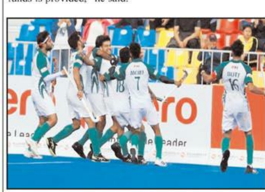
Pakistan team celebrates scoring a goal during Asian Champions Trophy match against China

already provided funds. No new funds will be released for any federation until the record of previously allocated funds is provided," he said.