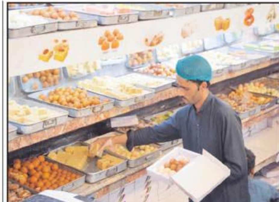
QUETTA: A shop keeper arranging sweet due to high demand on the eve of Eid-ul-Azha.

She also emphasized strict implementation of official transport fares across all cities. In this regard, transport vehicles must display fare lists and valid fitness certificates on their windshields. Overcharging will not be tolerated — extra fares must be refunded, and strict action will be taken against violators. Maryam Nawaz Sharif directed livestock officials to ensure their presence in cattle markets, while administration and police officers have been instructed to stay active in the field.