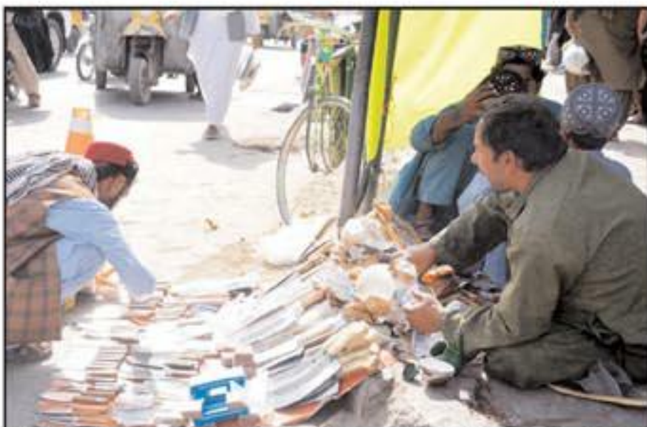
Knives are being selling at a shop in connection of Eid-ul- Azha coming ahead, in Quetta.

He further elaborated that concerted efforts are underway to enhance women's participation across critical sectors, including health, education, and employment.