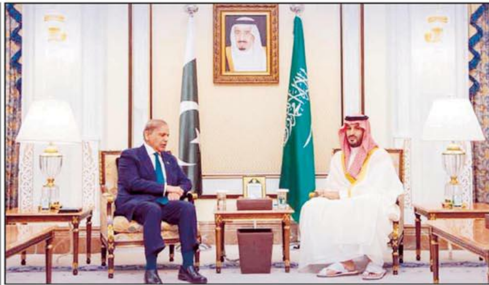
Prime Minister Shehbaz Sharif met Saudi Crown Prince Mohammed bin Salman at Mina Palace.

The delegation's recent series of meetings with US lawmakers and diplomats come as part of Pakistan's diplomatic outreach initiative in the aftermath of the recent armed confrontation with India. Last month, both nuclear-armed neighbours carried out cross-border attacks against each other in the aftermath of the Pahalgam incident — wherein 26 tourists were killed in IIOJK — after which New Delhi launched airstrikes inside Pakistan prompting the latter to retaliate via Operation Bunyan-um-Marsoos.