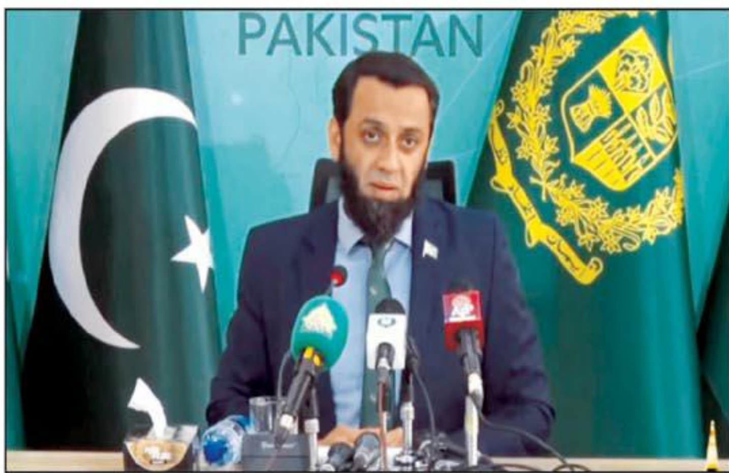
ISLAMABAD: Federal Minister for Information and Broadcasting Attaullah Tarar Addressing a press conference in Islamabad

"They celebrated the attack," he claimed, accusing Indian outlets of promoting fake news and giving excessive coverage to separatist elements.