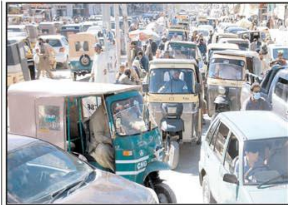
QUETTA: A view of Traffic jam in provincial capital due to eid shopping.

"One prisoner was killed in a shooting incident during the prisoner escape," the CM said. It should be noted that during the earthquake tremors in Karachi, 216 prisoners escaped from Malir Jail by breaking the walls. The prisoners snatched weapons from the police officers and opened fire. During the firing, one prisoner was killed and 5 were injured. Three FC personnel were also injured, and 87 prisoners were re-arrested from different areas, and 9 suspects were also taken into custody.