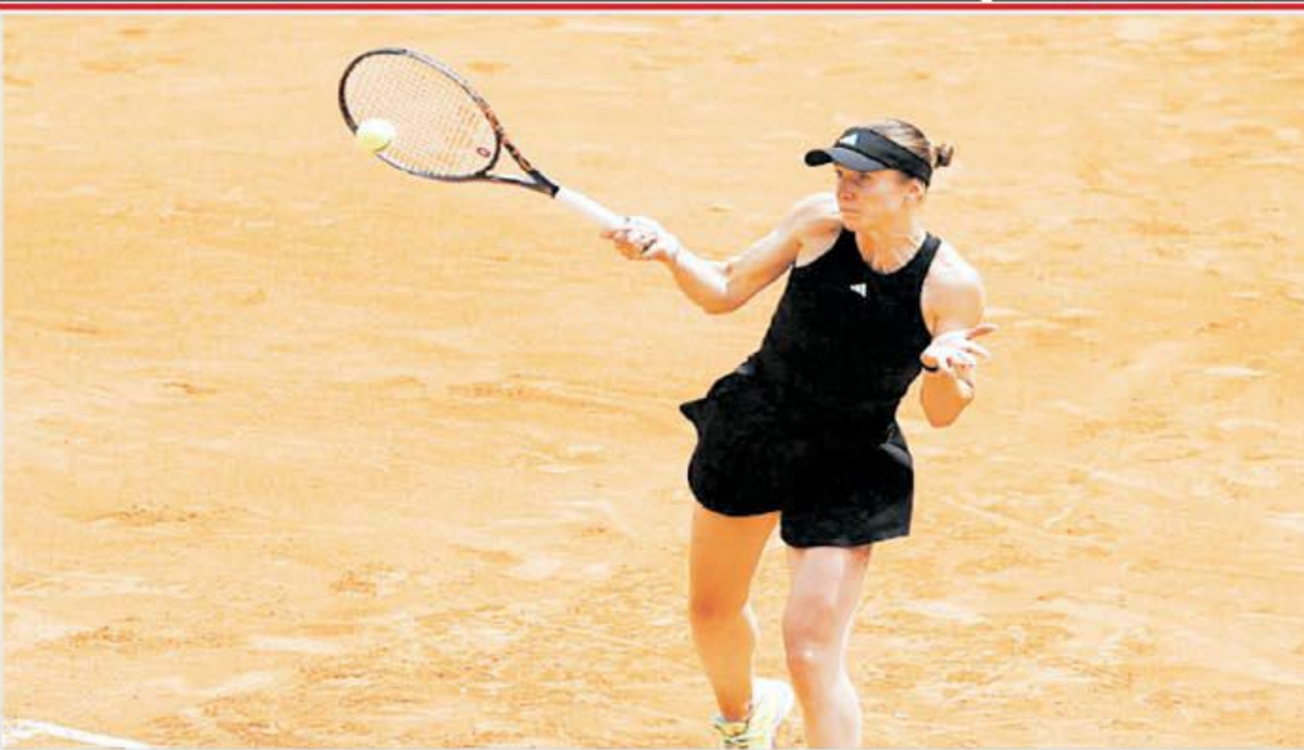
UKRAINE'S Elina Svitolina plays a forehand return against Iga Swiatek of Poland during their French Open quarter-final at Roland Garros.

"To be honest, we have had no discussions within the board about the Asia Cup," a top official of the Indian cricket board (BCCI) told Reuters on Tuesday, refusing to confirm whether the tournament will go ahead as scheduled.