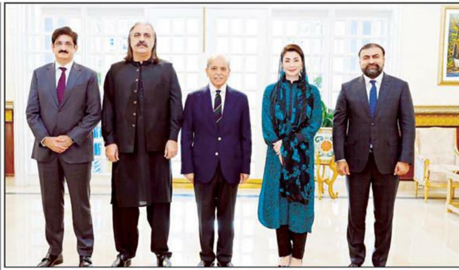
ISLAMABAD: Prime Minister Shehbaz Sharif in a group photo with Chief Ministers of the four Provinces before start of National Economic Council Meeting.

Mir Sarfraz Bugti stressed the need to prevent the misuse of the missing persons issue designed to defame state institutions at any cost.