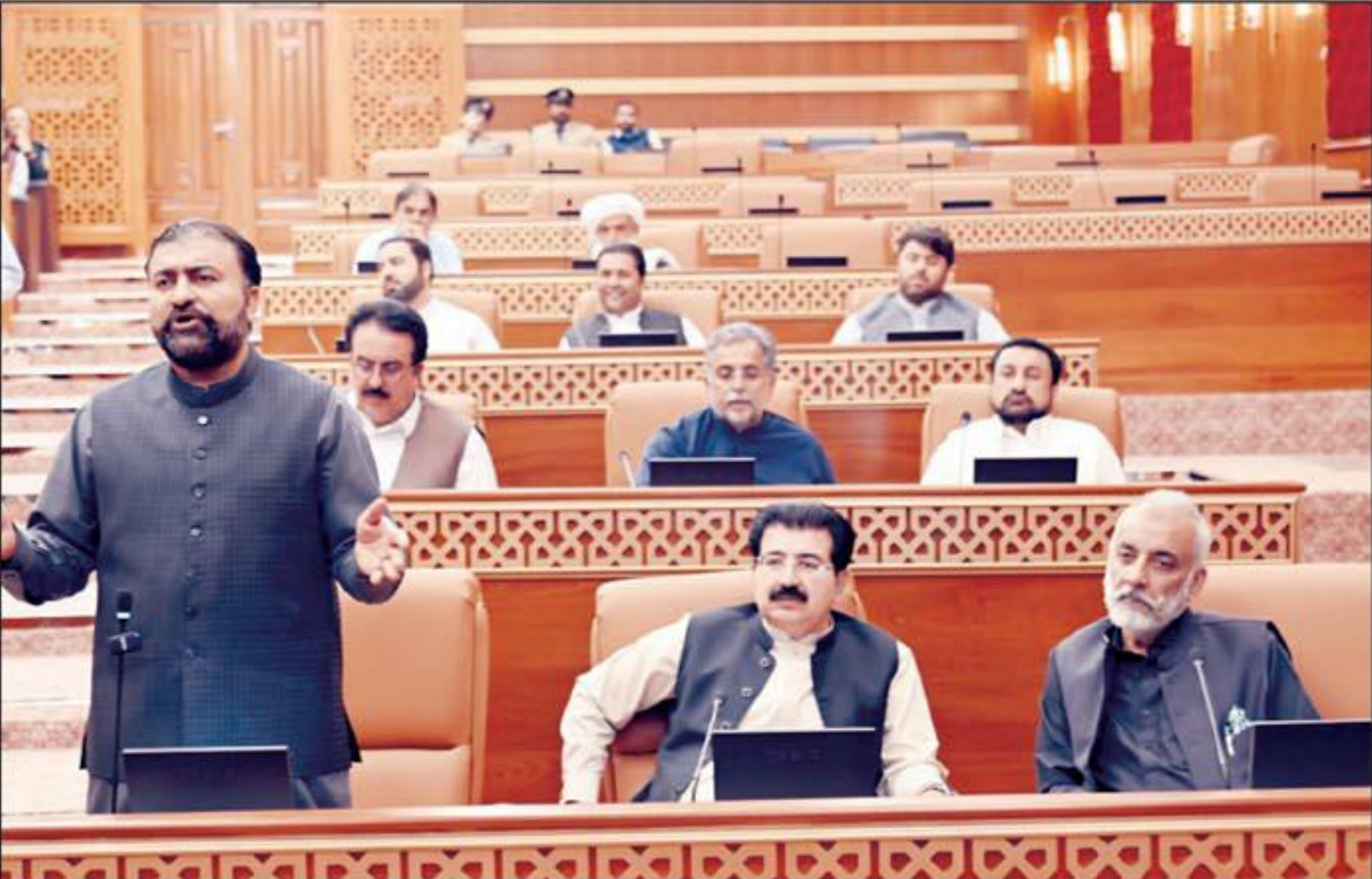
Chief Minister Balochistan, Mir Sarfraz Bugti speaking to inauguration of the new block and auditorium hall at the Balochistan Assembly in Quetta.

Taxi Stand, and Municipal Plaza. Jinnah Road, Liaquat Bazaar, and Airport Road have been declared no-parking zones, with Prince Road to follow. Solar streetlights will be installed city-wide, and sanitation improvements will be ensured under the Saafa Quetta campaign. He also mentioned the reactivation of the historic Café Baldia in central Quetta.