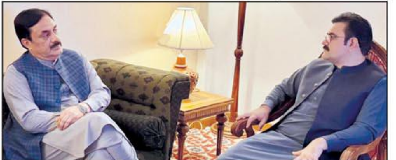
QUETTA: Deputy Chairman Senate Syedaal Khan Nasar in a meeting with Provincial Health Minister Bakh Muhammad Kakar.

Besides, the Saryab-Kachlak and Quetta-Chaman sections will be upgraded in collaboration with Balochistan government. Prime Minister Shehbaz commended Railways Minister Haneef Abbasi for the pace of reforms and new projects in Pakistan Railways. The meeting was attended by Federal Minister for Railways Hanif Abbasi, Adviser to the Prime Minister Dr. Tauqir Shah.