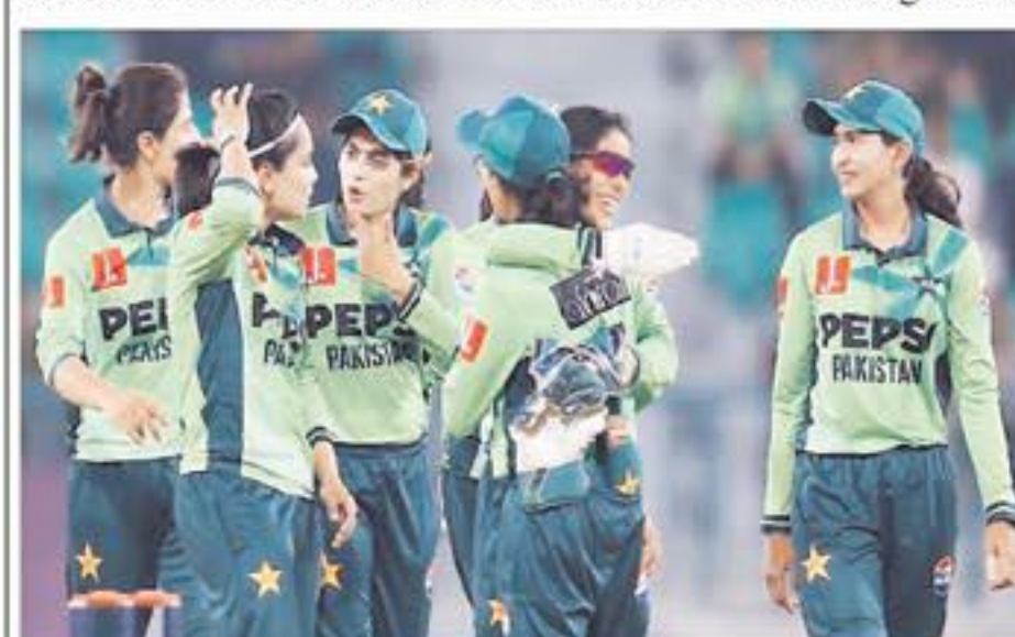
The highly anticipated final is scheduled for November 2, with the venue to be either Bengaluru or Colombo.

Regarding the knockout stages, the first semi-final is slated for October 29 in either Guwahati or Colombo. The second semi-final will be held on October 30 in Bengaluru.