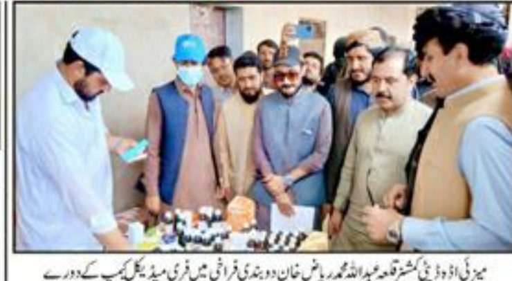
میوٹی اڈو ڈی پٹی مشرف عبداللہ شہر پیرا میں خان دہندی فراتی میں فری میڈیکل کیمپ کے دورے کیلئے جمع ہونے والے لوگوں کی تصویر