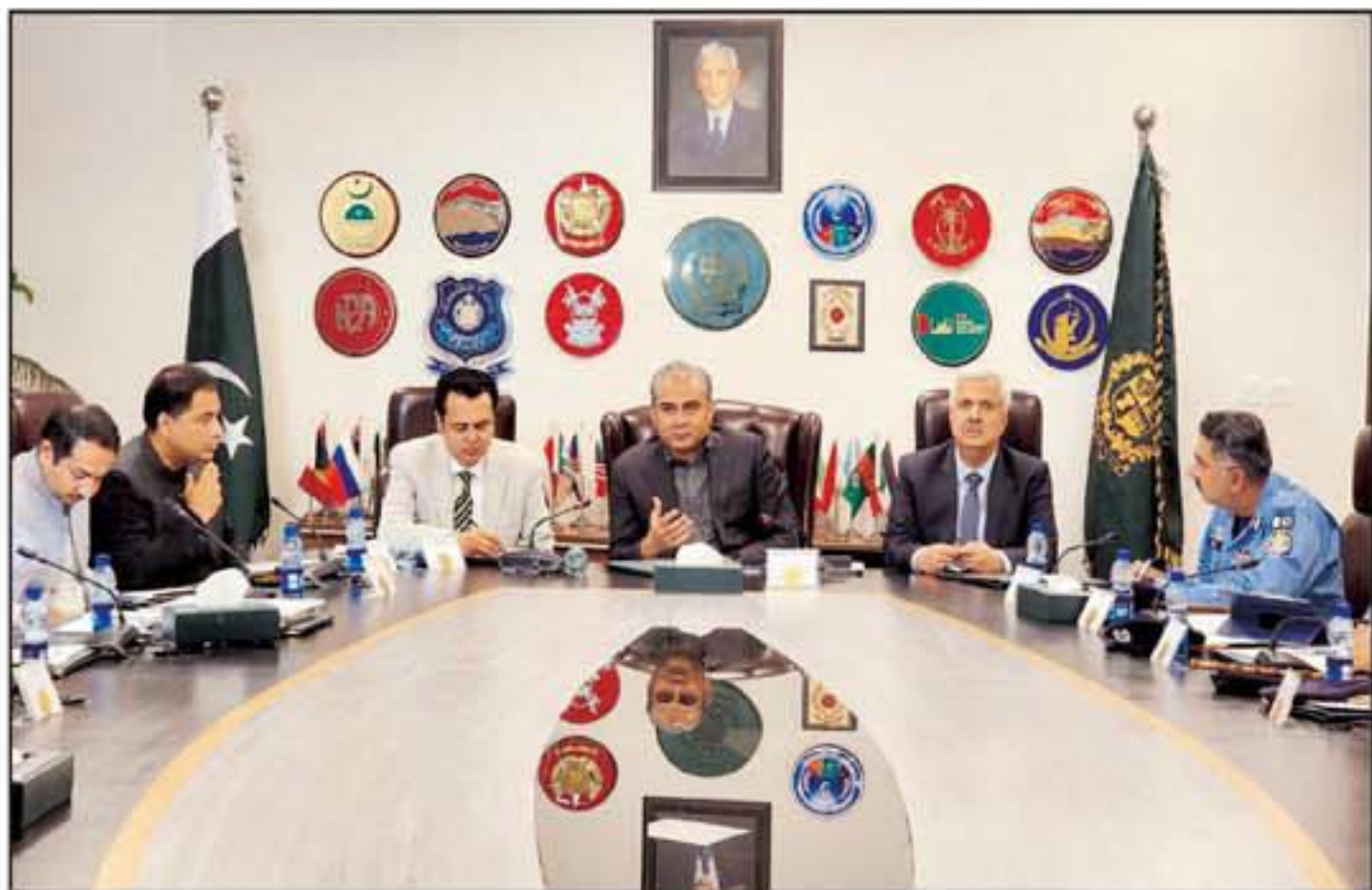
ISLAMABAD: Federal Minister for Interior Mohsin Naqvi chairing a high-level meeting.

To a question on Balochistan, he recalled that during his tenure as Prime Minister, he had clearly highlighted India's involvement in sponsoring terrorism and unrest in the province. "At that time, I presented evidence to international forums and even Bollywood produced a film, The Accidental Prime Minister, which indirectly hinted at Indian policy contradictions. This led India to show willingness to engage in dialogue on core issues like Siachen, Kashmir, and interference in Balochistan," he said.