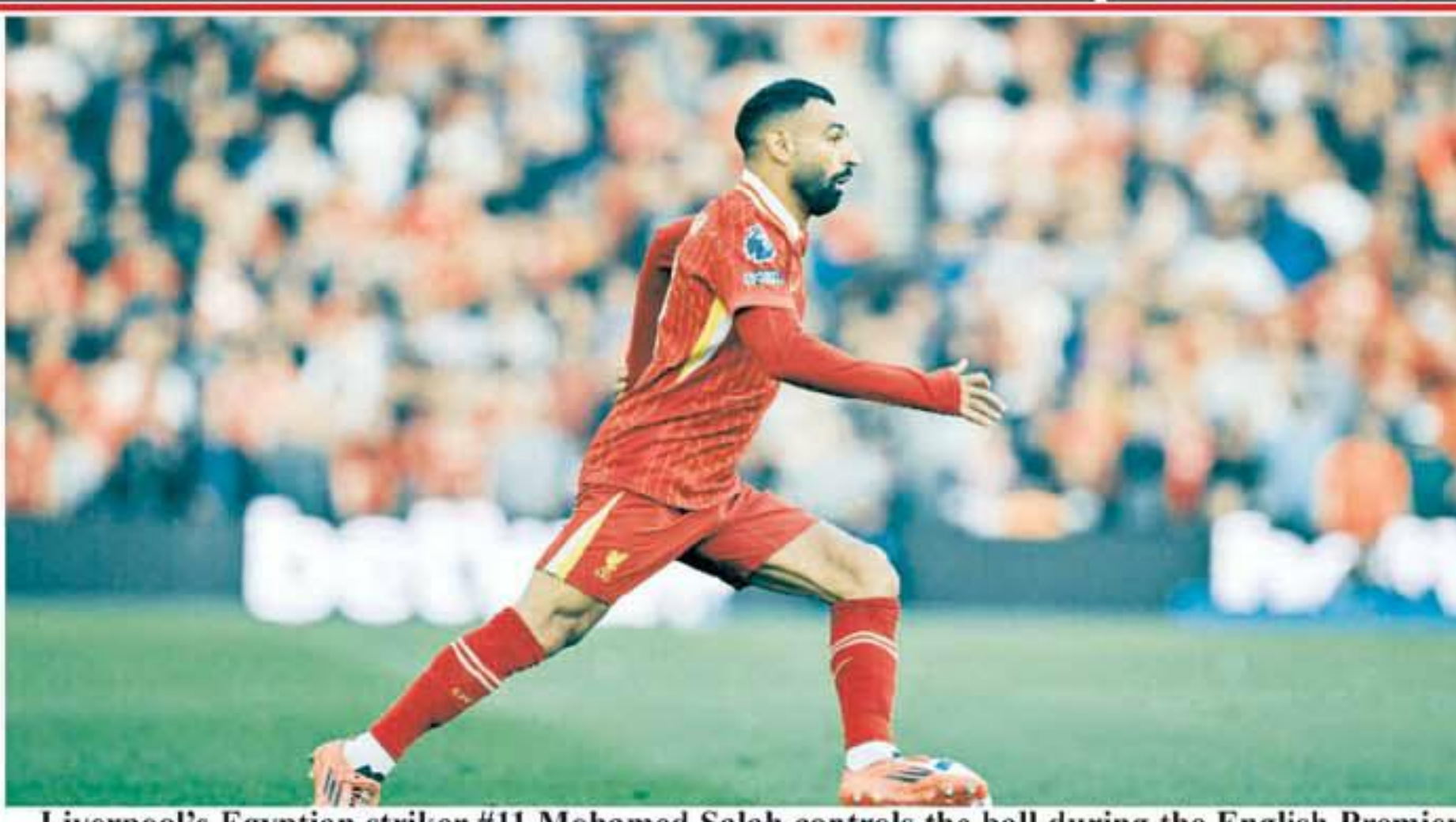
Liverpool's Egyptian striker #11 Mohamed Salah controls the ball during the English Premier League football match between Brighton and Hove Albion and Liverpool at the American Express Community Stadium in Brighton, southern England.