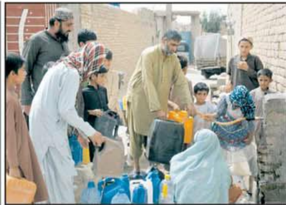
QUETTA: Residents of PB-44 Sabzal road filling their water posts from raod side tap.

Emphasising the importance of timely response, she underscored the need for coordinated action to safeguard public life and property.