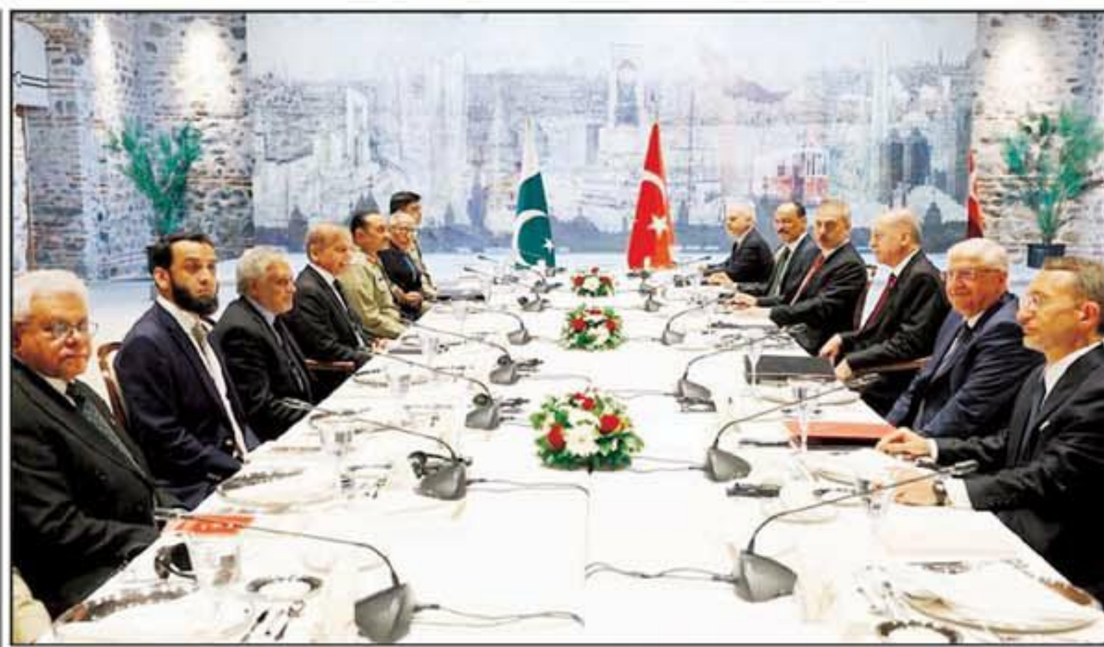
Prime Minister Shehbaz Sharif and Turkish President Recep Tayyip Erdogan hold a delegation-level meeting at Dolmabahçe Palace in Istanbul, Türkiye.

The meeting concluded with a renewed commitment to further deepen the multifaceted cooperation between Pakistan and Türkiye. The two leaders pledged to continue working closely for regional peace, sustainable development, and the shared prosperity of their peoples. Turkish President Erdogan also hosted dinner in honour of Prime Minister Shehbaz Sharif and the accompanying delegation.