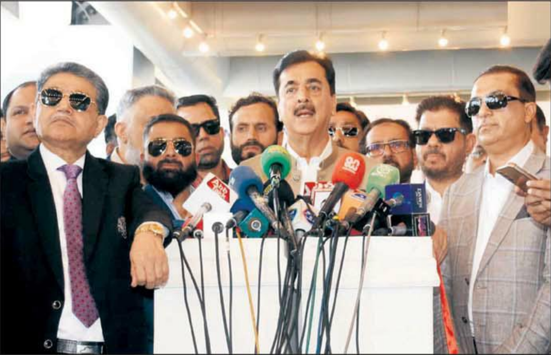
LAHORE: Senate Chairman Syed Yousuf Raza Gilani Talking to the media after visiting the International Solar Energy Exhibition at the Expo Centre.

The launch of the MEEF marks a critical milestone in the Ministry's broader strategy to uplift coastal populations, enhance educational outcomes, and strengthen Pakistan's maritime potential through targeted investment and opportunity, he added.