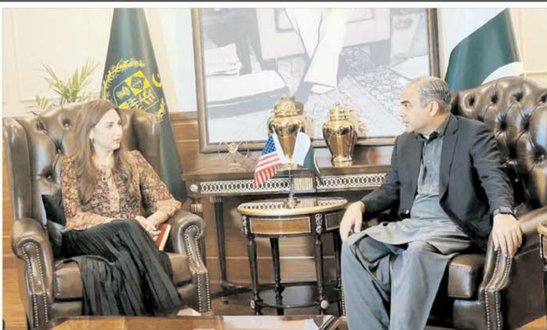
Islamabad : Federal Minister for Interior Mohsin Naqvi in a meeting with US Acting Ambassador Natalie Baker .