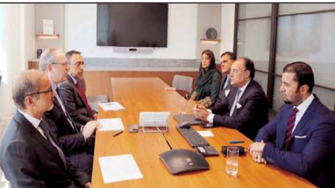
LONDON: Finance Minister Muhammad Aurangzeb held a meeting with senior representative of British American Tobacco.