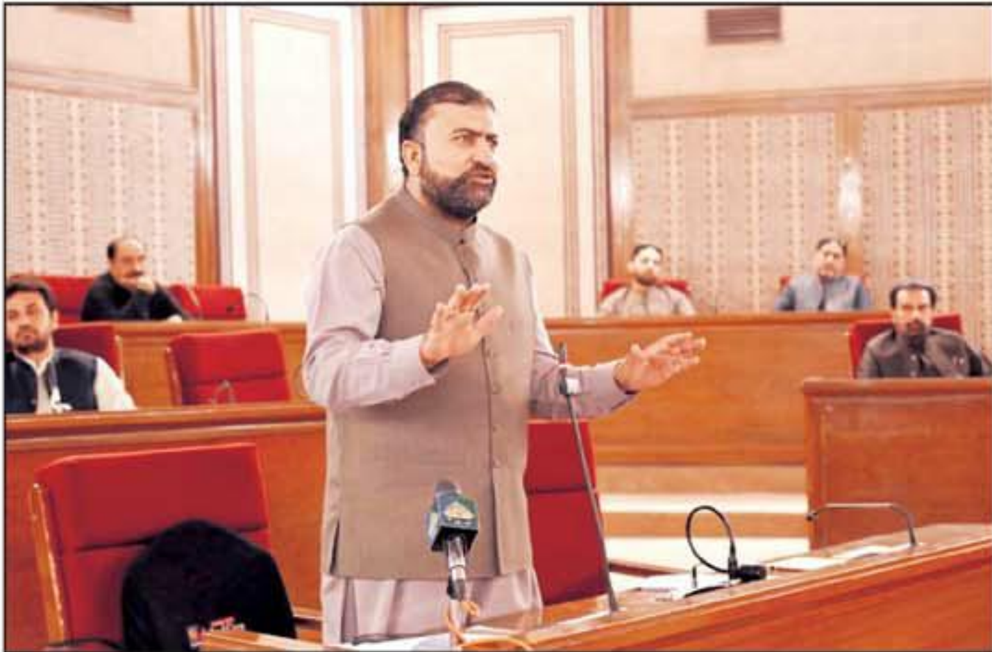
QUETTA: Balochistan Chief Minister Mir Sarfaraz Bugti addressing a Balochistan Provincial Assembly.

Several lawmakers also voiced concerns over rising extortion incidents, poverty, and unemployment in Balochistan during the session. The debate reflected growing public frustration over lawlessness and economic challenges in the province.