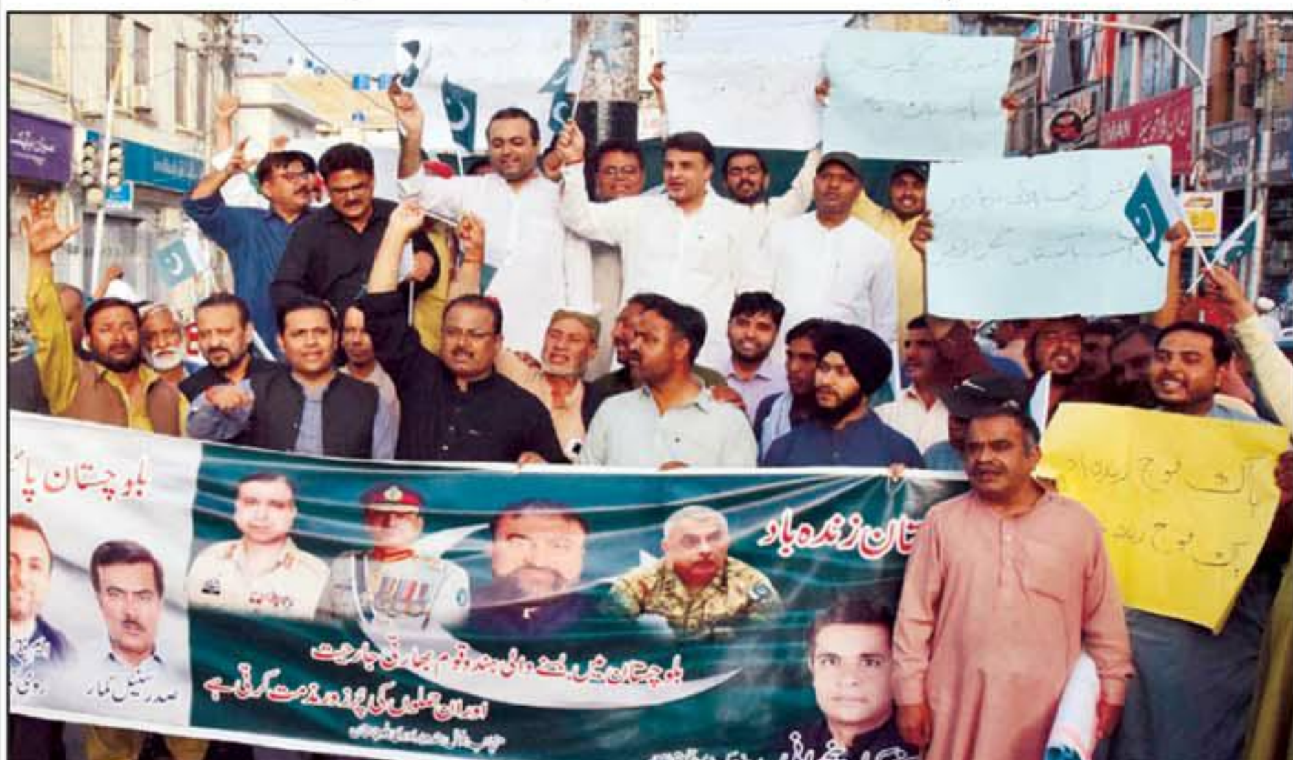
Members of Minority Community are holding protest rally against unprovoked Indian military strikes in several parts of the country and expressing solidarity with Pakistan Armed Forces, at Jinnah road in Quetta

This episode adds to growing concerns about India's use of uncorroborated narratives to shift global opinion, as Pakistan continues to advocate for independent probes to ensure regional peace and stability.