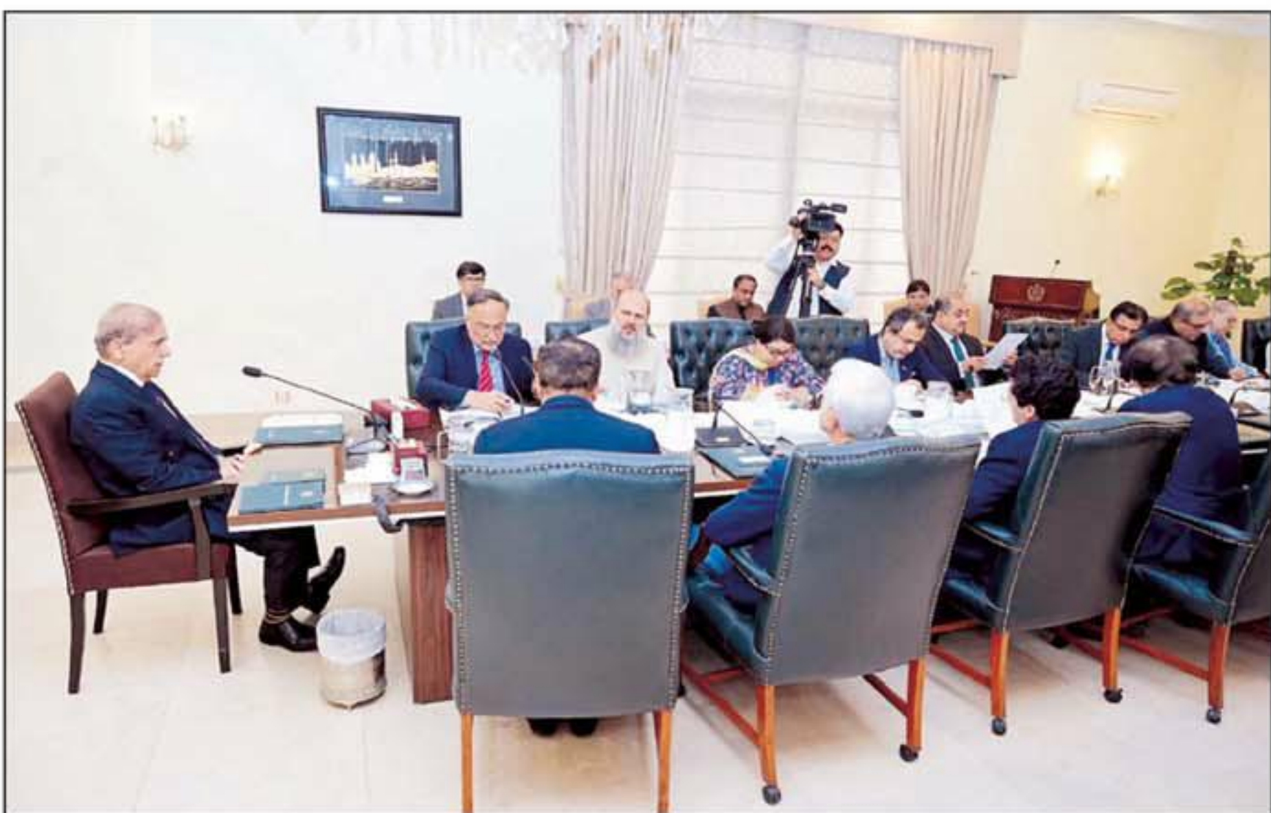
Islamabad: Prime Minister Muhammad Shehbaz Sharif chairs a consultative meeting on preparation of the Federal Budget.

"Every drop of blood will be accounted for," he reiterated. "Pakistan does not seek war, but if provoked, we will strike back decisively."