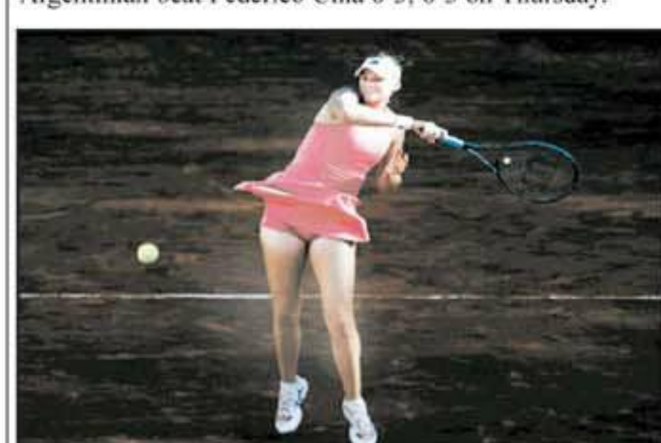
ASHLYN Krueger of the US hits a return against compatriot Jessica Pegula during their Italian Open round-of-64 match at Foro Italico .

Meanwhile, men's world number one Jannik Sinner will make his return to competition after a three-month doping ban by facing Mariano Navone on Saturday after the Argentinian beat Federico Cina 6-3, 6-3 on Thursday.