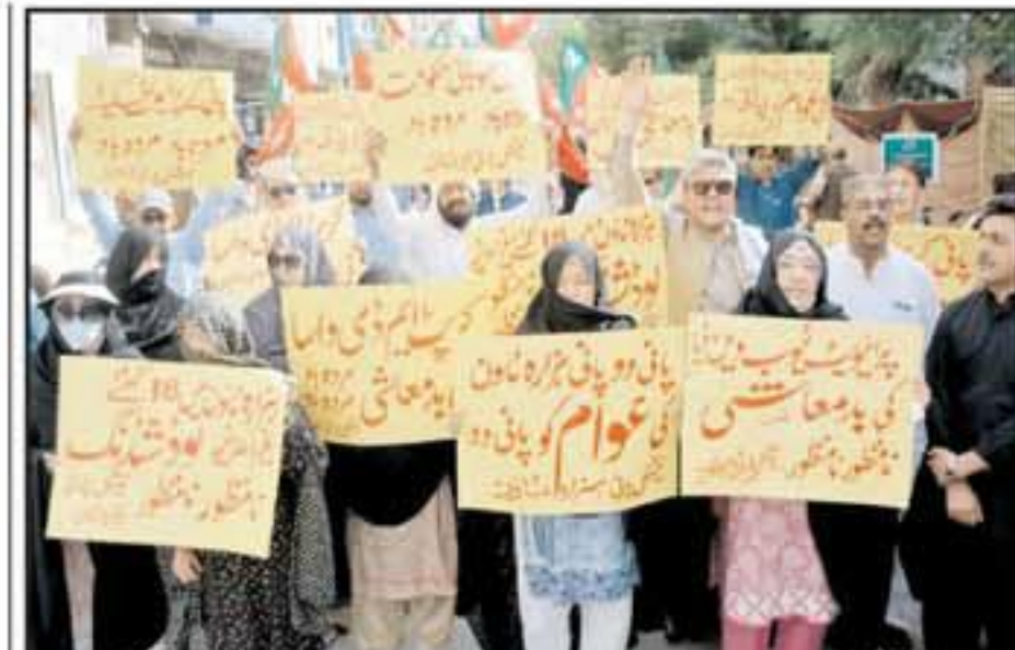
QUETTA: Residents of Hazara Town hold protest against shortage of water supply and electricity .