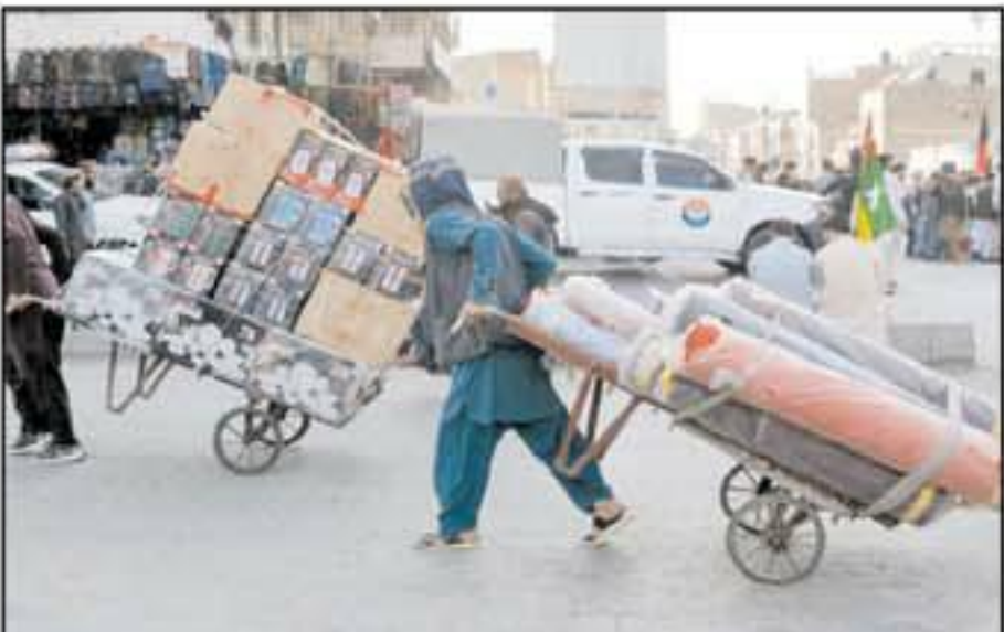
QUETTA: Labours push hand cart loaded with delivery stuff to earn money for their family.

He further added that the emergency department has the capacity to handle over 220 patients at a time. "During the last escalation between India and Pakistan, we reported to the hospital at 2:00 a.m. and have remained on duty since then. No one is willing to leave — everyone is committed to serving the nation."