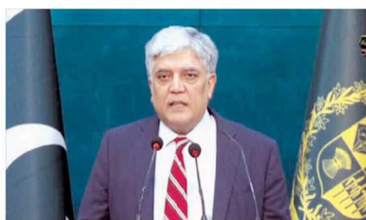
Foreign Office Spokesperson Shafqat Ali Khan addresses a weekly press briefing.

The spokesperson noted that South Asia is home to one-fifth of the