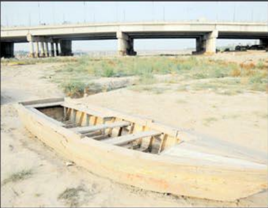
LAHORE: A view of dry Ravi river.