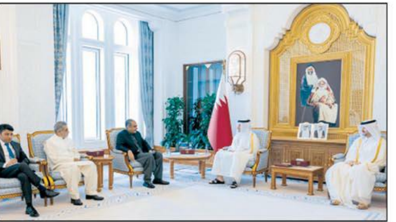
Interior Minister Mohsin Naqvi met with Prime Minister of Qatar Sheikh Mohammed bin Abdulrahman bin Jassim Al Thani, in Doha.