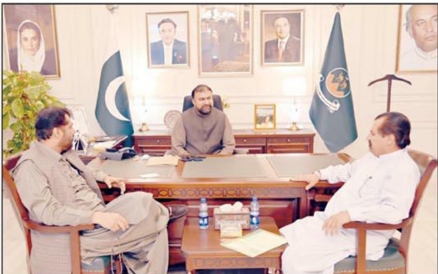
QUETTA: CM Balochistan Mir Sarfraz Bugti in a meeting with Member Provincial Assembly Mir Zabid Ali Reki and Mir Azam Reki.

On the occasion, the Acting Afghan Foreign Minister appreciated Pakistan's proactive steps to ease trade and facilitate travel. He also extended an invitation to the Deputy Prime Minister to visit Afghanistan again.