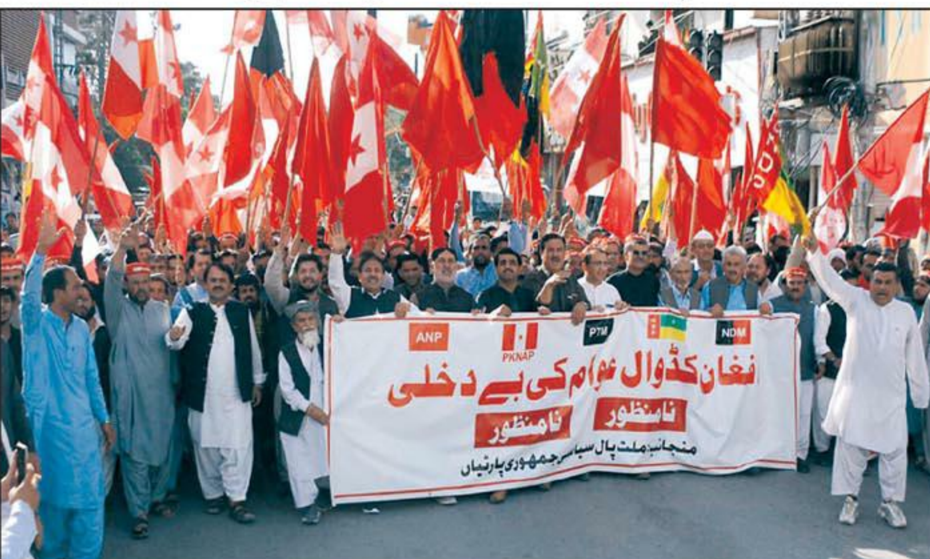
QUETTA: Activates of different political parties hold rally .

Rana Mashhood also revealed that Malaysia was interested in investing $200 million in Pakistan's livestock sector and considers Dera Ghazi Khan an ideal region for livestock development. He pledged to promote livestock initiatives in the division to unlock its economic potential.