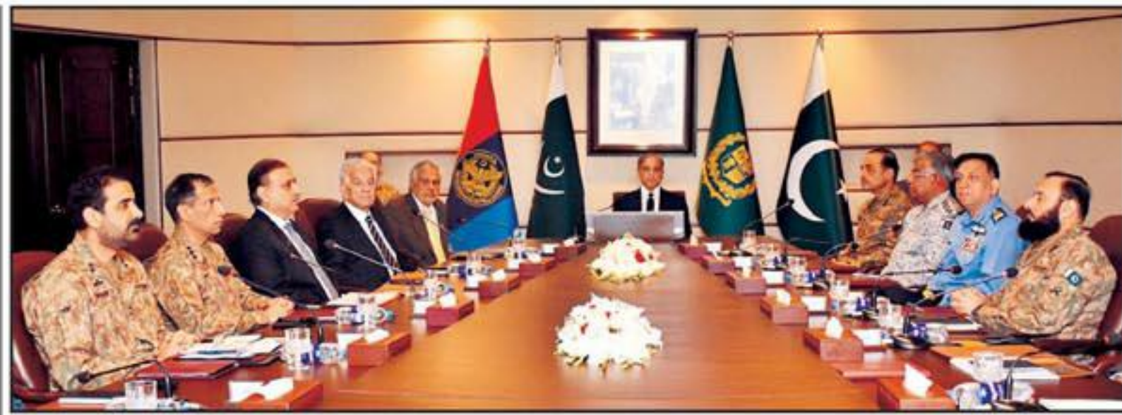
ISLAMABAD: The Honourable Prime Minister of Pakistan, Muhammad Shehbaz Sharif, accompanied by Deputy Prime Minister/ Foreign Minister, Defence Minister, and Services Chiefs visited the newly established National Intelligence Fusion and Threat Assessment Centre (NIFTAC).

"Security forces of Pakistan, in step with the nation, remain determined to thwart attempts at sabotaging peace, stability and progress of Balochistan, and such sacrifices of our brave soldiers further strengthen our resolve."