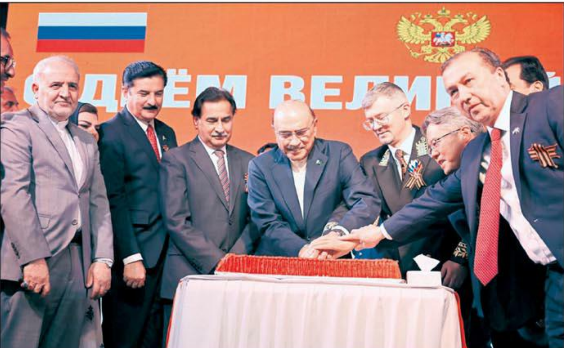
President Asif Ali Zardari cutting the cake to commemorate the 80th Anniversary of Victory in Great Patriotic War of Russian Federation at the Russian Embassy, in Islamabad.

"It is also essential – especially at this critical hour – to avoid a military confrontation that could easily spin out of control."