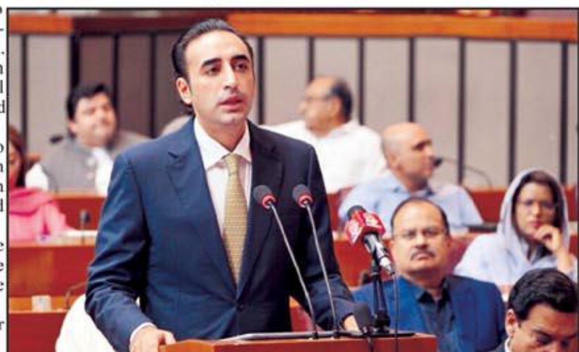
PPP Chairman Bilawal Bhutto-Zardari speaking during the NA session.

The resolution said that the killing of innocent civilians was contrary to the values upheld by Pakistan, and the NA rejected all "frivolous and baseless attempts" to link Pakistan with the Pahalgam attack.