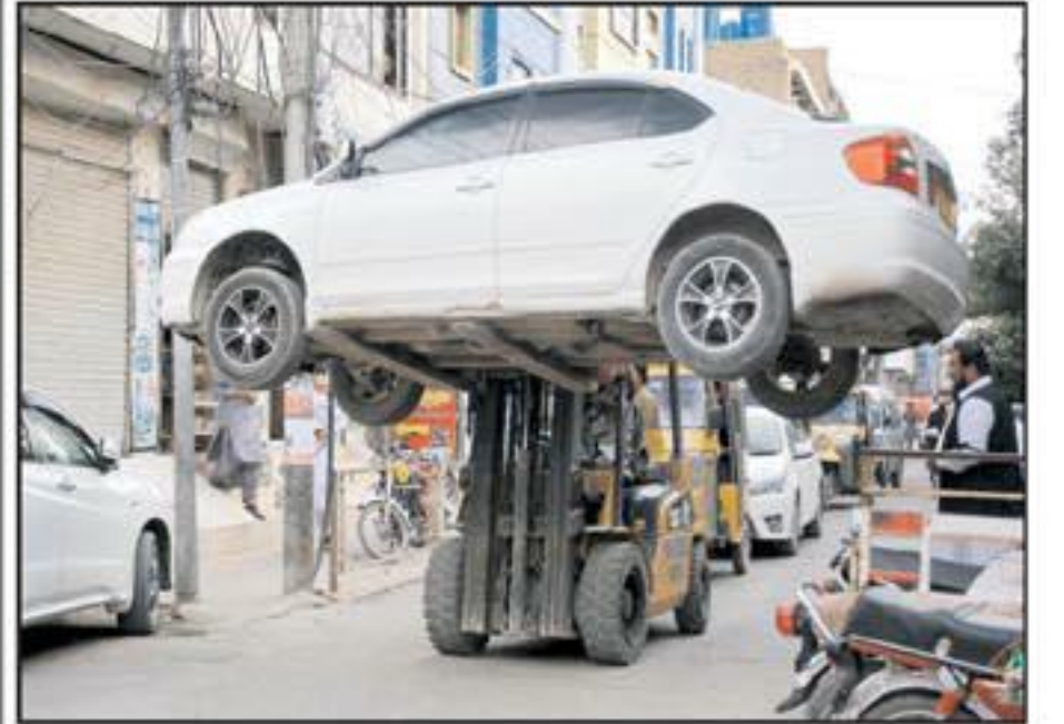
QUETTA: Traffic police lifting car from no parking at Adalat road .

ly e-taxi project in Punjab were informed. The meeting gave in-principle approval of financial model of e-taxi. The meeting was agreed on launching pilot project with 1100 e-taxis and it was also decided to install solar power system for e-charging station. A report was sought on more routes for mass transit system in Gujranwala. Chief Minister Maryam Nawaz Sharif directed to determine routes according to public convenience. The issues related to e-taxi project were reviewed in detail in the meeting.