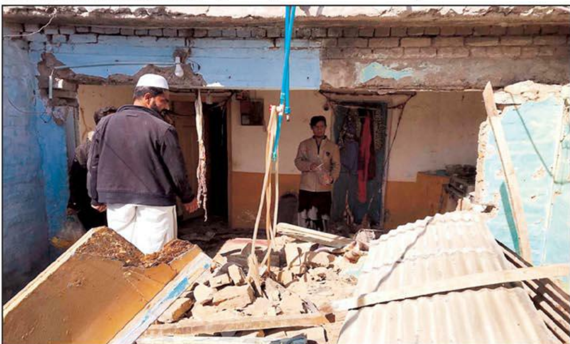
QUETTA: Peoples stand near damage house due to gas cylinder blast at joint road .

The Ministry of National Food Security & Research expressed the resolve to ensuring food security, supporting farmers, and strengthening agriculture through sustainable policies and strategic interventions for long-term stability and growth.