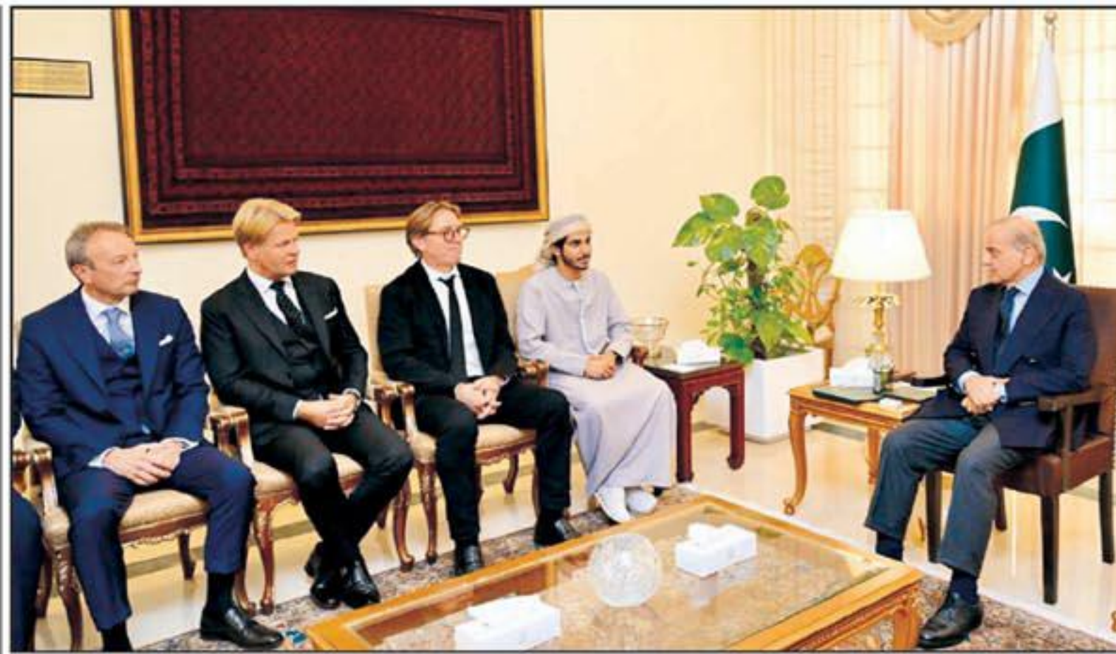
Prime Minister, Muhammad Shehbaz Sharif in a meeting with a delegation of Aleria and IFZA UAE held in Islamabad

The multiple suicide blasts resulted in the partial collapse of the perimeter wall, causing damage to the adjacent infrastructure. Tragically, a mosque and a civilian residential building in close proximity also suffered severe destruction, leading to the martyrdom of 13 innocent civilians and injuries to 32 others, it said. Intelligence reports have unequivocally confirmed the physical involvement of Afghan nationals in this heinous act, with evidence also pointing to the fact that the attack was orchestrated and directed by terrorist ringleaders operating from Afghanistan. "Pakistan expects the Interim Afghan Government to uphold its responsibilities and deny its soil for terrorist activities against Pakistan. Pakistan reserves the right to take necessary measures in response to these threats emanating from across the border," ISPR said. The security forces of Pakistan remain steadfast in their resolve to eradicate terrorism in all its forms. The sacrifices of our brave soldiers and innocent civilians further reinforce our unwavering commitment to safeguarding our nation at all costs.