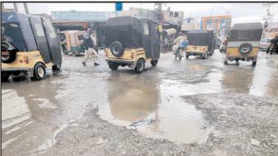
Inundated road by overflowing sewerage water, creating problems for residents and commuters, showing negligence of concerned authorities, at Jinnah road in Quetta.