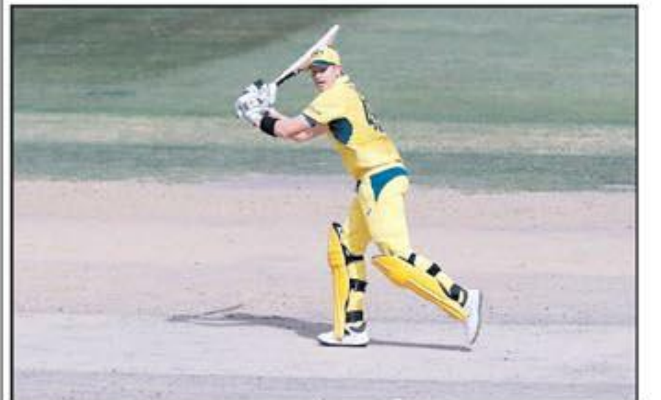
Australia's Steve Smith in action in India v Australia - Dubai International Stadium, Dubai, United Arab Emirates

"Steve has said on many occasions he is approaching the remainder of his playing career on a series-by-series basis," he said.