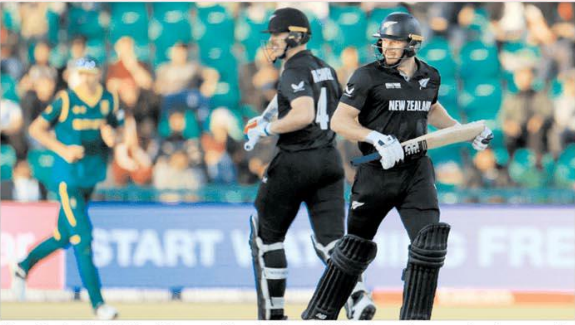
New Zealand's Michael Bracewell and Glenn Phillips in action running between the wickets at the Gaddafi Stadium in Lahore.

Pakistan only agreed to the so-called hybrid model of hosting on the condition that they will also not send their team to India for upcoming ICC events.