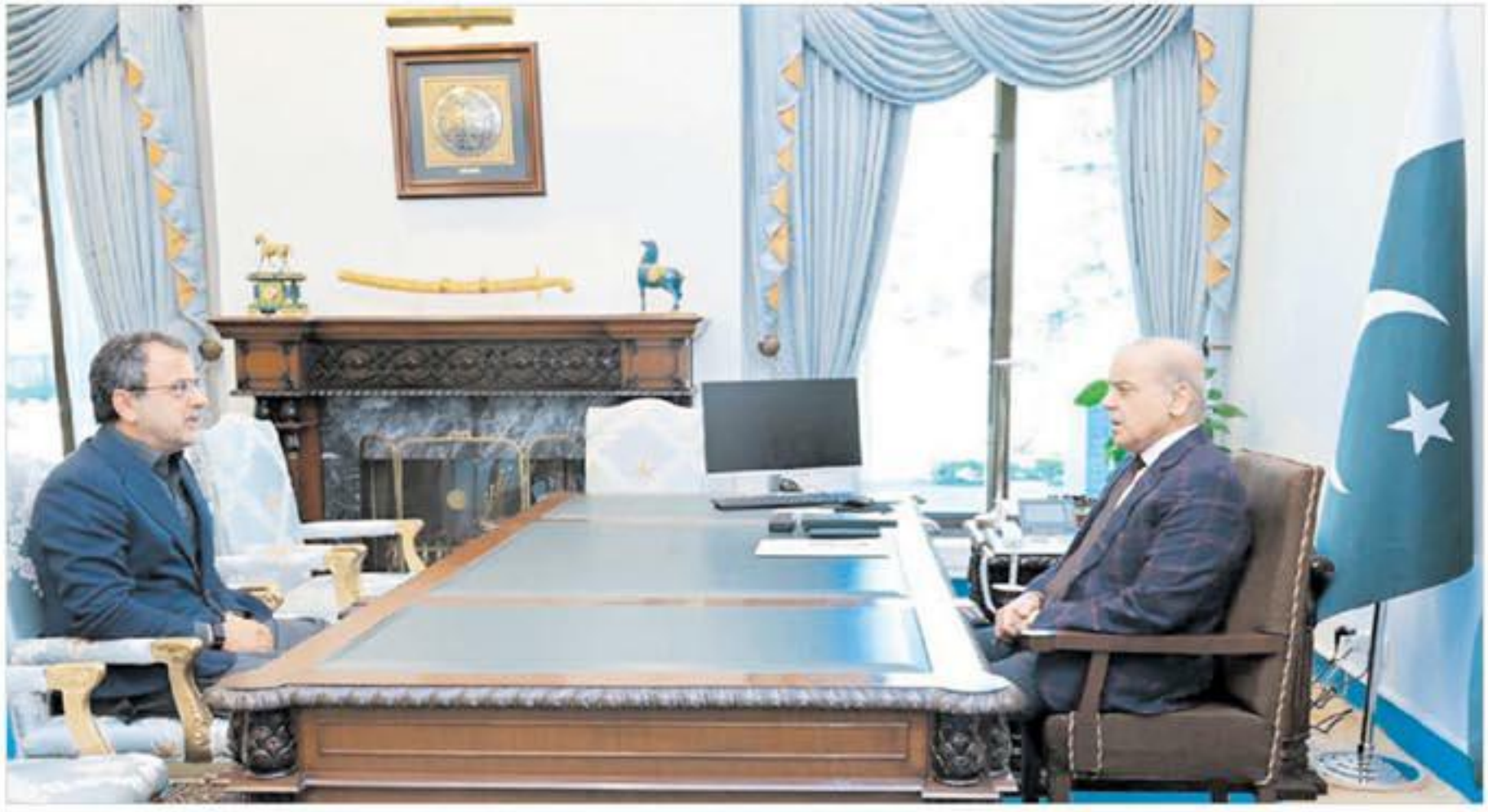
Prime Minister, Muhammad Shehbaz Sharif exchanging views with Sardar Awais Ahmed Leghari, Federal Minister for Power during meeting held in Islamabad

Aleria will equip Fauji Foundation with a comprehensive suite of AI solutions, designed to elevate the foundation's operations to new heights. These advanced tools will enable Fauji Foundation to harness the power of AI for strategic planning, data-driven decision-making, and seamless collaboration, ensuring that its social welfare and economic initiatives are executed with unparalleled precision and efficiency.