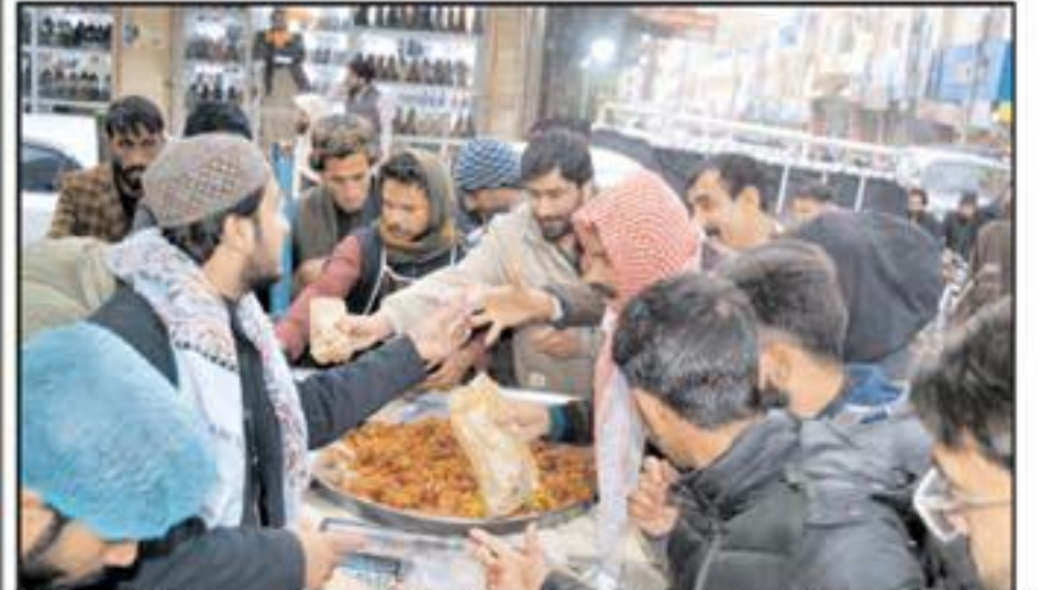
Food items are being selling before Iftar times (breaking fast meal), as demand of food items increased in city during the Holy Month of Ramadan-ul-Mubarak, at Shawak Shah road in Quetta.

tricts and committees have been formed at the provincial level, which are distributing financial assistance checks to minority people respectively. At present, checks have been distributed to 104 minority people in Naserabad district, each student is being given Rs. 145,000 for scholarship, Rs. 90,000 for marriage, Rs. 85,000 for medical and Rs. 22,000 for financial assistance. He said that our aim is to provide financial assistance to minority people for insuring financial assistance saying that in the light of the orders of Chief Minister Balochistan Mir Sarfraz Khan Bugti, financial assistance has been continued.