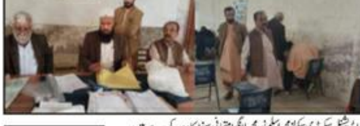
جنگل بیٹری، ایٹمی ایجنسی کے وفد کے ساتھ میٹنگ

بلوچستان کے تمام نوٹیفکیشن سندھ حکومت کے ماتحت ہیں۔ سندھ حکومت نے نوٹیفکیشن جاری کیا ہے۔