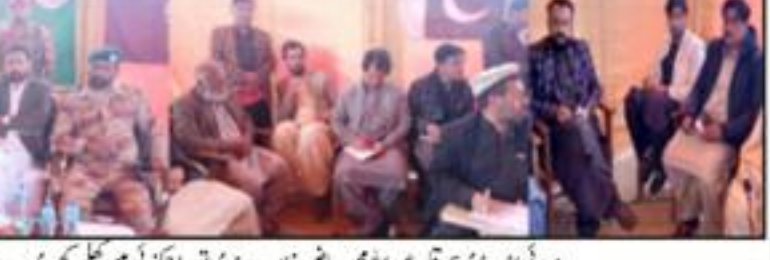
میٹنگ، ایٹمی ایجنسی کے وفد کے ساتھ