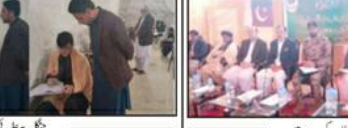
میٹنگ، ایٹمی ایجنسی کے وفد کے ساتھ