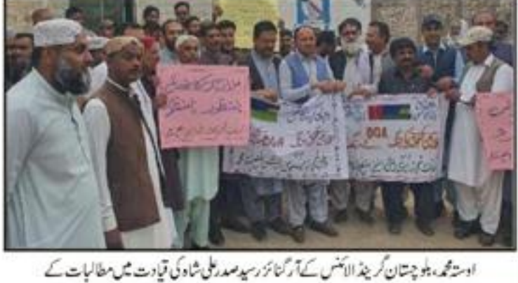
اوسٹم، بلوچستان گریڈ ایس کے آرگنائزیشن کے وفد میں مطالبات کے حق میں مزاحمت

اوسٹم، بلوچستان گریڈ ایس کے آرگنائزیشن کے وفد میں مطالبات کے حق میں مزاحمت کی گئی۔ وفد نے مطالبات کی فہرست پیش کرتے ہوئے کہا کہ آج کے وفد نے مطالبات کی فہرست پیش کی ہے۔