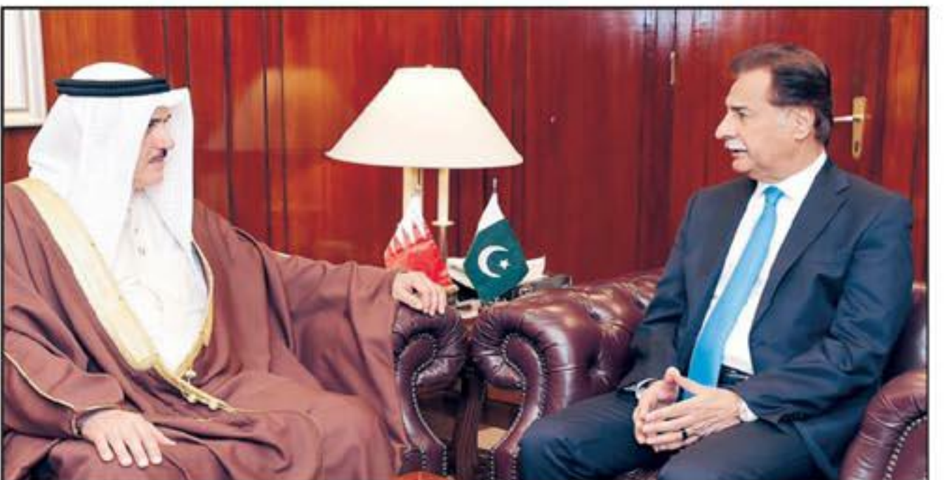
ISLAMABAD: High-level Bahraini parliamentary delegation led by the President of the Council of Representatives, Ahmed Bin Salman Al Musallam, called on Speaker of the National Assembly Sardar Ayaz Sadiq at Parliament House.

He said both the countries have similar positions on important regional and global issues and always supported each other's stands at regional and global forums. In his remarks, Speaker of the Council of Representatives of Bahrain said his country wants to promote cooperation with Pakistan in parliamentary, trade, IT and various other fields. He said the Bahraini Parliament will also provide all possible cooperation with the Pakistani Parliament in the IT sector. Dr Ahmed bin Salman Al-Musallam stressed the need to further promote trade relations between Pakistan and Bahrain. He also thanked the Speaker National Assembly and his team for accord a warm welcome to them in Pakistan.