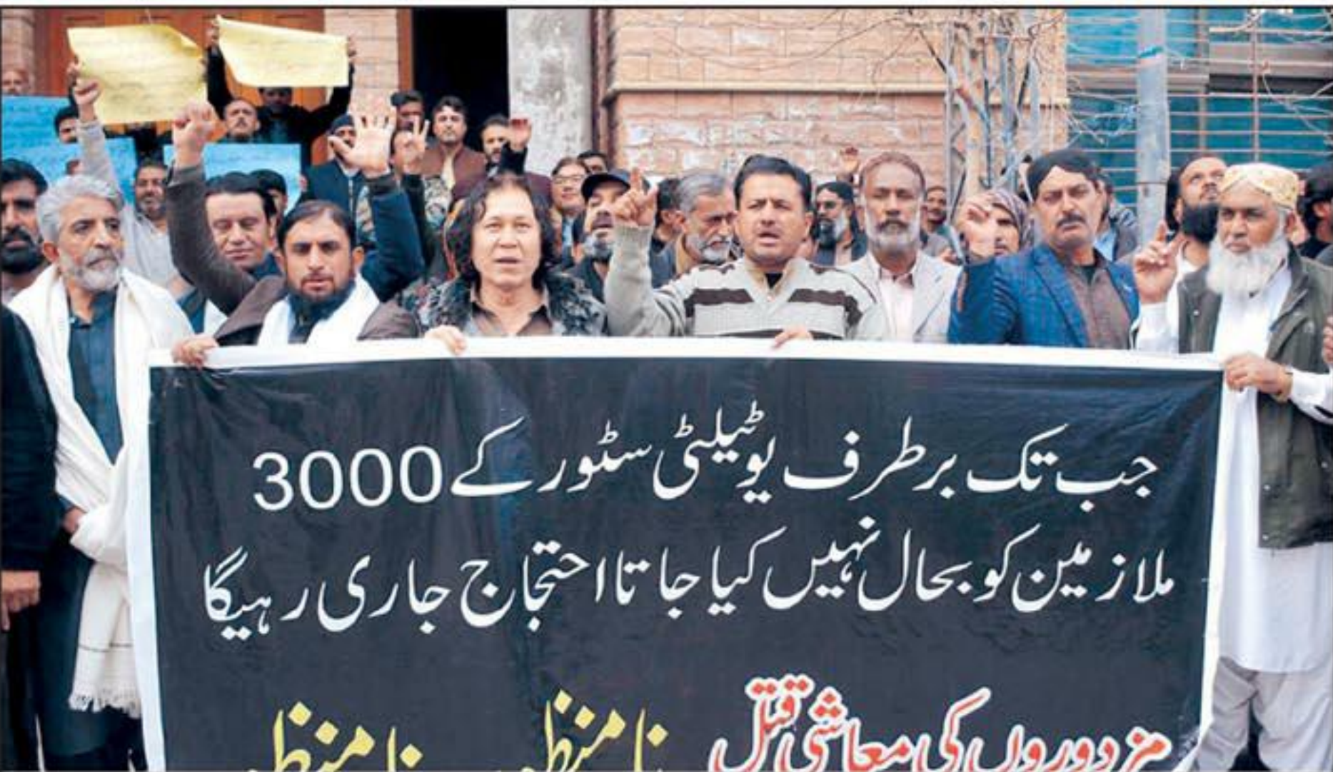
QUETTA: Employees of Utility Stores Corporation hold protest against the dismissal of their employees.