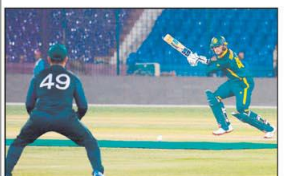
KARACHI: A view of warm up match between Pakistan vs South Africa ahead of the ICC men's champions trophy in Karachi.

Meanwhile, the excitement surrounding the highly anticipated India-Pakistan clash in the ICC Champions Trophy 2025 has reached new heights, with tickets for the February 23 match in Dubai selling out within record time. The initial batch of tickets was snapped up within just one hour of release, driven by a massive demand from cricket fans across the globe. In response to the overwhelming interest, the International Cricket Council (ICC) quickly announced the release of additional tickets. However, these tickets also sold out within 90 minutes, with fans rushing to secure their seats for the historic encounter.