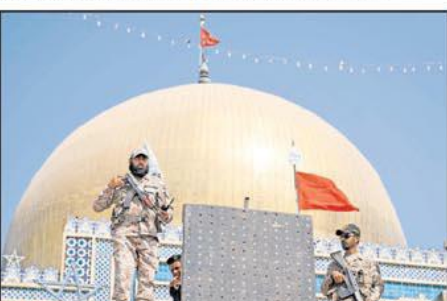
SEHWAN: A view of Rangers personal's stand alert at shrine during 773rd annual Urs celebrations of Hazrat Lal Shahbaz Qalandar in Sehwan Sharif.