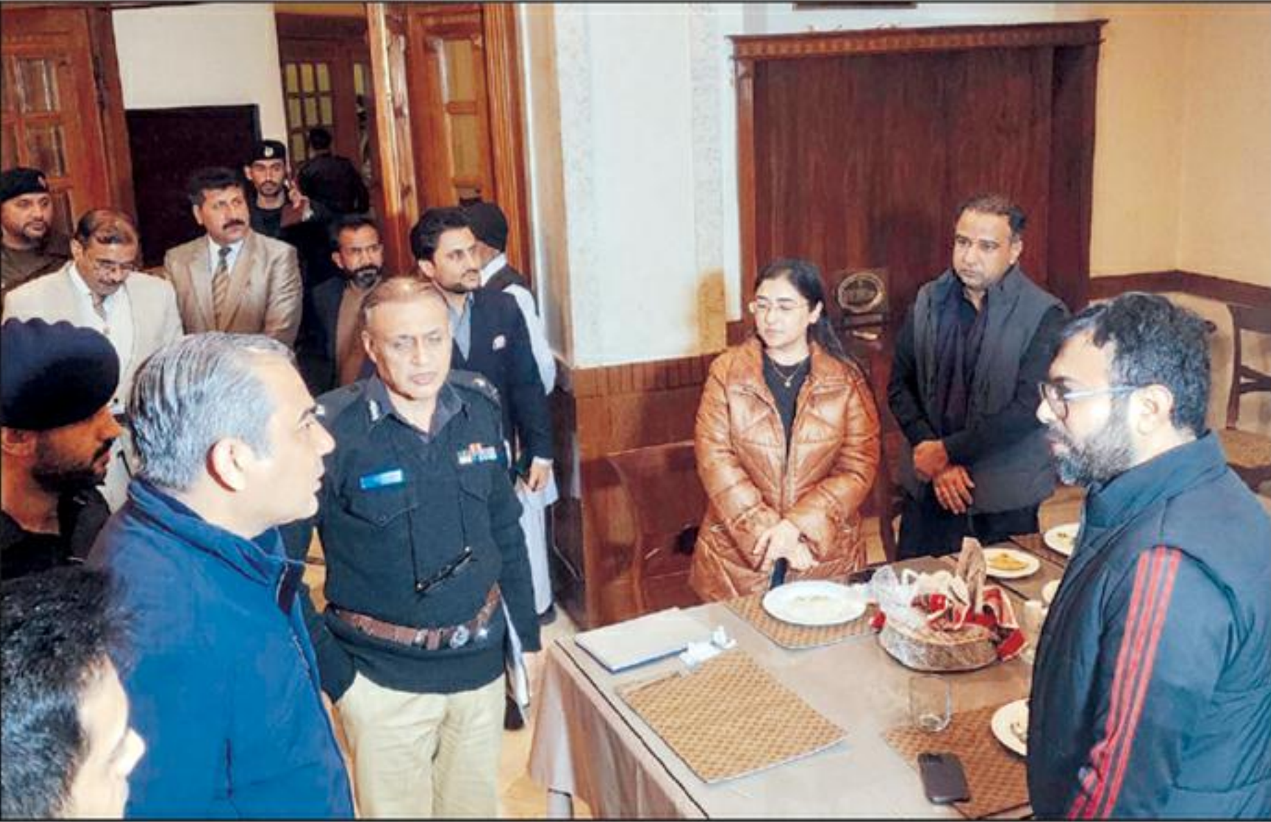
Federal Minister for Interior, Mohsin Naqvi interacts with under-training officers during his visit to National Police Academy in Islamabad