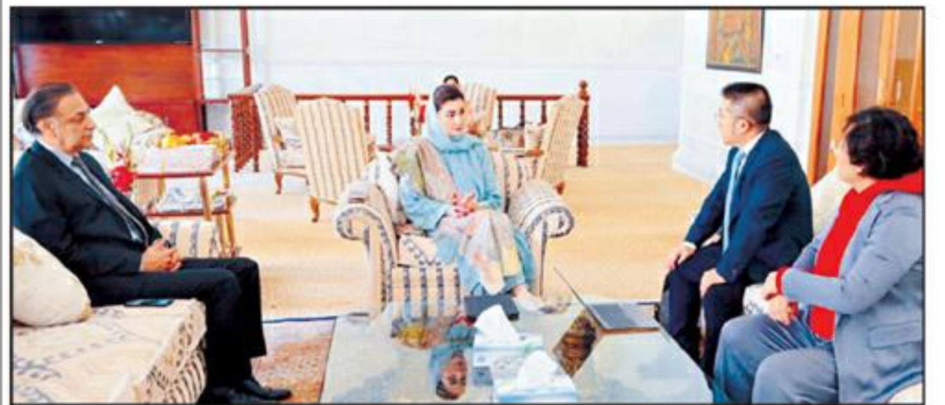
Punjab Chief Minister, Maryam Nawab Sharif exchanging views with a high level delegation from China during meeting held at Punjab House in Islamabad.

High officials of National Police Academy were also present during the meeting.