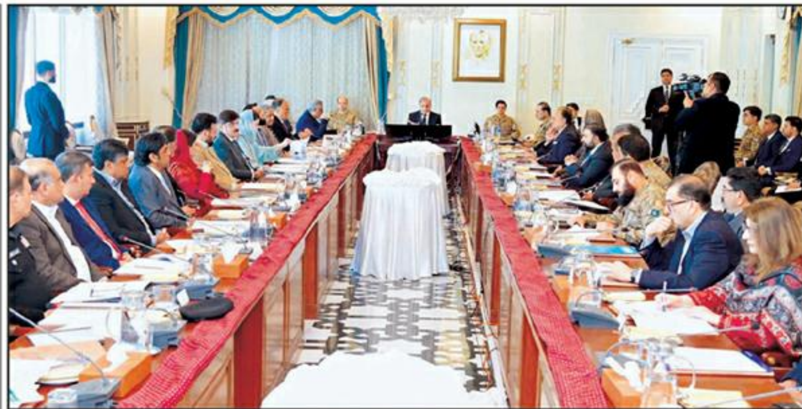
Prime Minister, Muhammad Shehbaz chairs the meeting of Apex Committee of National Action Plan, in Islamabad.

Breakdown of collections includes Rs2,827 billion from income tax, Rs617.3 billion from customs duties, Rs346.6 billion from federal excise duties, and Rs2,105 billion from sales tax during the July-December period.