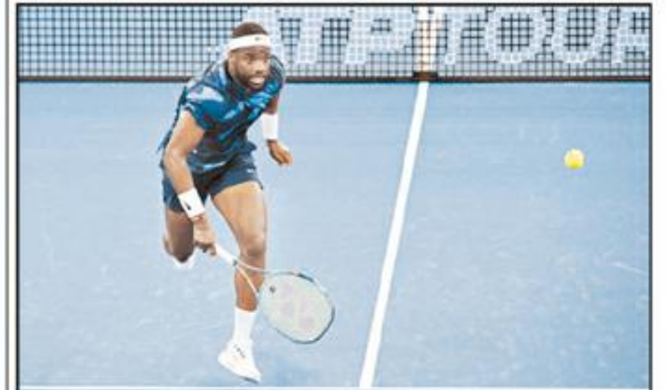
FRANCES Tiafoe of the US chases a lob during the Brisbane International round-of-16 match against Giovanni Mpetshi Perriard of France.