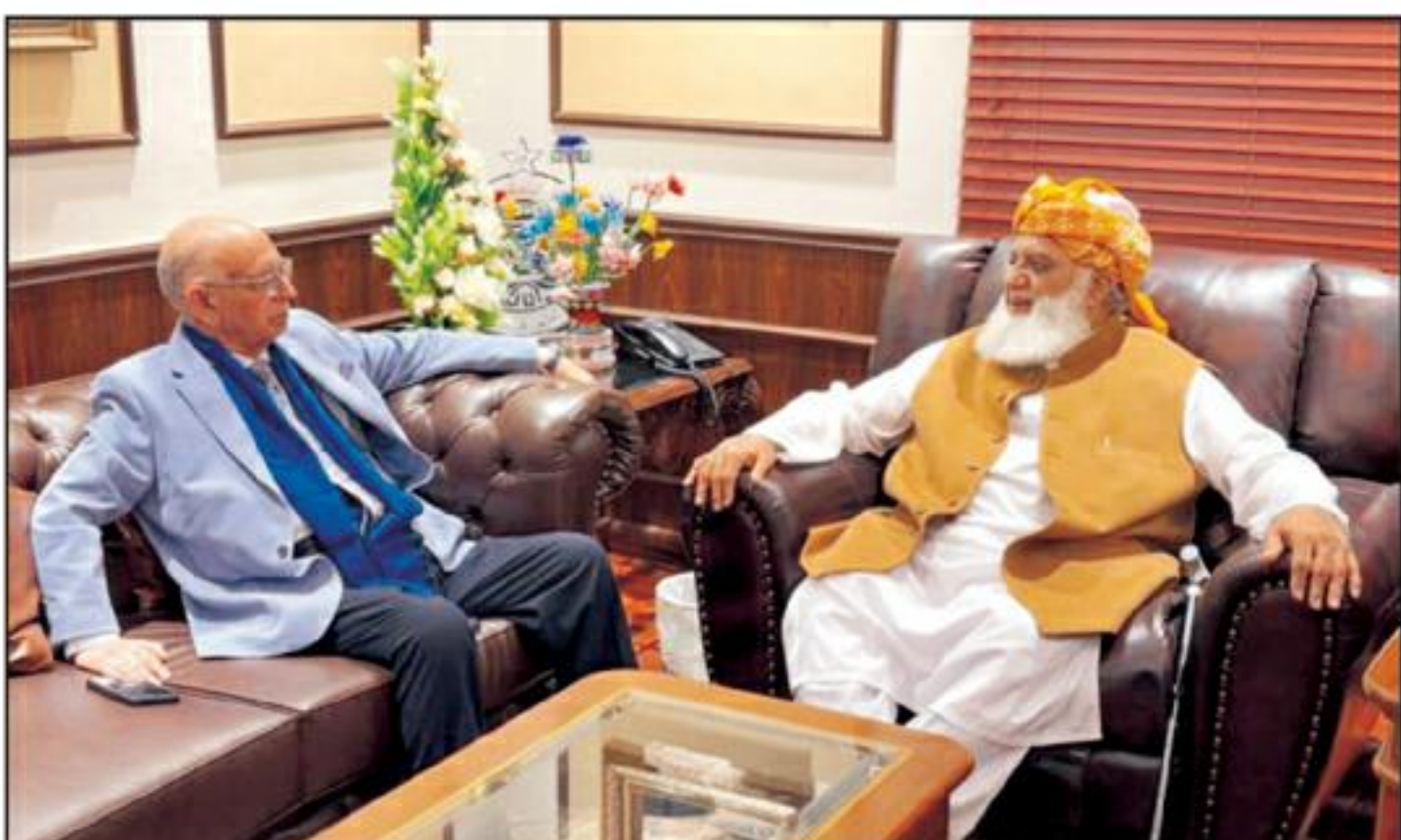
Maulana Fazlur Rehman, leader of Jamiat Ulema-e-Islam-Fazl (JUI-F) while speaking to Senator Irfan Siddiqui, spokesperson for the government negotiation committee and Pakistan Muslim League Nawaz (PML-N) leader, who visited him at his residence to inquire about his health.