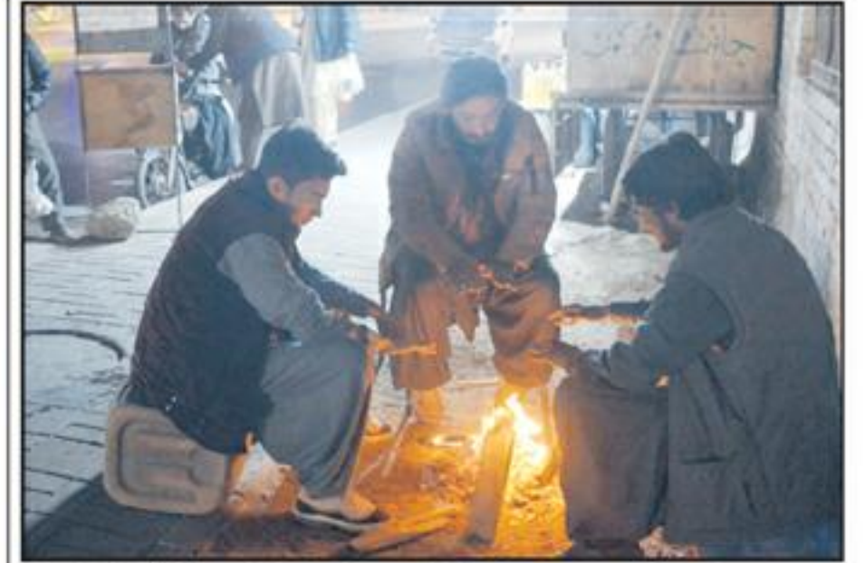
QUETTA: People sitting around fire to warm themselves during cold weather in provincial capital.