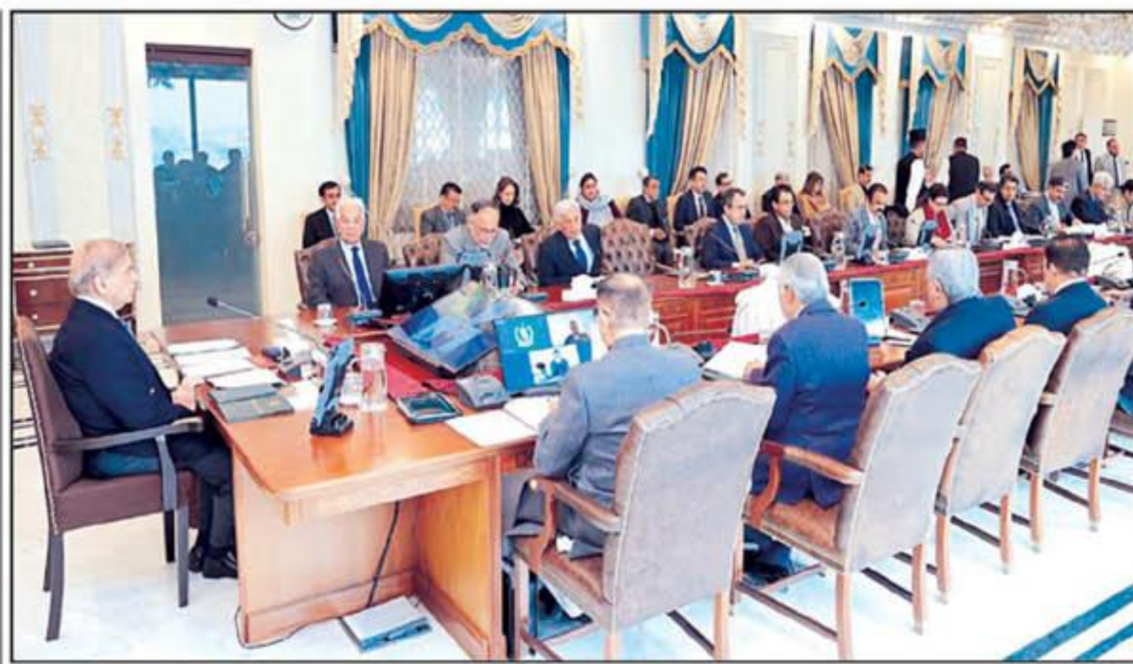
ISLAMABAD: Prime Minister Muhammad Shehbaz Sharif chairs the Federal Cabinet Meeting.

Early payment of compensation to workers died in accidents should be ensured, Chief Minister ordered.