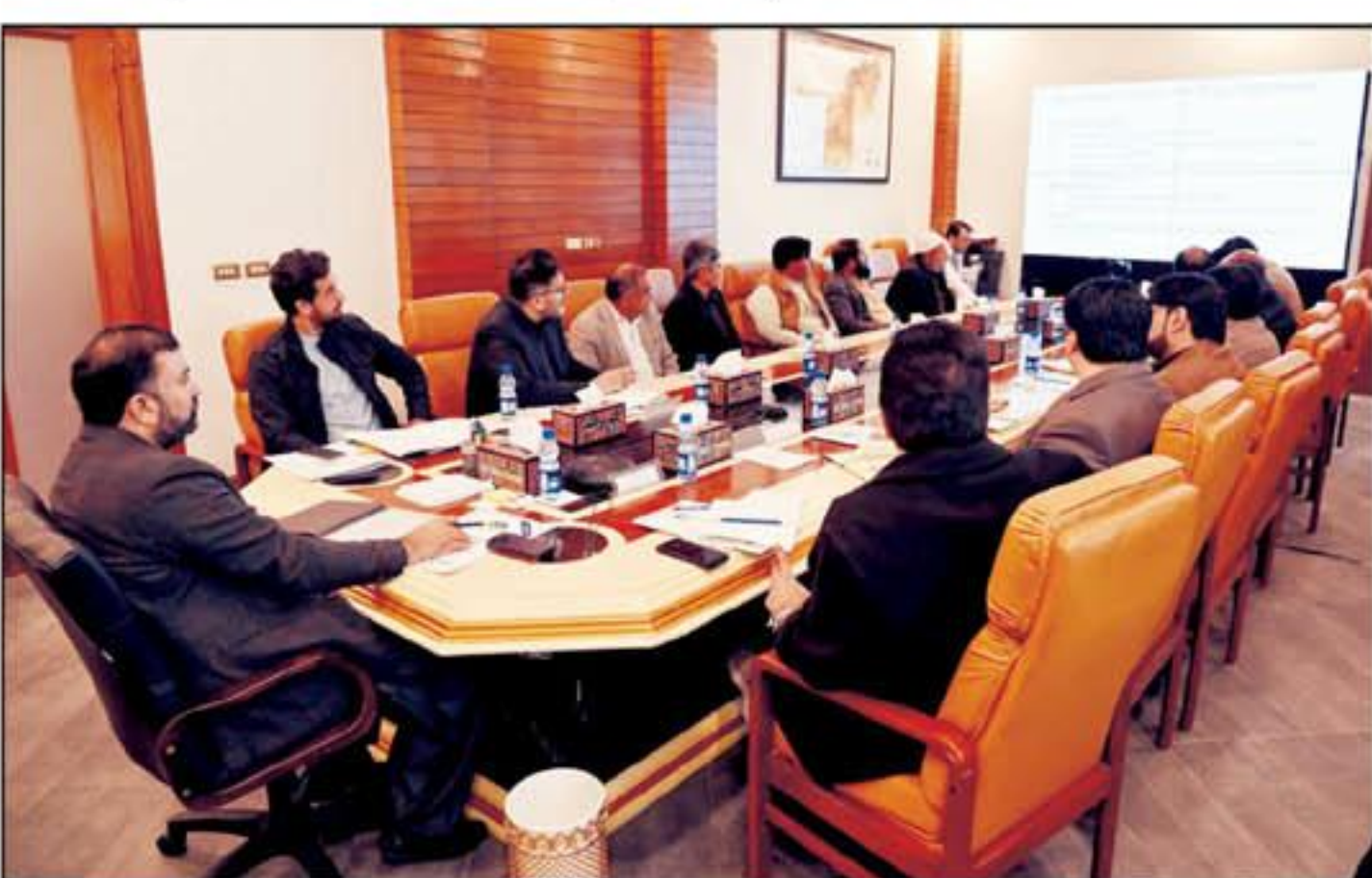
Chief Minister Balochistan Mir Sarfaraz Bugti chaired a meeting regarding mines and minerals and owners of mines at Chief Minister Secretariat in Quetta

sector on the recommendations of the Pakistan Software Export Board. The Prime Minister also directed to evolve a strategy for the marketing of Pakistan's IT sector. He said IT infrastructure should be further improved to enhance country's exports. The meeting was given detailed briefing about the measures taken for enhancing IT exports to 25 billion dollars. It was told that work is continuing at a fast pace on providing public's access to smart phones, expanding broadband services to more areas, increasing internet speed, and achieving other targets. It was said that the number of freelancers in the country will be increased from the existing 1.4 million to two million in the next two years. Over 300,000 individuals will be trained through the DigiSkills program by June this year and this number will be taken to 900,000 in the next two years.