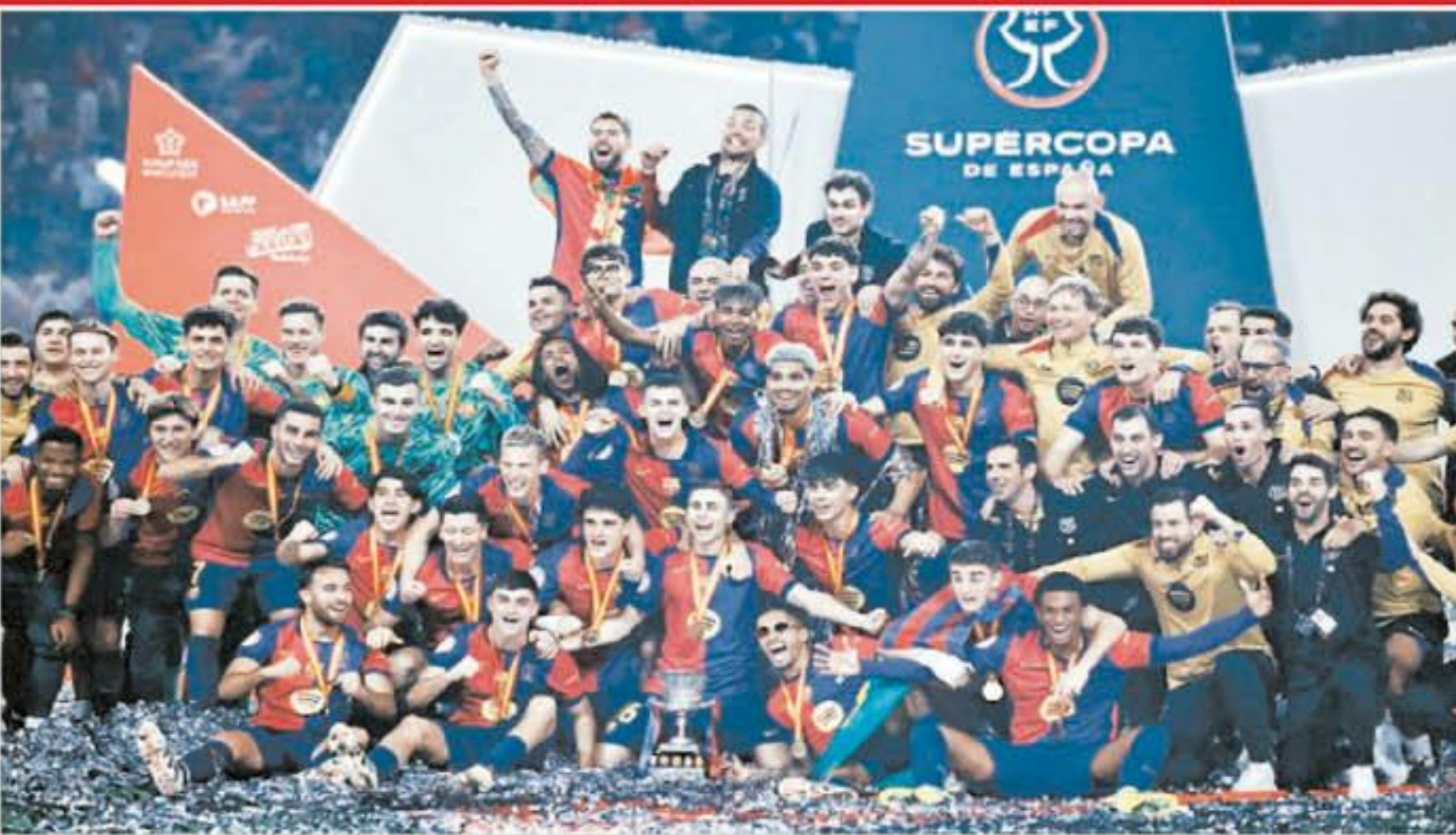
BARCELONA players celebrate with the trophy after winning the Spanish Super Cup final against Real Madrid at the King Abdullah Sports City.

LAHORE: All six franchises of the HBL Pakistan Super League completed their respective squads for the 10th edition during the players' draft ceremony held here at the historical Hazuri Bagh, Lahore Fort. New Zealand's Daryl Mitchell became the first pick of the coming season when two-time winners Lahore Qalandars picked him to strengthen their batting order. Mitchell will make his PSL debut this year. New Zealand's batting maestro Kane Williamson was one of the prominent signings by Karachi Kings in the supplementary round one. Former Australian opener David Warner was picked by Kings as they made use of the second pick in the first Platinum round. Warner, with 12,727 T20 runs in 392 T20 matches under his belt, will also be among the PSL debutants.