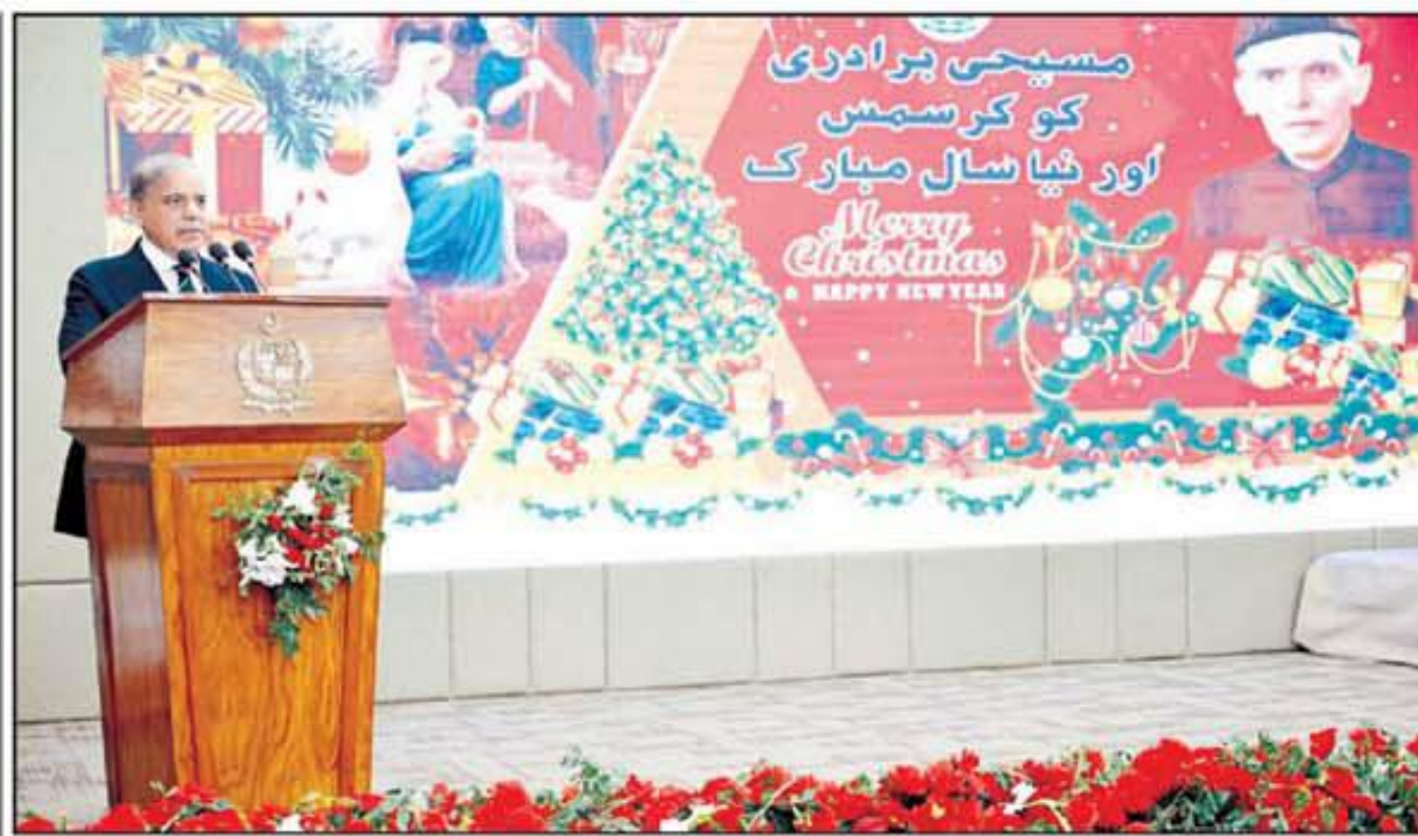
Prime Minister, Muhammad Shehbaz Sharif addresses during the ceremony on the occasion of Christmas Day 2024, in Islamabad.