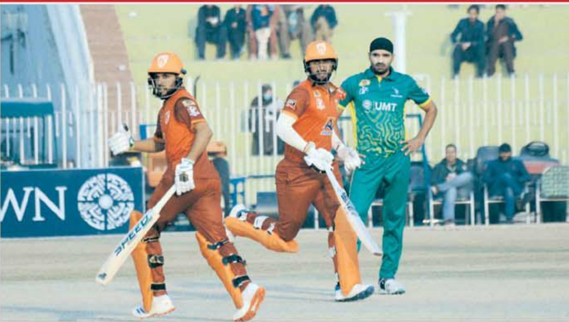
RAWALPINDI: A view of match between Allied Bank Stallions vs UMT Markhors during ongoing The Bahria Town Champions T20 Cup at Rawalpindi Cricket Stadium.