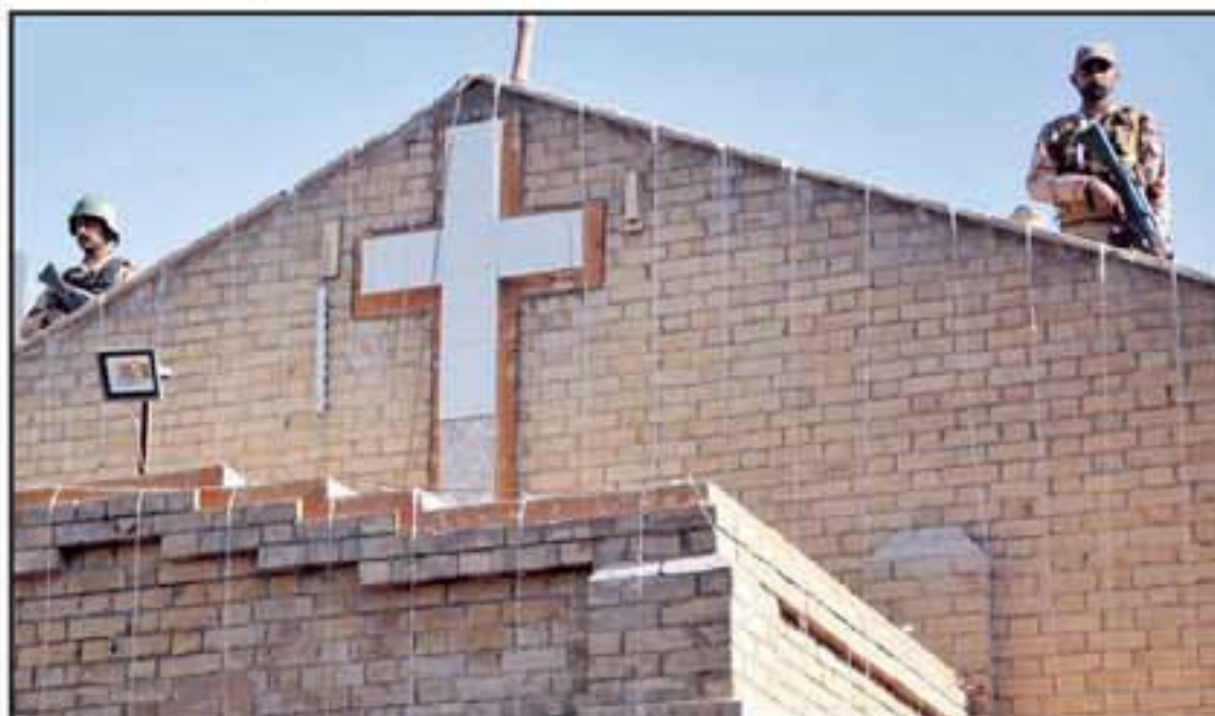
QUETTA: Security personal stand alert on the roof top of the church during Christians Community attend prayers & Christmas Mass at Bethel Memorial Methodist Church. Christians throughout the world are celebrating Christmas to mark the birthday of Jesus Christ.