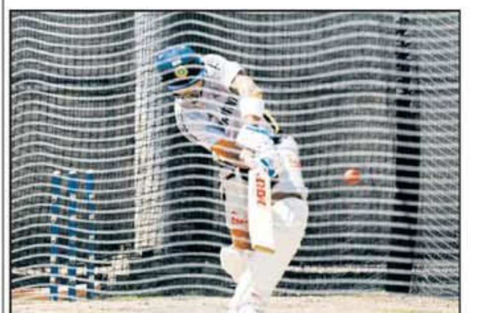
MELBOURNE: Indian batter Virat Kohli plays a shot in the nets at the Melbourne Cricket Ground

In the women's category, Sindh edged out Punjab 2-1, while Army thrashed Balochistan 3-0.