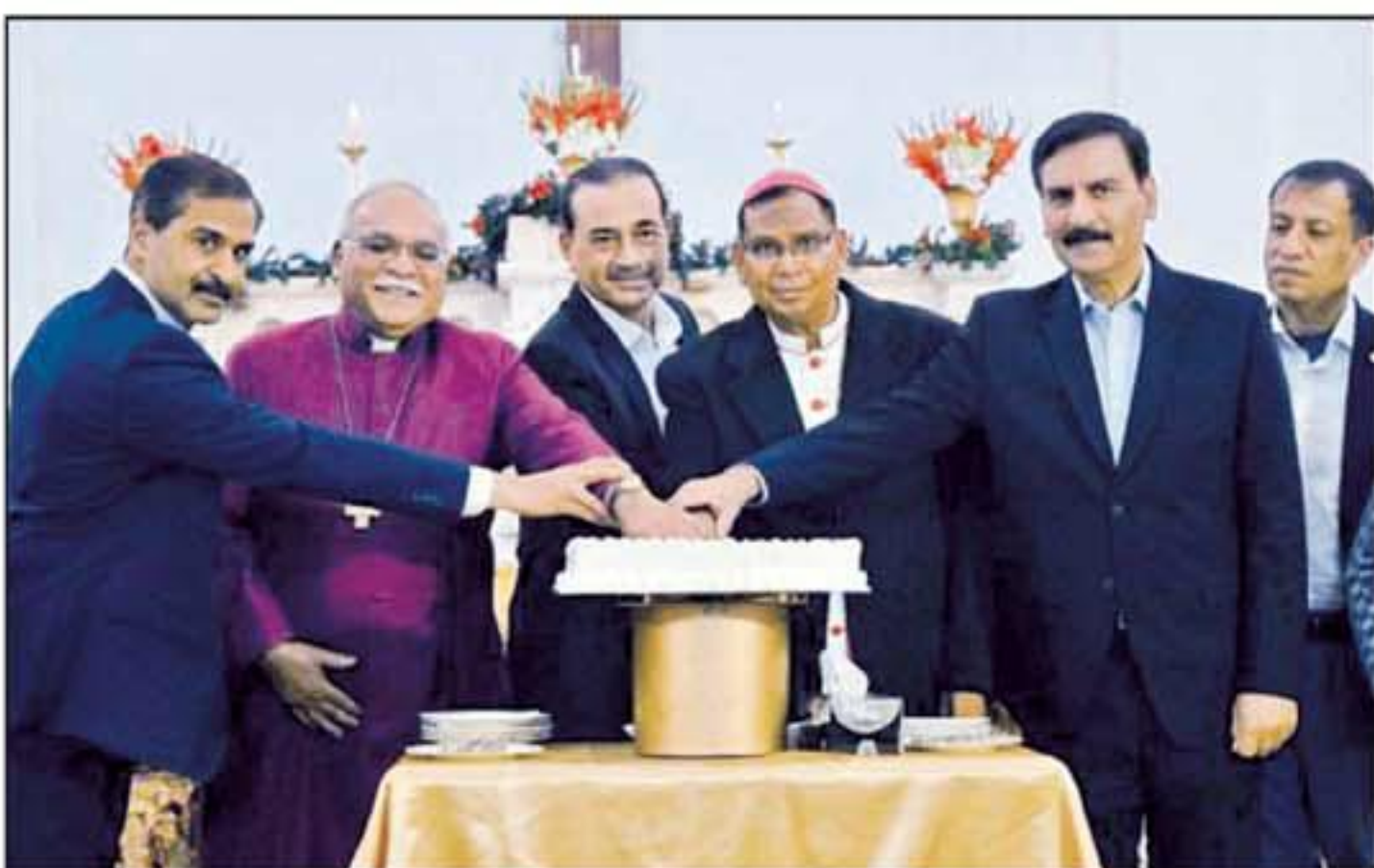
Chief of Army Staff (COAS), General Asim Munir cutting cake along with Christian community during annual commemoration ceremony on the occasion of Christmas Day held at St. Josephs Catholic Cathedral Church in Rawalpindi.