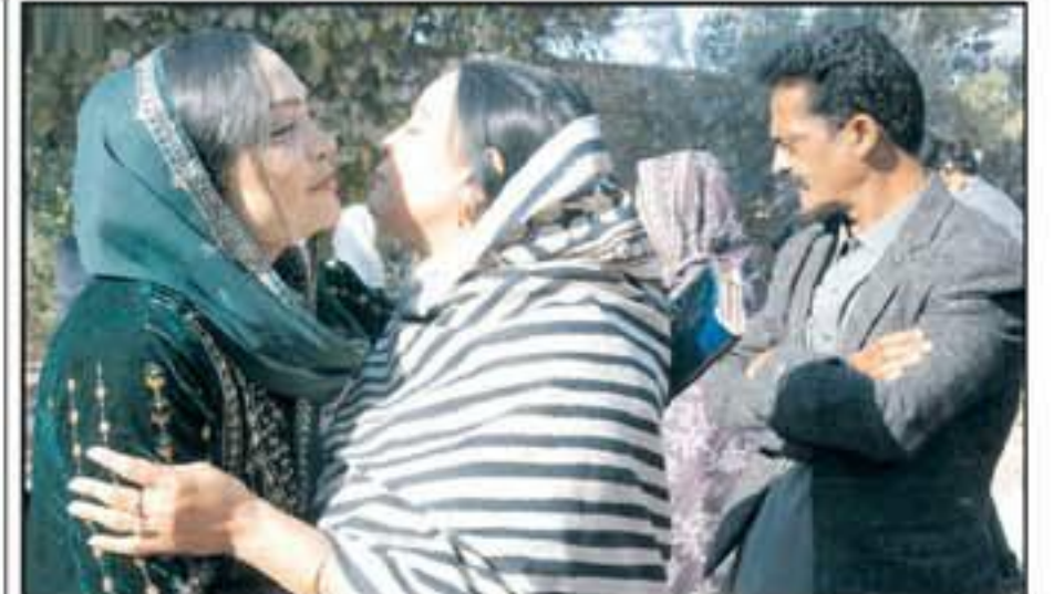
QUETTA: Christians' woman exchange greetings after Christmas Mass at Bethel Memorial Methodist Church. Christians throughout the world are celebrating Christmas to mark the birthday of Jesus Christ.

As we celebrate this significant day, let us renew our commitment to upholding the values for which Quaid-e-Azam fought.