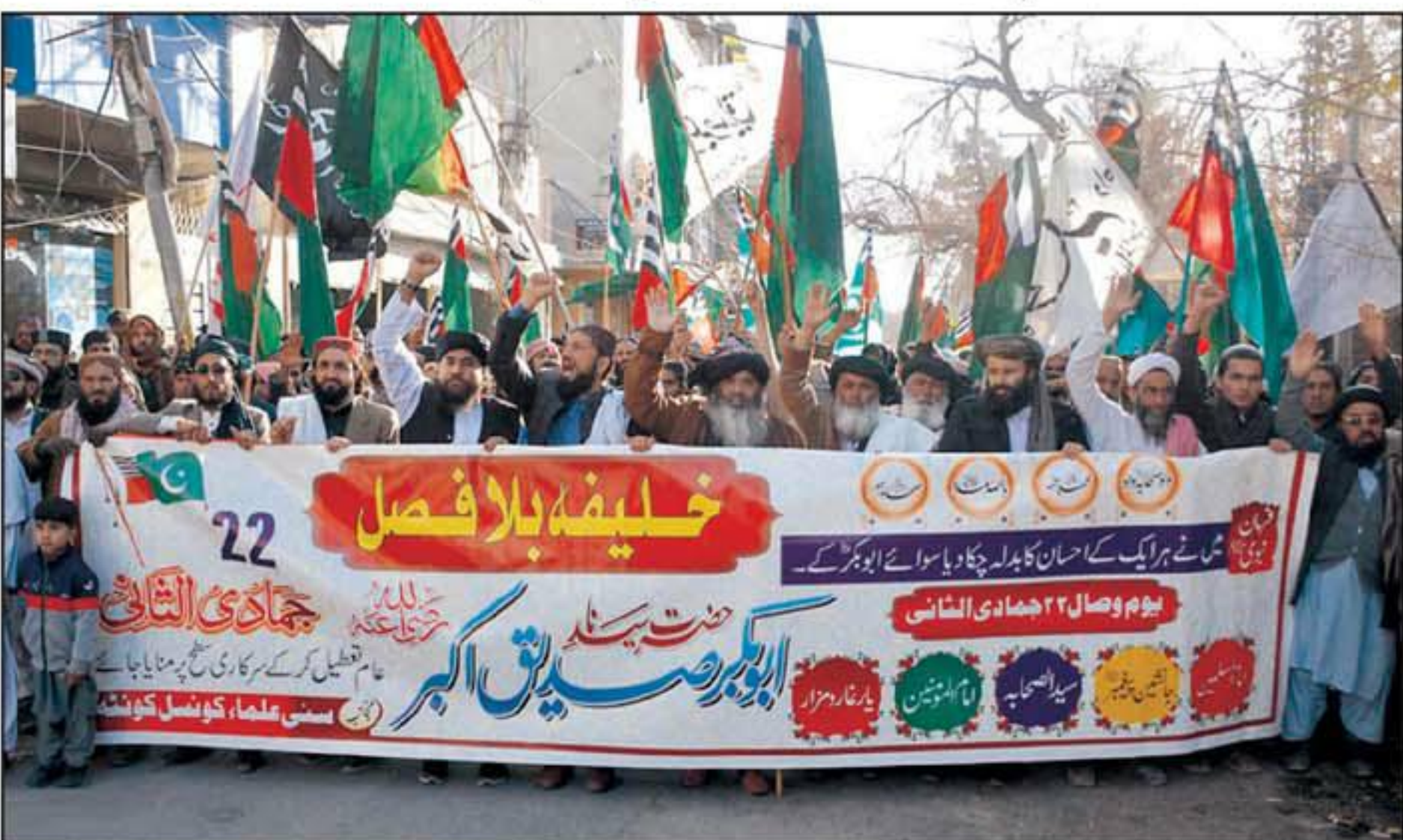
QUETTA: Activates of Sunni Ulama Council hold protest outside QPC.

Bulldozers also demolished infrastructure in Tulkarm camp, including homes, shops, part of the walls of Al-Salam mosque, which they barricaded off, and part of the camp's water network, it said.