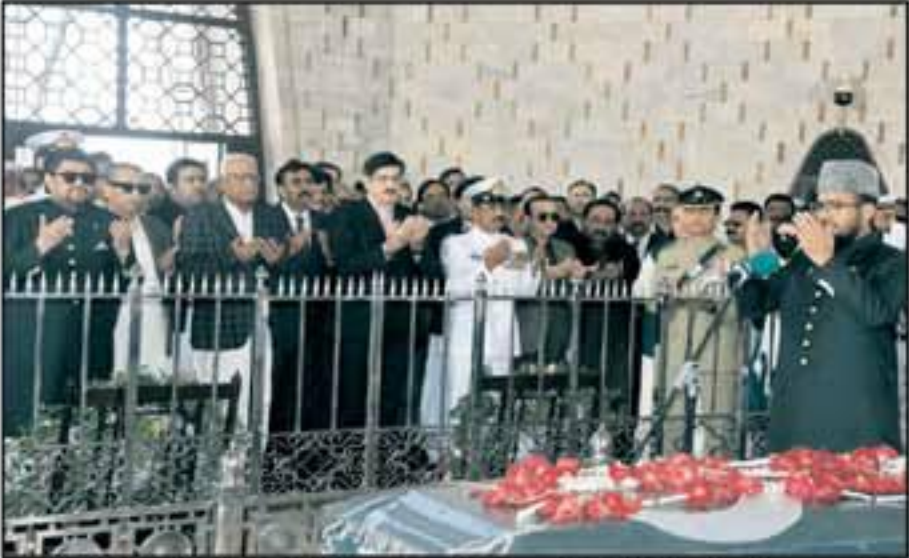
Sindh Chief Minister, Syed Murad Ali Shah along with Kamran Tessori, Governor Sindh and others are offering prayer at grave of Founder of Pakistan Quaid-e-Azam Muhammad Ali Jinnah on occasion of his birthday anniversary, in Karachi.

The dead bodies of deceased police Jawans were brought to RBUT Civil Hospital Shikarpur for Medico legal formalities.