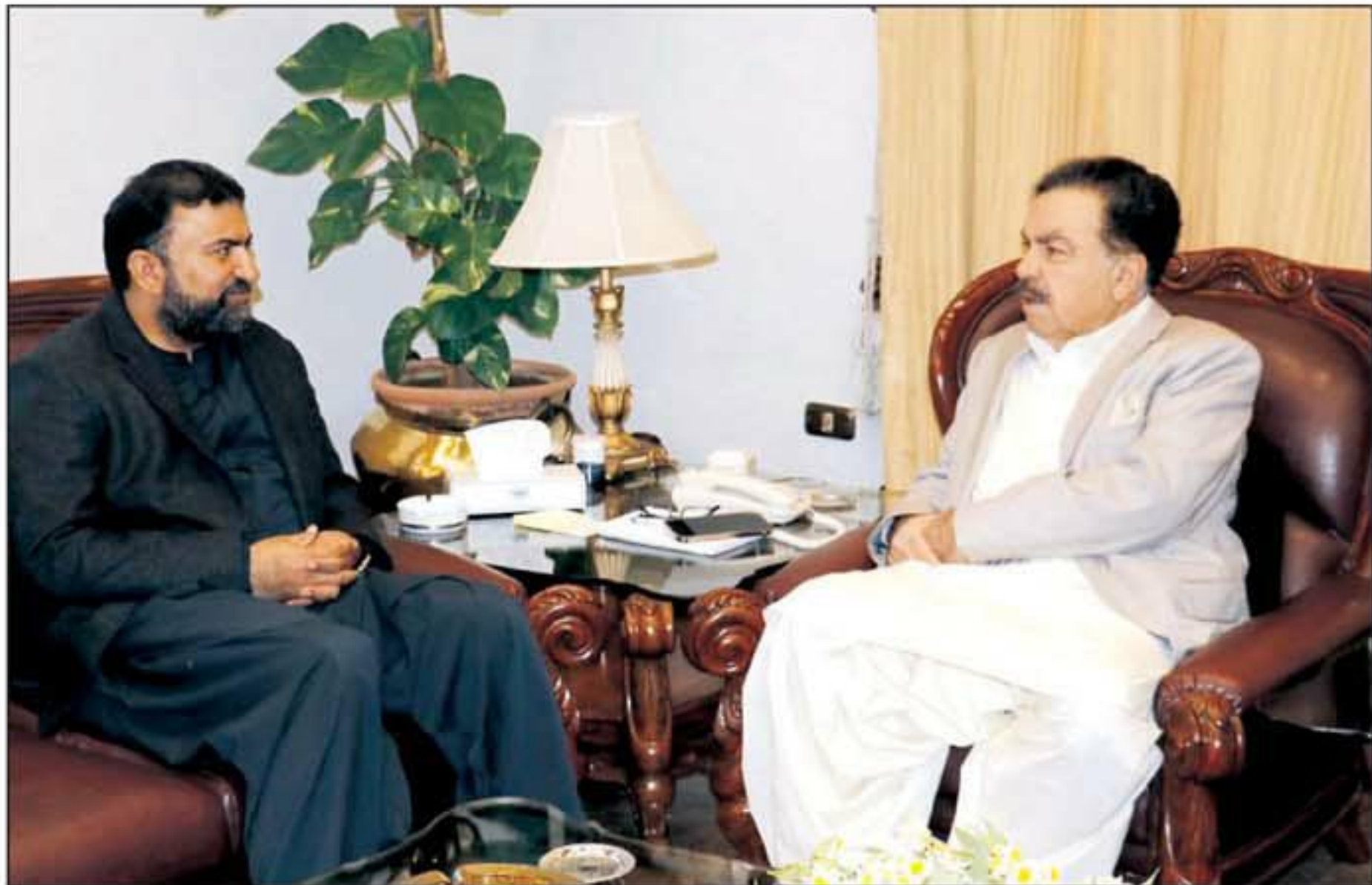
QUETTA: Governor Balochistan Jaffar Khan Mandokhel in a meeting with CM Balochistan Mir Sarfraz Bugti.

"It won't be the case that we will accept all the demands they'd bring forward and vice versa. So, going back and forth on each point and demand, along with finding common ground, will inevitably take time."