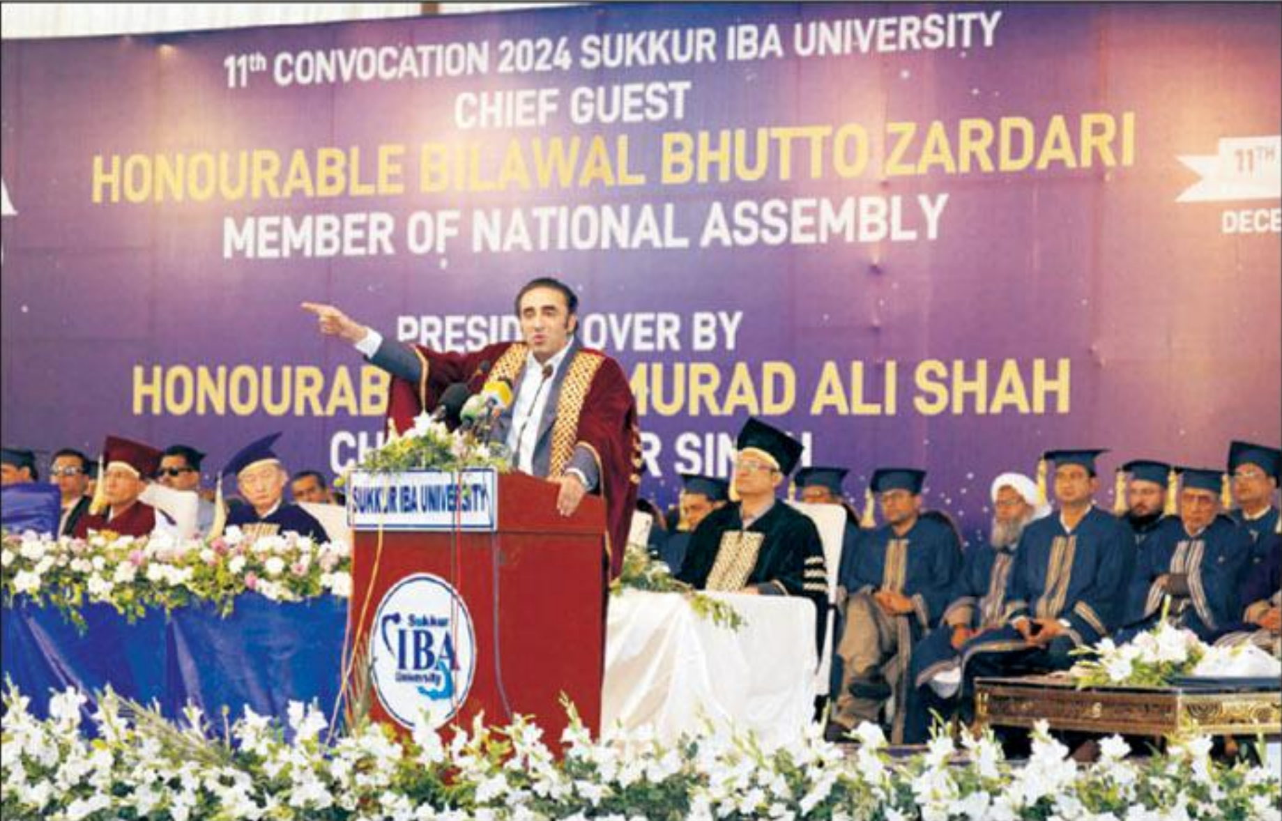
Peoples Party (PPP) Chairman, Bilawal Bhutto Zardari addresses during the 11th Convocation ceremony of Institute of Business Administration (IBA) Sukkur

On the occasion, Ahsan Iqbal emphasized the need for a robust monitoring mechanism for SEZs and urged the implementation of reforms that can transform these zones into engines of economic growth.