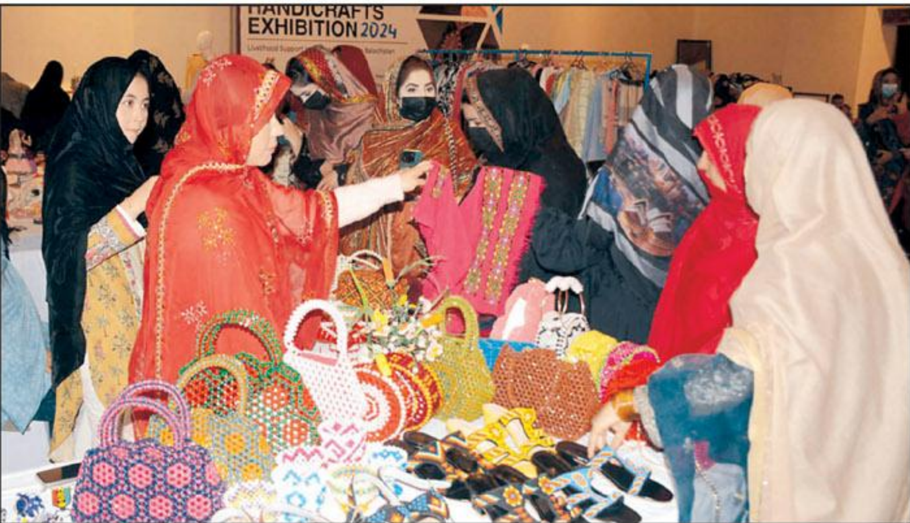
QUETTA: Woman takes interest in stall during ongoing Grand Handi Craft exhibition at local hotel.

leading to increased costs and reduced profitability. How can the agricultural sector in Pakistan be transformed by bringing together farmers, agri-service providers, and the agri-industry to lead essential technological changes required for proper crop scheduling and access to new technologies? These changes can improve agricultural practices and reduce environmental footprints, such as those from fertilizers and pesticide applications.