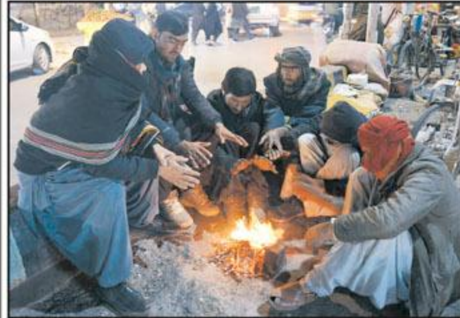
QUETTA: Vendors sitting around fire to warm themselves during chilled weather in Provincial capital.

(NED). Dear Journalists, we really appreciate your maximum cooperative support to the civil society organizations and the contribution in highlighting women and public issues all the time and thank you all for being here to cover the today's press conference. We, the members of Women Informal District Assembly demands the Government of Balochistan and other authorities. Limited Access to Education Barriers to Education: Many girls in Balochistan do not have access to education, particularly in rural and tribal areas. Factors like poverty, a lack of schools, and traditional gender norms discourage female education.