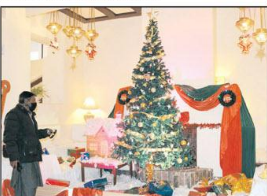
QUETTA: A man viewing Christmas tree install at local hotel.