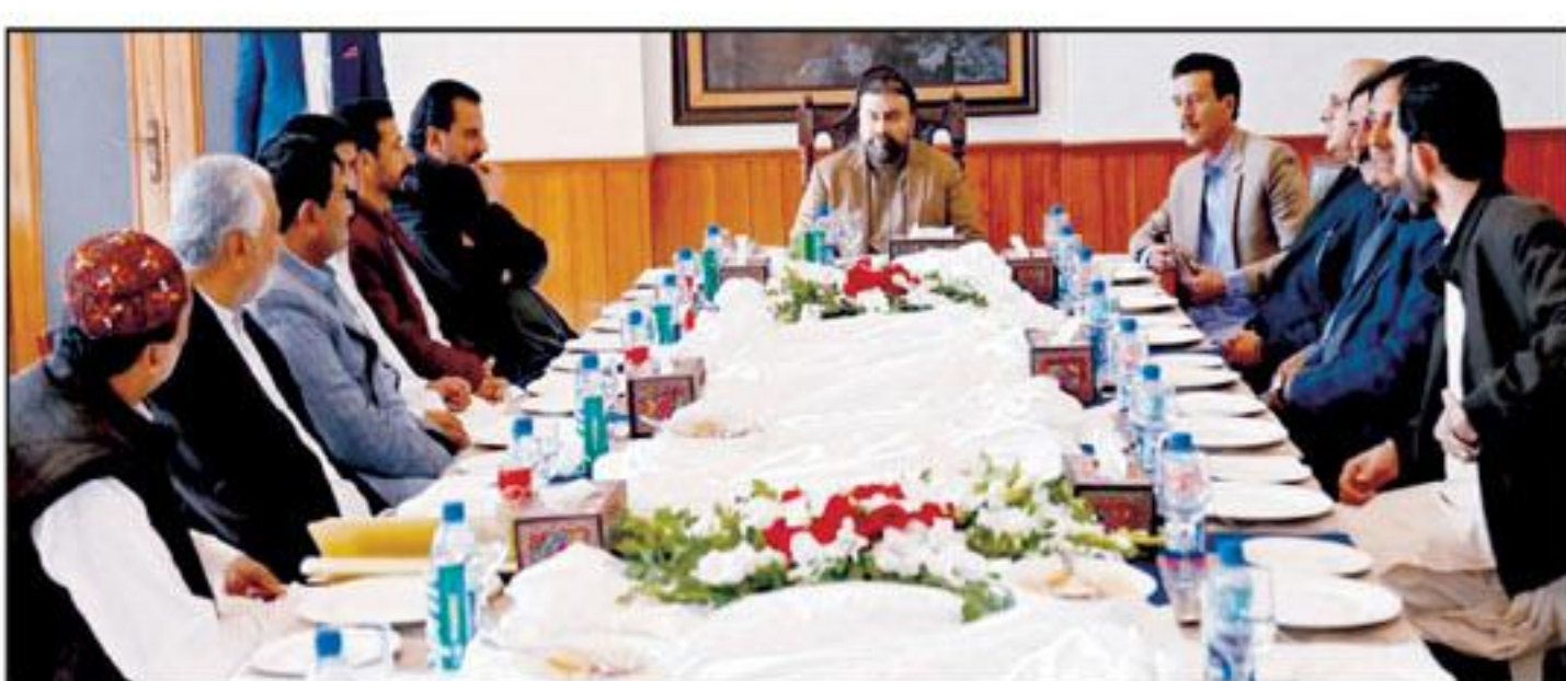
QUETTA: Balochistan Chief Minister Mir Sarfraz Bugti decided in a meeting of the Division Presidents and General Secretaries of PPP to review the preparations of martyrdom anniversary of Shaheed-e-Jamhuriat, Benazir Bhutto.

He emphasized that the Party workers should identify the issues faced by the public at the grassroots level. "To meet the expectations of the people, all party officials and workers must work among the people to alleviate their suffering and problems," he remarked. The chief minister said that the provincial government was working to improve the service delivery system to address the issues faced by the public. "We are ensuring the correct use of available resources for the welfare of the common man, under the leadership of President Asif Ali Zardari and Chairman Bilawal Bhutto Zardari, continuing the mission of Shaheed Benazir Bhutto," he added.