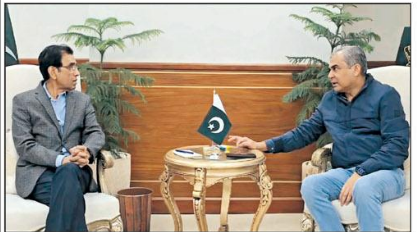
ISLAMABAD: Federal Minister for Interior Mobsin Naqvi met with MQM Chairman and Federal Minister Khalid Maqbool Siddiqui.

The visit of this high level defence delegation from Azerbaijan to Air Headquarters Islamabad signifies a resolute commitment of both countries to reinforce their military partnership, fostering collaboration and promoting robust relations.