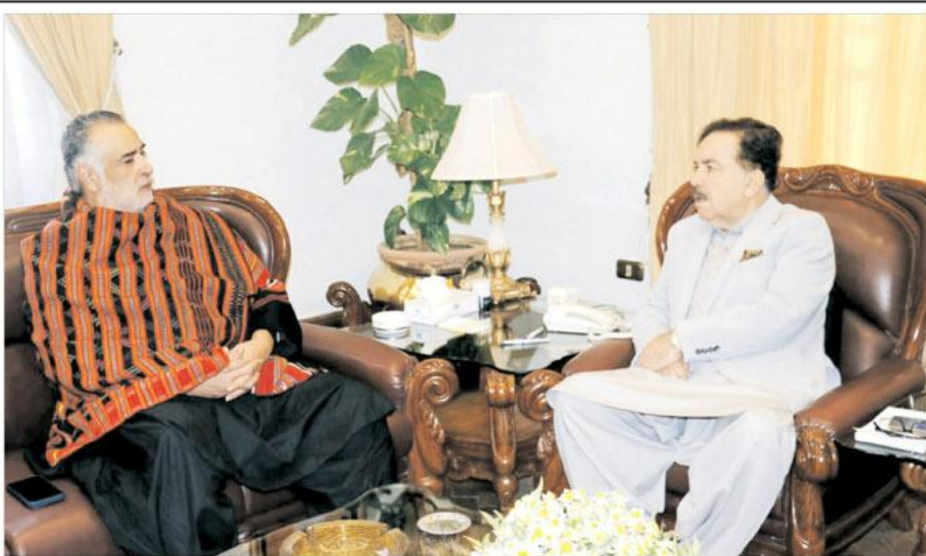
QUETTA: Governor Balochistan Jaffar Khan Mandokhel in a meeting with Senator Dostain Khan Domki.

"Prime Minister Shehbaz Sharif has always focused on youth development, introducing initiatives like the laptop scheme, scholarships, and endowment funds," he proudly shared.