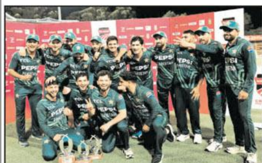
JOHANNESBURG: Pakistan cricketers pose with the trophies after winning the third ODI against South Africa at the Wanderers.

"As far as new players are concerned, there is a lot of potential in Pakistan, and there are many performers," said Rizwan.