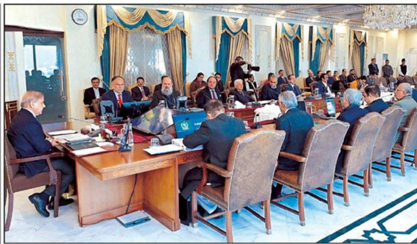
ISLAMABAD: Prime Minister Shehbaz Sharif chaired meeting of the Federal Cabinet.

The military court last week sentenced 25 individuals involved in the attacks on state installations during the violent protests of May 9, 2023. The violent protests broke out after Pakistan Tehreek-e-Insaf (PTI) founder Imran Khan was taken into custody in a graft case. In turn, scores of party workers were arrested and more than 100 civilians are facing military trials. However, the Khan-founded party maintained that it had no role in the incidents involving military installations, including the attack on the General Headquarters (GHQ), and has called for a judicial probe into last year's events.