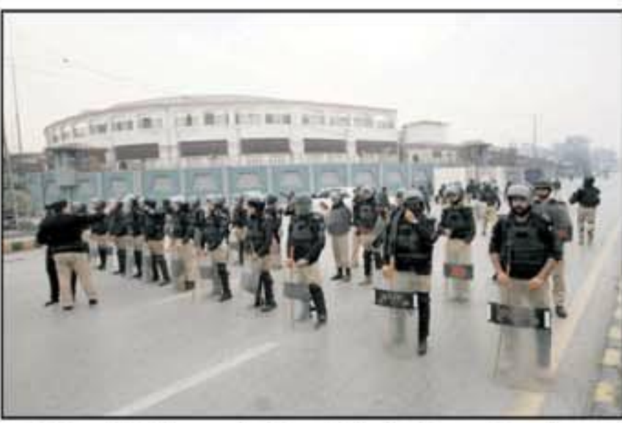
Police officials are standing high alert to avoid untoward incident during the funeral prayer of Tehreek-e-Insaf (PTI) supporters who were died in a protest in Islamabad, in Peshawar.