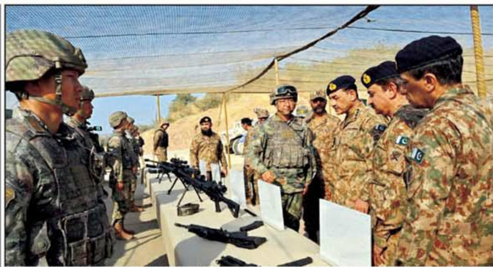
Chief of Army Staff (COAS), General Asim Munir interacts with the participants of Pak-China Joint Exercise Warrior-VIII between Pakistan Army and Peoples Liberation Army of China held at National Counter Terrorism Center (NCTC) in Pabbi.

The Chief Minister said that organized conspiracies are being hatched against Pakistan and the youth are being brainwashed against the state due to unbalanced development.