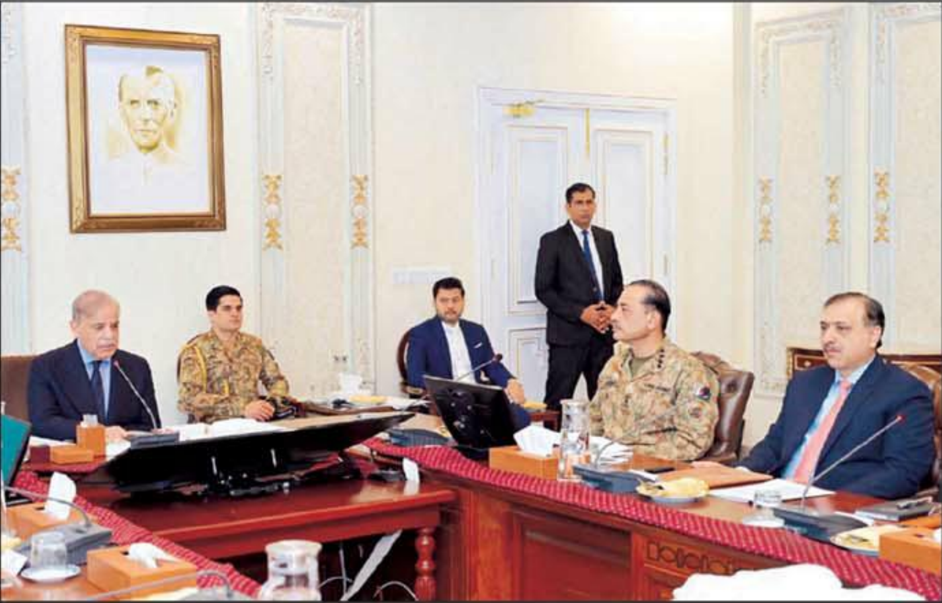
Prime Minister, Muhammad Shehbaz Sharif chairs a high level meeting regarding law and order, in Islamabad

have done after reaching D-chowk?" Sanaulah's remarks regarding the deaths of PTI protesters mark a divergence from the claims by the government and its ministers so far. A day ago, Information Minister Attaullah Tarar said both major hospitals in the capital — Pakistan Institute of Medical Sciences and Polyclinic — had denied receiving any bodies or people with gunshot wounds. Besides, he added, the Ministry of National Health Services also issued a statement denying the PTI's claim that its workers were killed in security forces' firing. The minister stated that a list circulating on social media regarding the death of protesters had been declared fake. Interior Minister Mohsin Naqvi has also categorically said that there was no loss of life in the law enforcement action taken to disperse marchers. Normally, after any major incident such as a terrorist attack, natural disaster or other such happening, health authorities and institutions issue official lists of the number of dead and injured people who were brought to hospital. But this time around, healthcare authorities have not issued any such lists, and information being shared by journalists and social media users seems to be based on anonymous reports with nothing concrete to back them up.