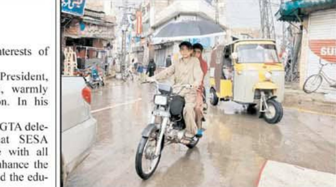
Commuters are passing through a road during the downpour of winter season, in Quetta.