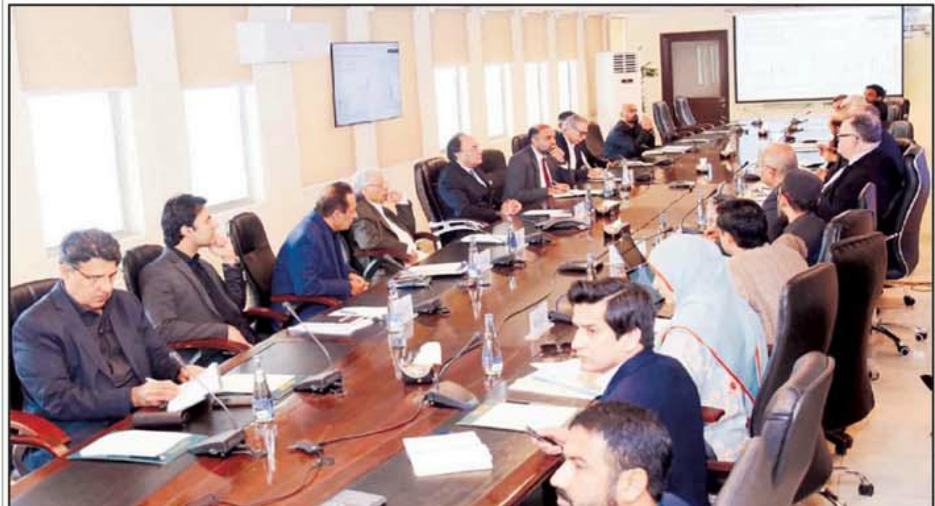
Federal Minister for Finance and Revenue, Senator Muhammad Aurangzeb chaired a meeting of the Advisory Committee on Release of IMT Spectrum for Improvement of Next Generation Mobile Broadband Services in Pakistan held at Finance Division in Islamabad.

events in Islamabad and expressed concern over the restriction of access to information. He pointed out that access to information is a fundamental constitutional right, and restricting it, especially from critical institutions like hospitals, does not prevent the truth from emerging. "It only leads to the spread of rumors and forces people to form their own conclusions," he said. Rehman also reiterated Jamaat-e-Islami's long-standing demand for a genuinely elected government. "The country will only progress when the real representatives of the people are in power," he said, calling for the formation of a judicial commission based on Form 45 to bring in a truly elected government. He further demanded the release of all political prisoners and the annulment of the 26th Constitutional Amendment. On economic issues, Rehman urged the government to prioritize the welfare of the people over compliance with the IMF's conditions. He called for a reduction in the prices of electricity, petrol, and essential food items. He also suggested using the benefits from IPP agreements to decrease electricity costs. Jamaat-e-Islami pledged to continue its struggle for the rights of the people and to stand firm in opposing any actions that undermine democracy.