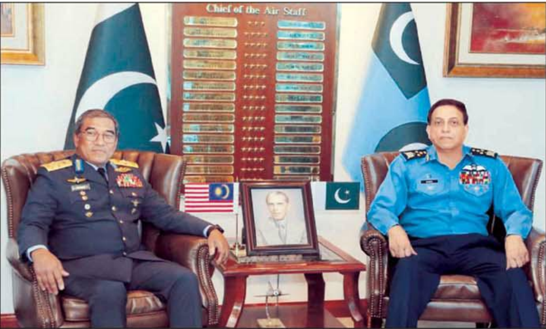
Pakistan Air Force (PAF) Chief of the Air Staff, Air Chief Marshal Zaheer Ahmed Baber Sidhu exchanging views with General Tan Sri Dato Sri Mohd Asghar Khan Bin Goriman Khan, Chief of the Royal Malaysian Air Force during meeting held at Air Headquarters in Islamabad.

He said that it is in the context of this leadership style that we advance our educational institutions which reduce fears and open up bright possibilities.