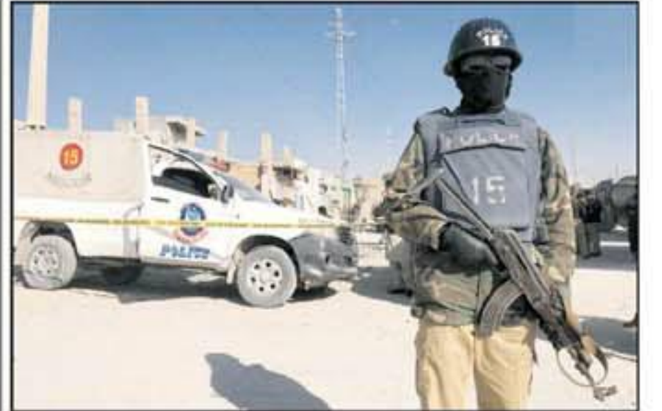
QUETTA: A police personal standing on attack site. A police officer was injured in a bomb blast near a police vehicle on the Western Bypass in Quetta on Friday.

The Interior Minister also expressed his commitment to transforming the National Police Academy into a world-class institution, equipped with the latest facilities. He mentioned that a task force has also been established for this purpose.