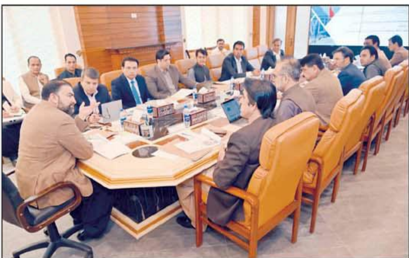
QUETTA: Chief Minister Balochistan Mir Sarfraz Bugti while chairing a review meeting on Ziarat Development Authority (ZDA) at the Chief Minister Secretariat.

It is to be noted that incarcerated PTI founder Imran Khan has given a call for countrywide protests on November 24.