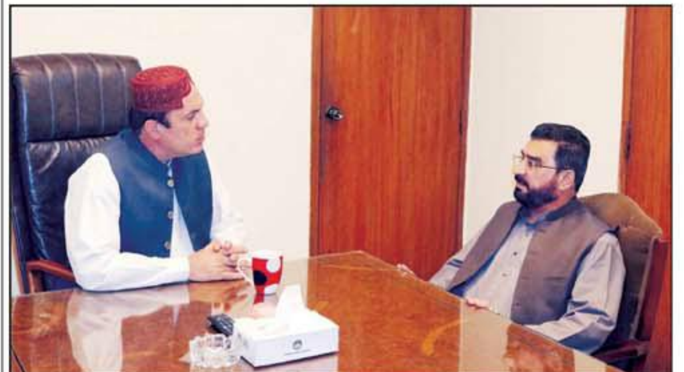
QUETTA: Speaker Balochistan Assembly Abdul Khaliq Achakzai in a meeting with Provincial Revenue Minister Mir Asim Kurd Gello.

Besides, the meeting signifies a resolute commitment to reinforce military partnership, fostering collaboration and promoting robust relations between the two countries. It focused on matters of mutual interest, military cooperation, joint training and collaboration in the industrial domain.