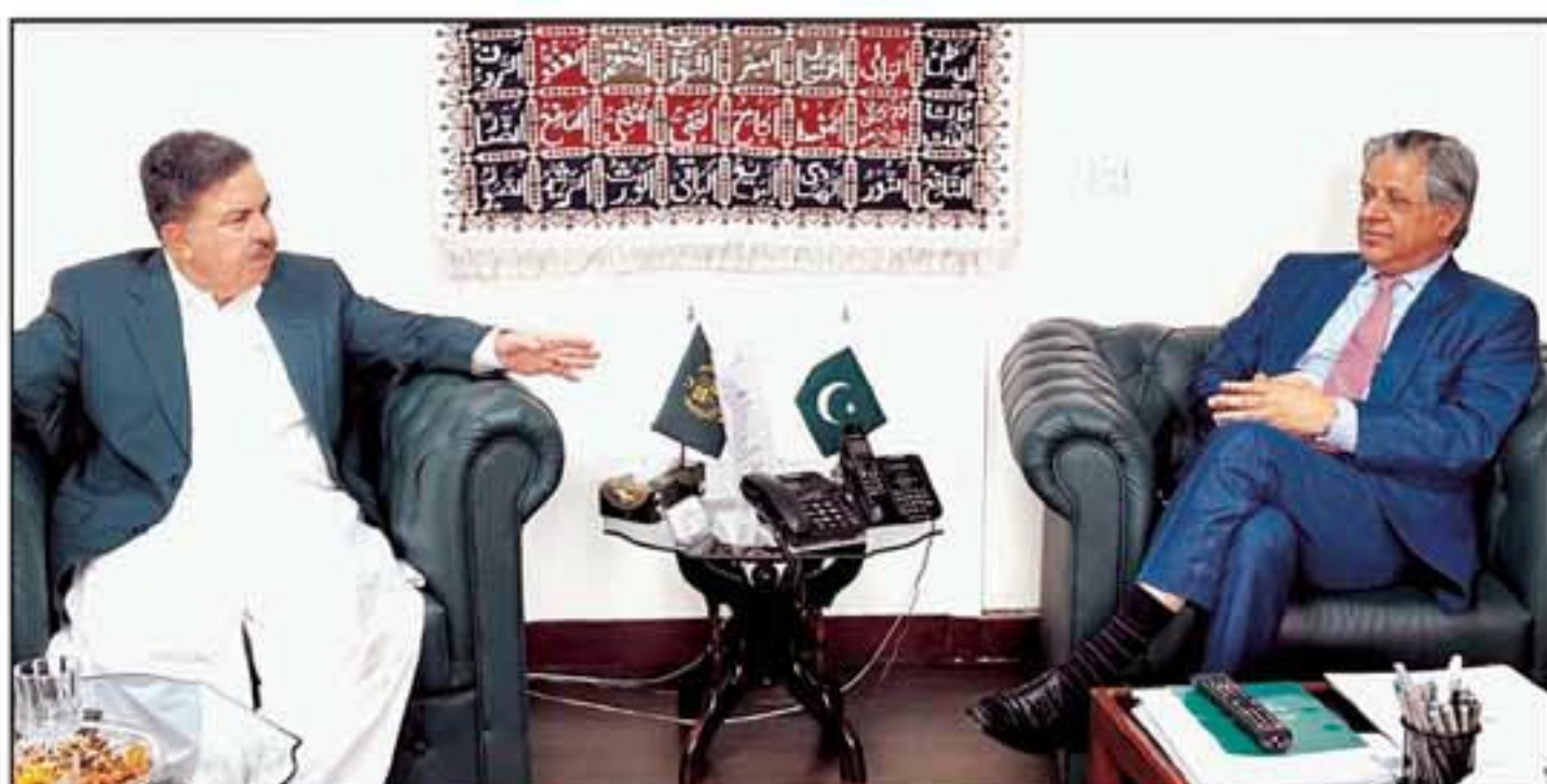
ISLAMABAD: Federal Minister for Law & Justice and Human Rights, Senator Azam Nazeer Tarar Thursday met with Governor of Balochistan, Sheikh Jaffar Khan Mandokhail.

The security forces of Pakistan, in step with the nation, remain determined to thwart attempts at sabotaging the peace, stability and progress of Balochistan, and such sacrifices of our brave soldiers further strengthen our resolve, the statement concluded, the statement added.