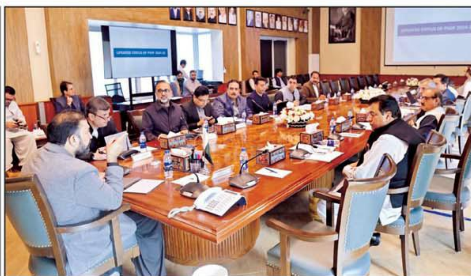
Chief Minister Balochistan Mir Sarfraz Bugti presided over the progress review meeting on development projects.

The bench additionally took up a plea seeking rescheduling of the 2024 elections, with a request before the court for elections to be held between February and March.