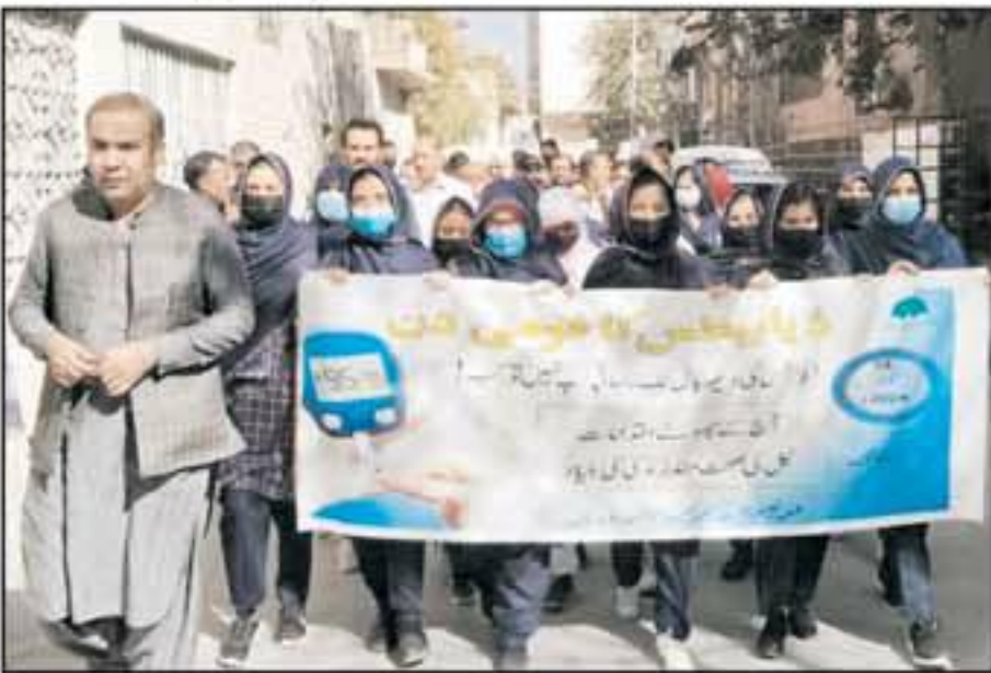
Participants are holding awareness walk on the occasion of National Diabetes Day organized by Health Department, at Civil Hospital in Quetta

Raising awareness and educating people on diabetes prevention and its adverse effects on health is essential, he added. Sadiq highlighted that the widespread consumption of unhealthy foods and lack of physical activity are accelerating the spread of diabetes.