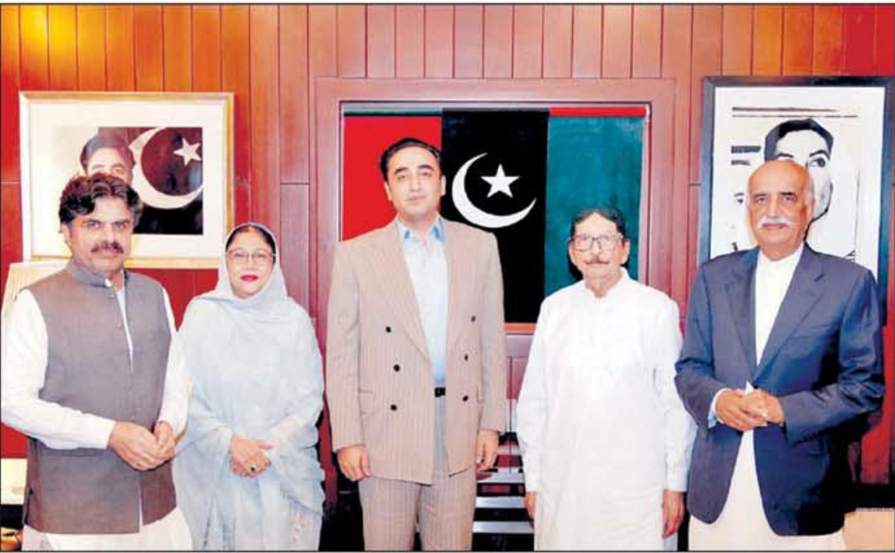
Peoples Party (PPP) Chairman, Bilawal Bhutto Zardari along with Faryal Talpur, President PPP Women Wing in a group photo along with PPP Senior Leaders, Syed Qaim Ali Shah, Syed Nasir Hussain Shah and Khurshed Shah, at Bilawal House in Karachi

Previously, Islamabad Judicial Magistrate has accepted the acquittal pleas of PTI founder Imran Khan, former Interior Minister Sheikh Rashid, and other co-accused in a case registered under Section 144 of the Code of Criminal Procedure (CrPC), along with violations of the Amplifier Act and other related provisions.