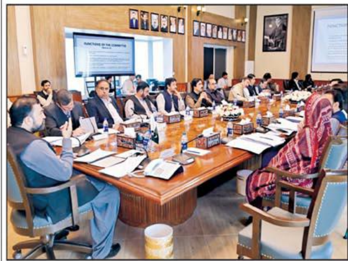
QUETTA: Balochistan Chief Minister Mir Sarfraz Bugti while presiding over a meeting of the provincial cabinet at the Chief Minister's Secretariat