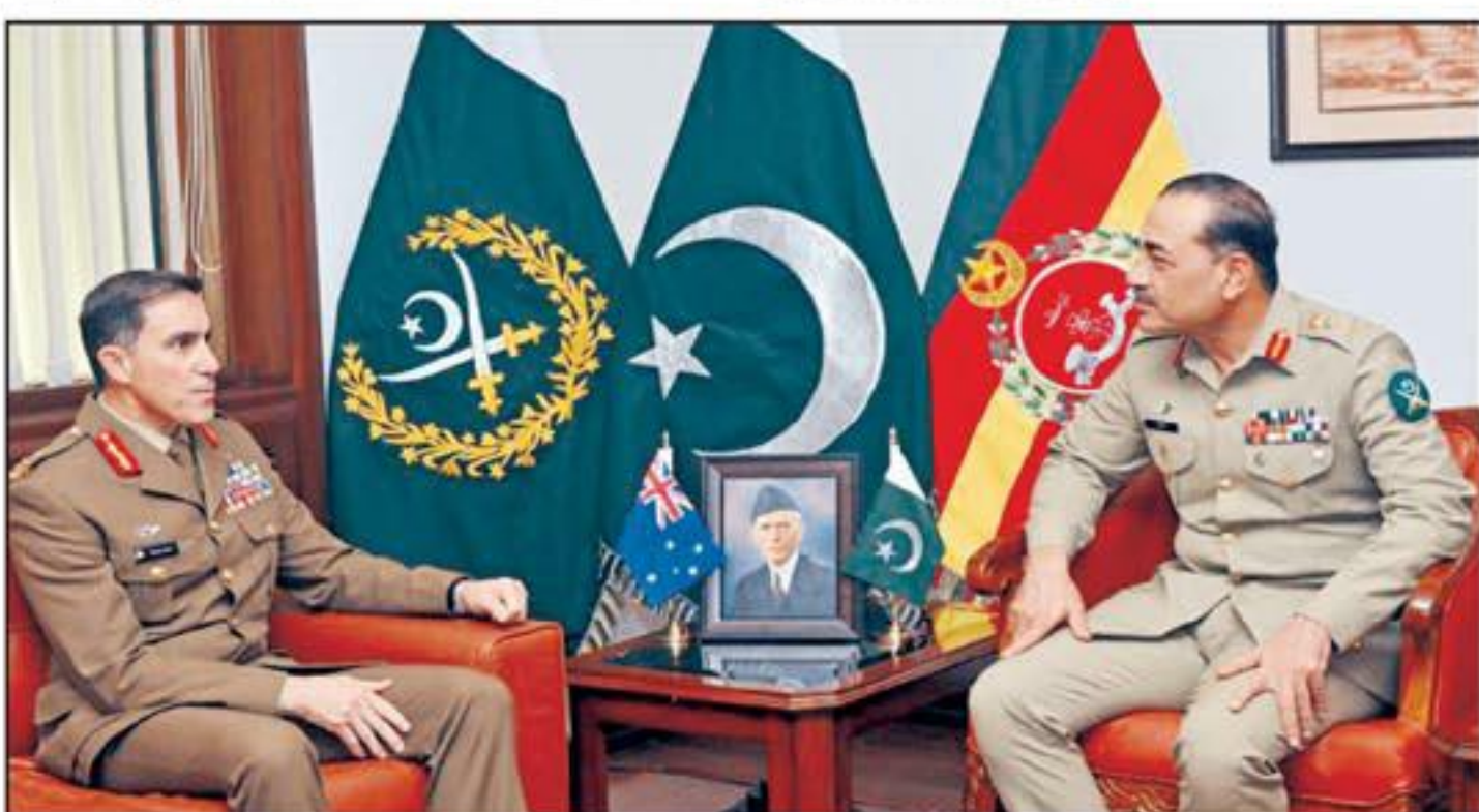
RAWALPINDI: Australian Army Chief Lieutenant General Simon Stuart, met with Chief of Army Staff (COAS) General Syed Asim Munir at the General Headquarters (GHQ).