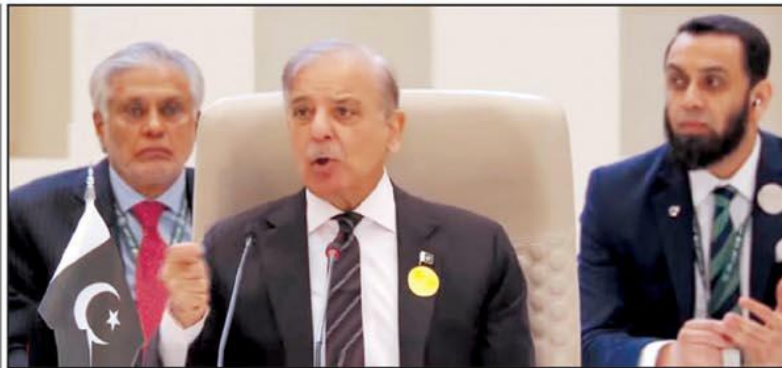
Prime Minister Shehbaz Sharif In his address to the Arab-Islamic Extraordinary Summit in Riyadh.

Mir Sarfraz Bugti said that Quetta city is the face of the entire province, therefore the expansion of Quetta development package is indispensable for the improvement of the provincial capital.