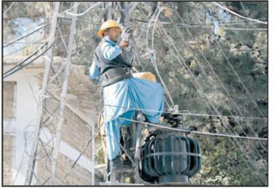
QUETTA: A Quetta Electric Supply Company (QESCO) worker repairing the transformer at Adalat road.

He further emphasized that terrorist elements seek to achieve their nefarious objectives by destroying national peace, but their conspiracies will never succeed. Playing with innocent human lives is severe terrorism, and such anti-social elements do not deserve any leniency. He called on the public to unite and stand against these malicious forces.