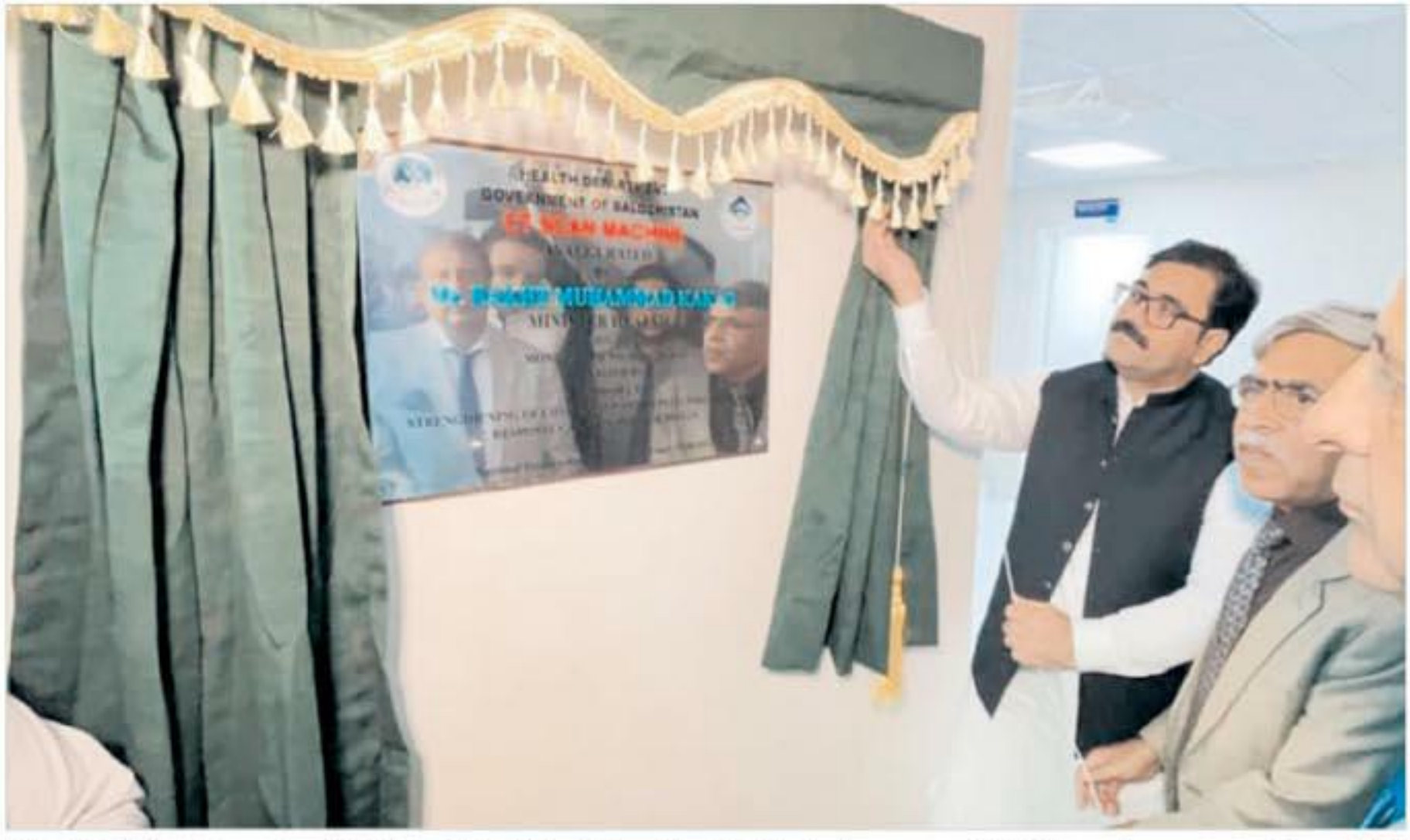
QUETTA: Provincial Health Minister Bakht Muhammad Kakar Inauguration CT Scan Ward Sheikh Bin Zayed Hospital.

PPP MNA Nabeel Gabol said earlier cases were registered on petty issues such as taking away somebody's buffalo.