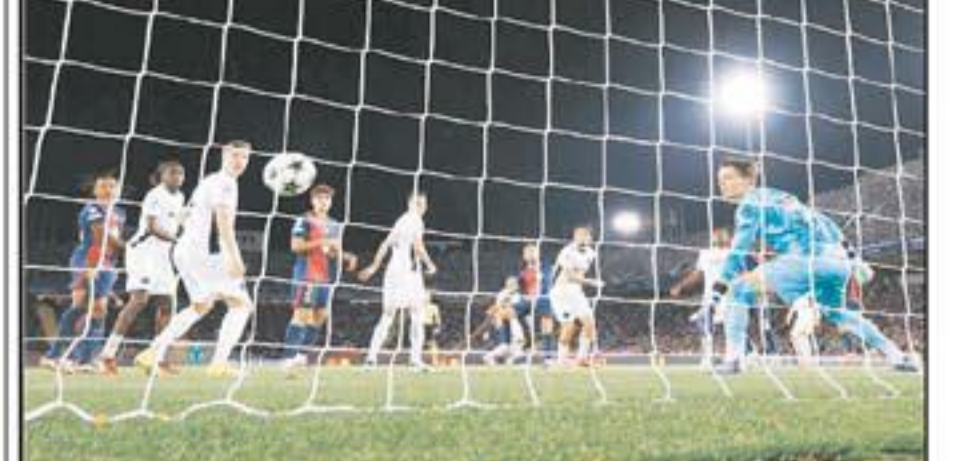
BARCELONA: Barcelona's Inigo Martinez Berridi (fourth R) scores during the Champions League match against Young Boys at Estadi Olimpic Luis Companys.

PARIS: Arsenal beat Paris St Germain 2-0 in their heavyweight duel on Tuesday, while Karim Adeyemi starred as last season's beaten finalists Borussia Dortmund ran riot against Celtic and Barcelona and Manchester City claimed their first wins in the restructured Champions League on Tuesday.