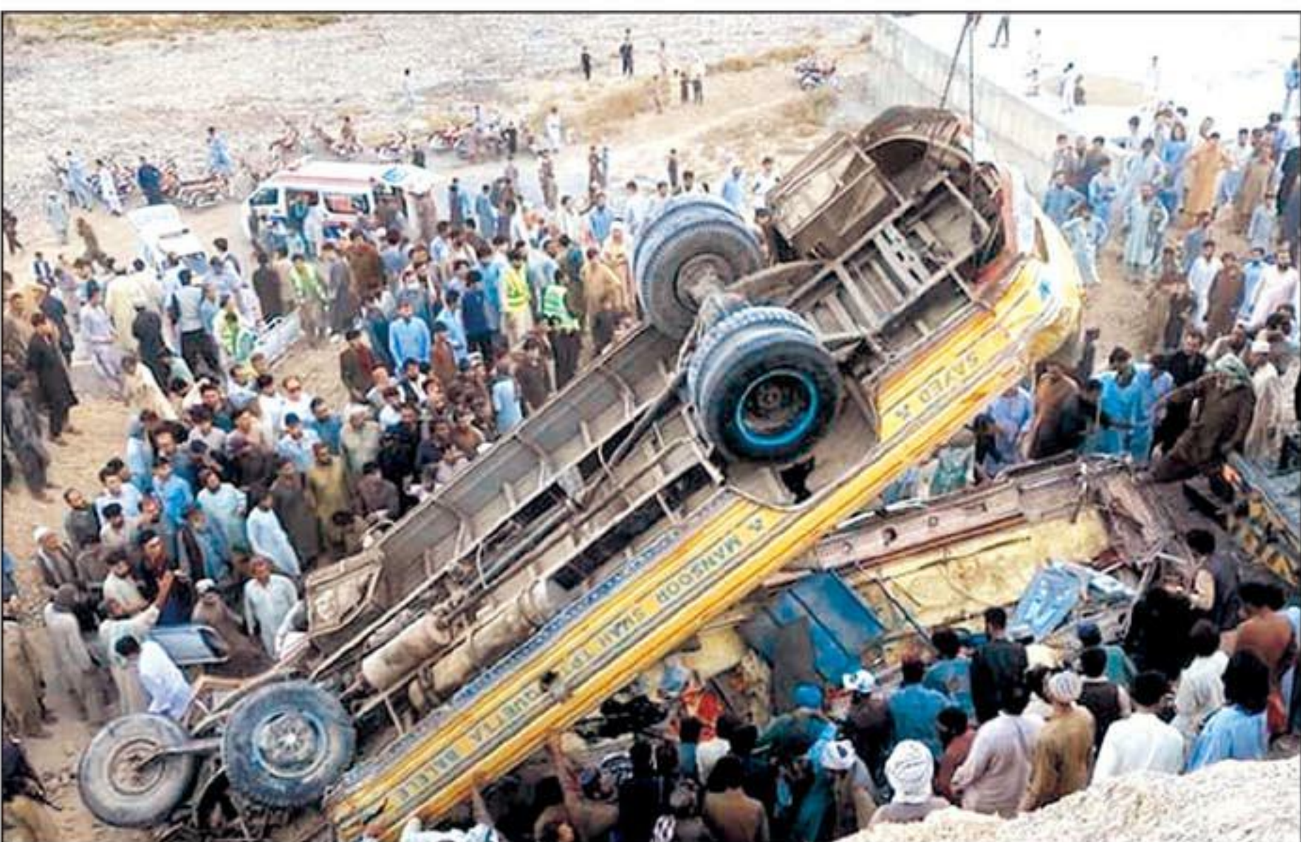
A large number of people are gathered after a bus fell into a ditch due to over speeding, near Hazara Graveyard located on Western Bypass in Quetta.

The Secretary of Privatization added that the timeline depends on the evaluation and terms, as some bidders are seeking more, and negotiations are still underway. Additionally, there is the issue of legacy liabilities. The Chair directed the Secretary of Privatization to finalize the process by 31st October, emphasizing that Pakistan's future depends on it. The Chairman also expressed optimism that the privatization efforts by PIACL will yield positive results.