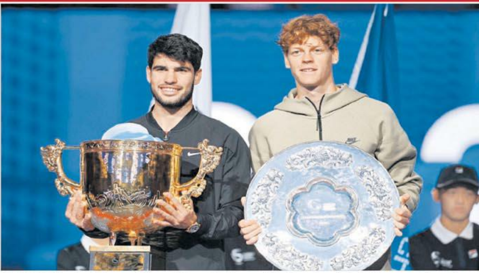
SPAIN'S Carlos Alcaraz (L) and Jannik Sinner of Italy pose with their respective winner and runner-up trophies after the China Open final.

DUBAI: The ICC Women's T20 World Cup begins on Thursday in the UAE with 10 teams featuring in the 18-day showpiece. Pakistan are placed in Group 'A' alongside Australia, India, New Zealand and Sri Lanka while Bangladesh, England, Scotland, South Africa and the West Indies are in Group 'B'.