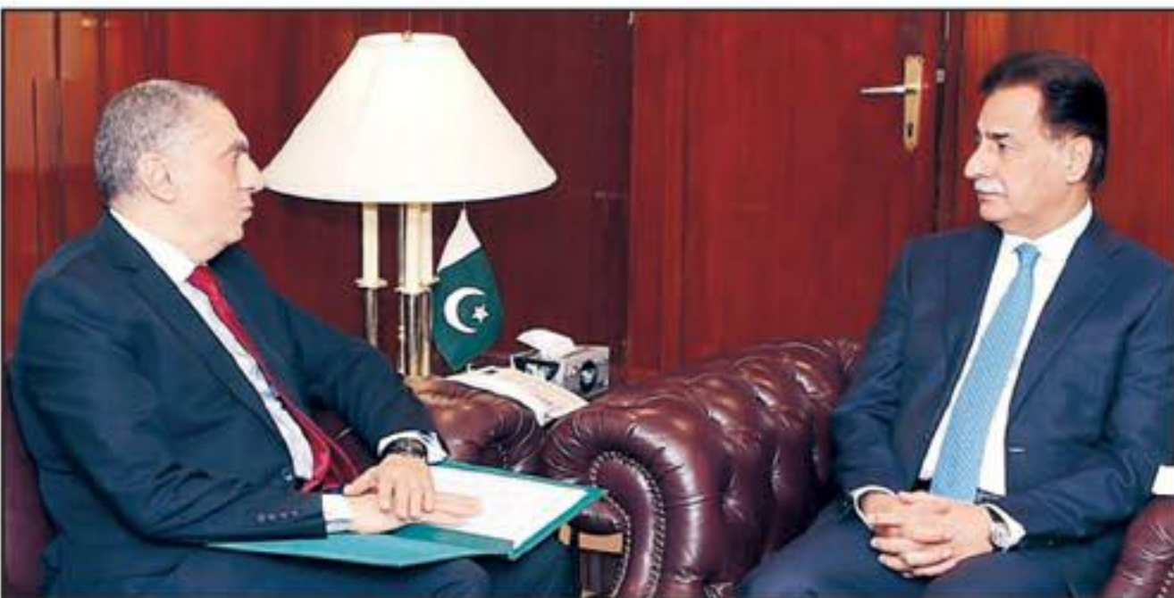
ISLAMABAD: Ambassador of Egypt Dr. Ihab Mohamed Abdelhamid Hassan called on Speaker National Assembly Sardar Ayaz Sadiq at Parliament house.