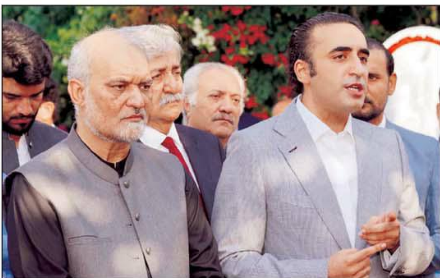
Peoples Party (PPP) Chairman, Bilawal Bhutto Zardari along with Jamat-e-Islami (JI) Chief, Hafiz Naem-ur-Rehman addresses to media persons during press conference after meeting held at Zardari House in Islamabad