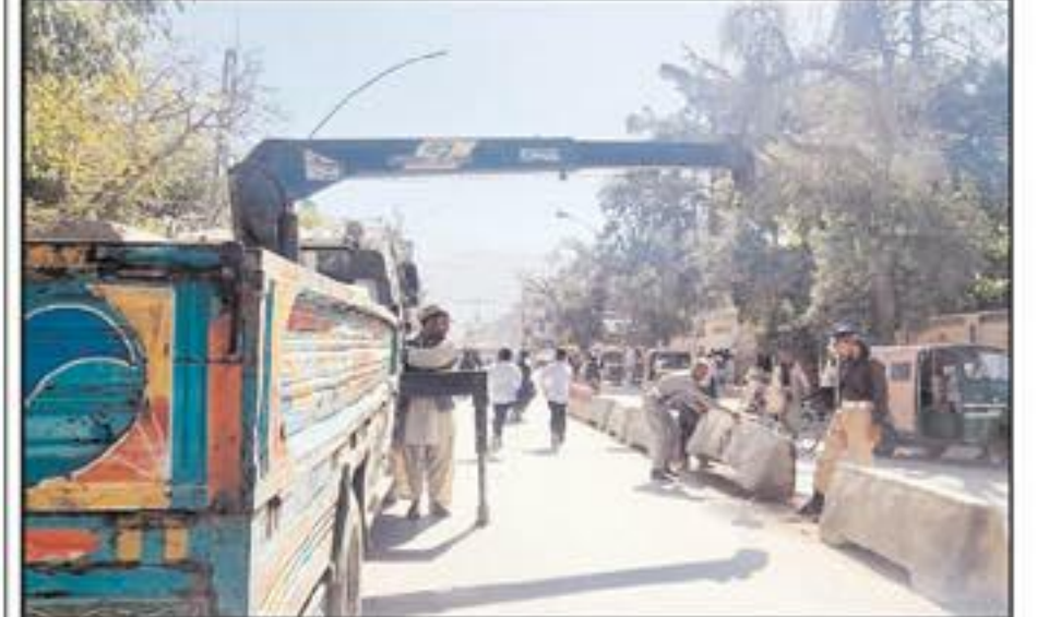
Heavy machinery busy in placing safety barriers on road under the supervision of Traffic Police located on Court road in Quetta.

same page for the defense of the country, he said. He said that the Prime Minister tried to wake up and disturb the world in front of the Israeli Prime Minister and the Indian leader which was followed by the entire Muslim world.