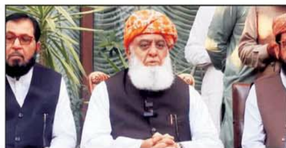
JUI-F chief Maulana Fazlur Rehman addresses a press conference.

The ex-minister referred to the Provisional Constitutional Order, an emergency power that suspends the Constitution in part or as a whole. In his letter, Qureshi added that any judges sworn into the constitutional court will be called, "PCO judges".