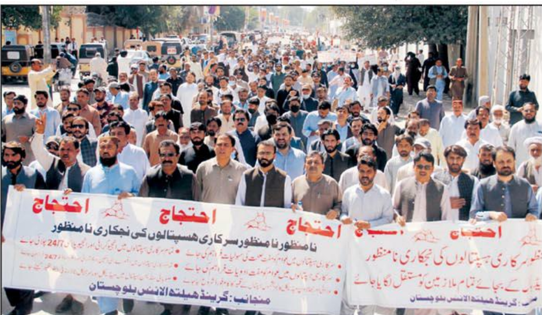
Members of Grand Health Alliance Balochistan are holding protest rally against privatization of government hospitals, in Quetta

if Netanyahu, under pressure at home to act, will be tempted to strike hard and deeper into Iran, taking the fight to his country's sworn enemy.