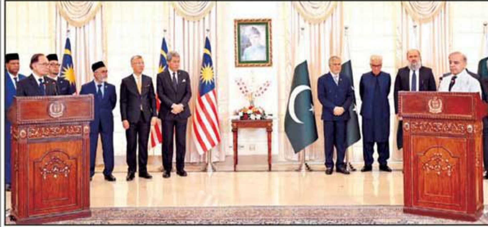
Prime Minister, Muhammad Shehbaz Sharif and Dato Seri Anwar Ibrahim, Prime Minister of Malaysia addressing a joint press stakeout in Islamabad

However, the lawyer's repeated mention of Khan didn't sit well with the CJP who said: "Why are you taking [Imran] Khan's name again and again, [you should] talk without taking [any] names."