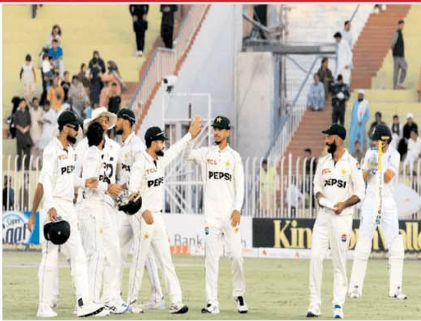
Pakistan players at the end of play at the Rawalpindi Cricket Stadium in Rawalpindi.

with women bearing the brunt of restrictions the United Nations have called "gender apartheid", including blocking women from participating in sports.