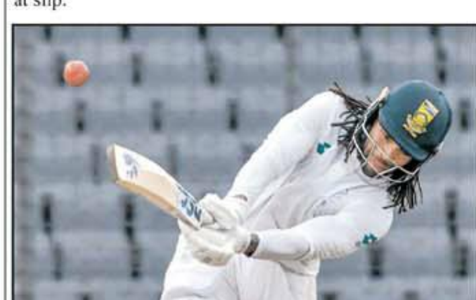
South African opener Tony de Zorzi plays a shot during the first Test against Bangladesh at the Sher-e-Bangla National Stadium.

Nayeem Hasan departed lbw without adding to his overnight 16 on the third ball of the day when a rampant Rabada inswinging kept low. Wiaan Mulder removed Tajjul for seven in the fourth over via a thick edge to Stubbs at third slip. Mehidy fell three runs short of his second Test century in the next over when he edged Rabada to Mulder at slip.