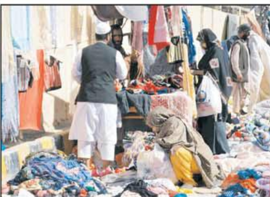
QUETTA: A woman selecting and purchasing used cloth from roadside vendor.

"There are about 4.5 million motorcycles in Lahore, according to the excise department. Every day, 1800 motorcycles have been accumulated," said Aurangzeb.