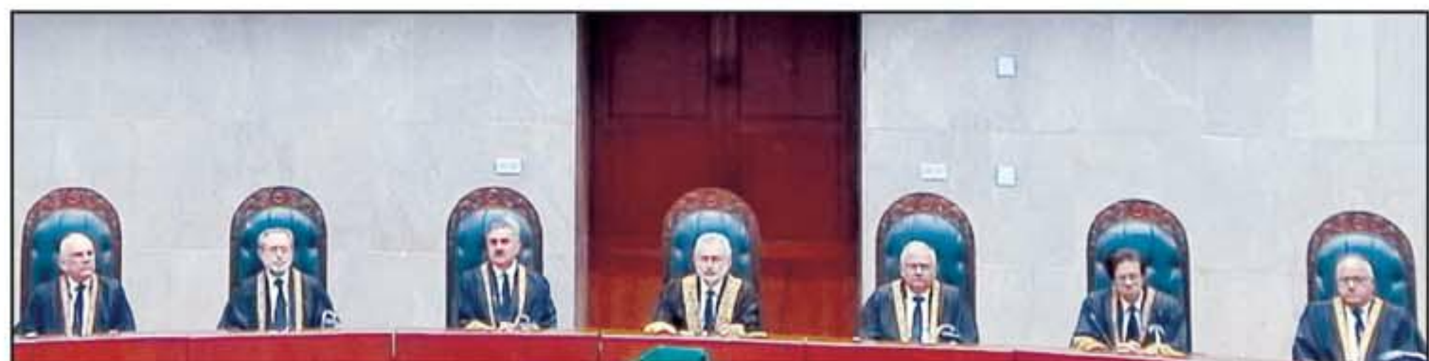
Supreme Court judges attend a full-court reference for CJP Qazi Faez Isa's farewell.

Justice Afridi said today's lunch in honour of Justice Isa is