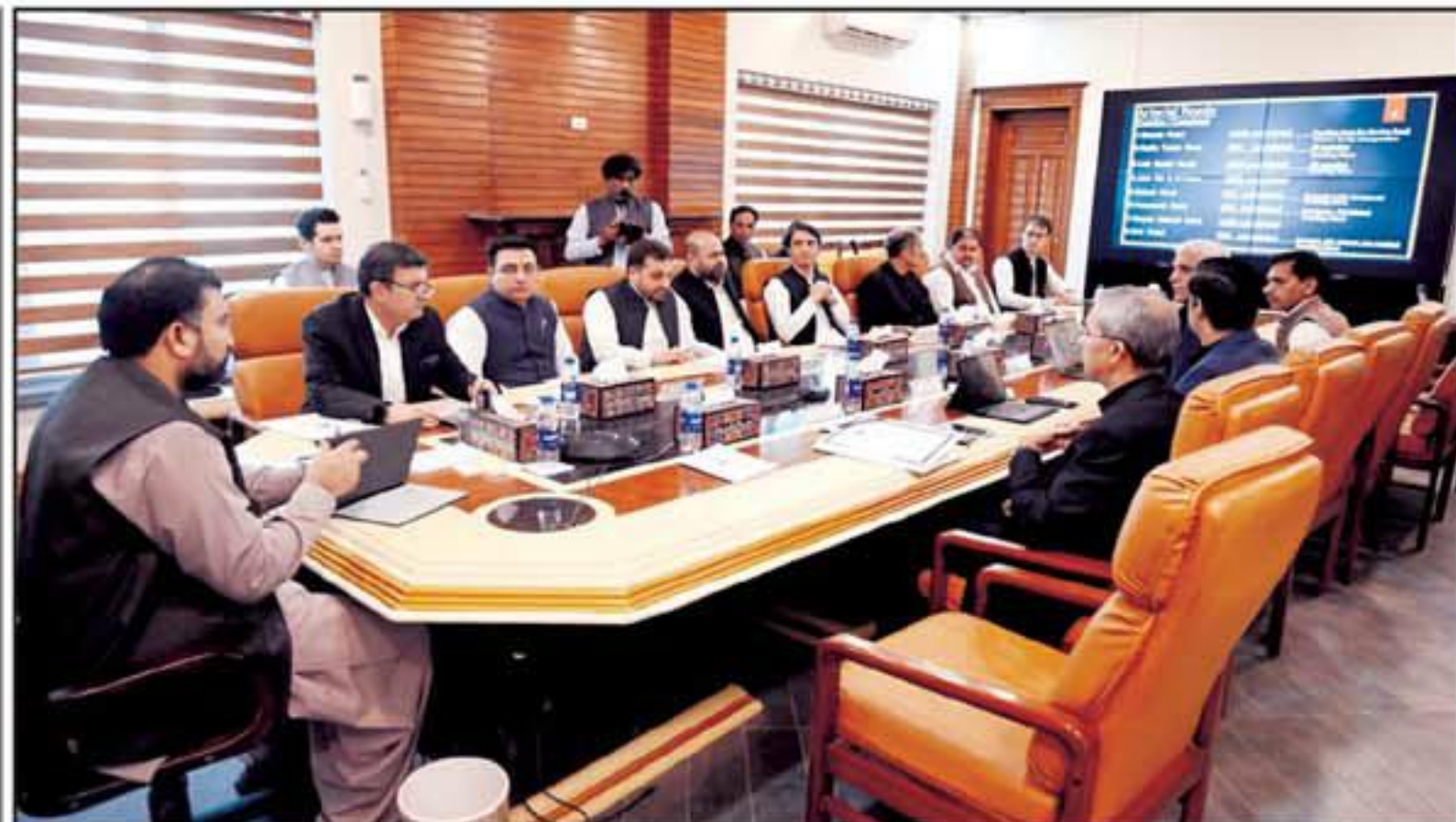
Quetta: Balochistan Chief Minister Mir, Sarfraz Bugti chairing a meeting regarding progress to the Quetta development package and the measures taken about the beauty of Quetta city.