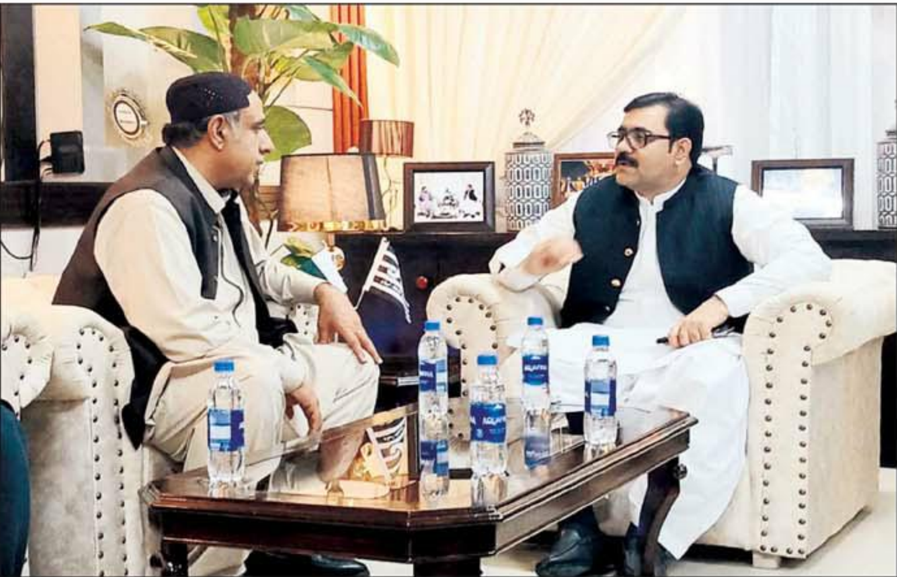
QUETTA: Provincial Minister Mir Saleem Khosa in a meeting with Provincial Health Minister Bakht Muhammad Kakar.

Meanwhile, the National Assembly today passed a unanimous resolution, reiterating Pakistan's full diplomatic, political and moral support to the people of Kashmir for their right to self-determination. The resolution was moved by Minister for Kashmir Affairs and Gilgit-Baltistan Engineer Amir Muqam on the 77th anniversary of Indian invasion of Kashmir on 27th October 1947.