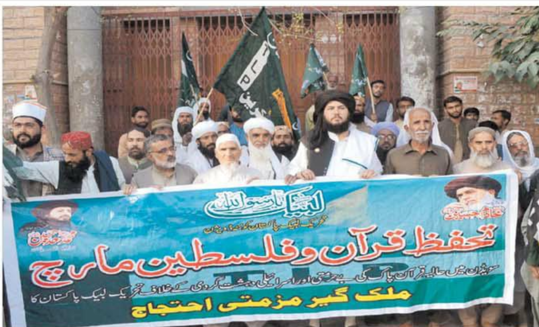
Activists of Tehreek-e-Labbaik (TLP) are holding protest rally against Israeli cruel and inhumane acts and expressing unity with the innocent people of Palestine, at Quetta press club