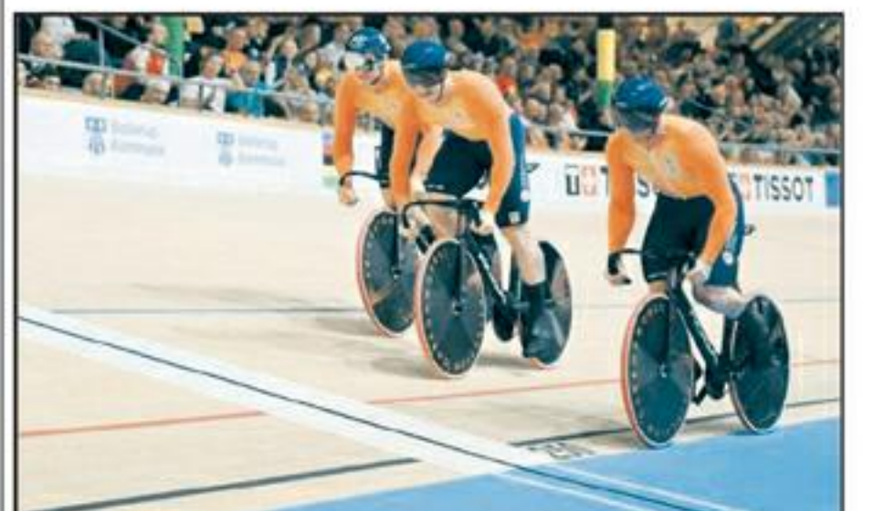
(FROM L) team Netherlands' Roy Van Den Berg, Harrie Lavreysen and Jeffrey Hoogland celebrate after winning the men's team sprint final of the UCI Track Cycling World Championships.

Wiebes defeated Jennifer Valente of the United States with New Zealand's Ally Wollaston taking home the bronze.