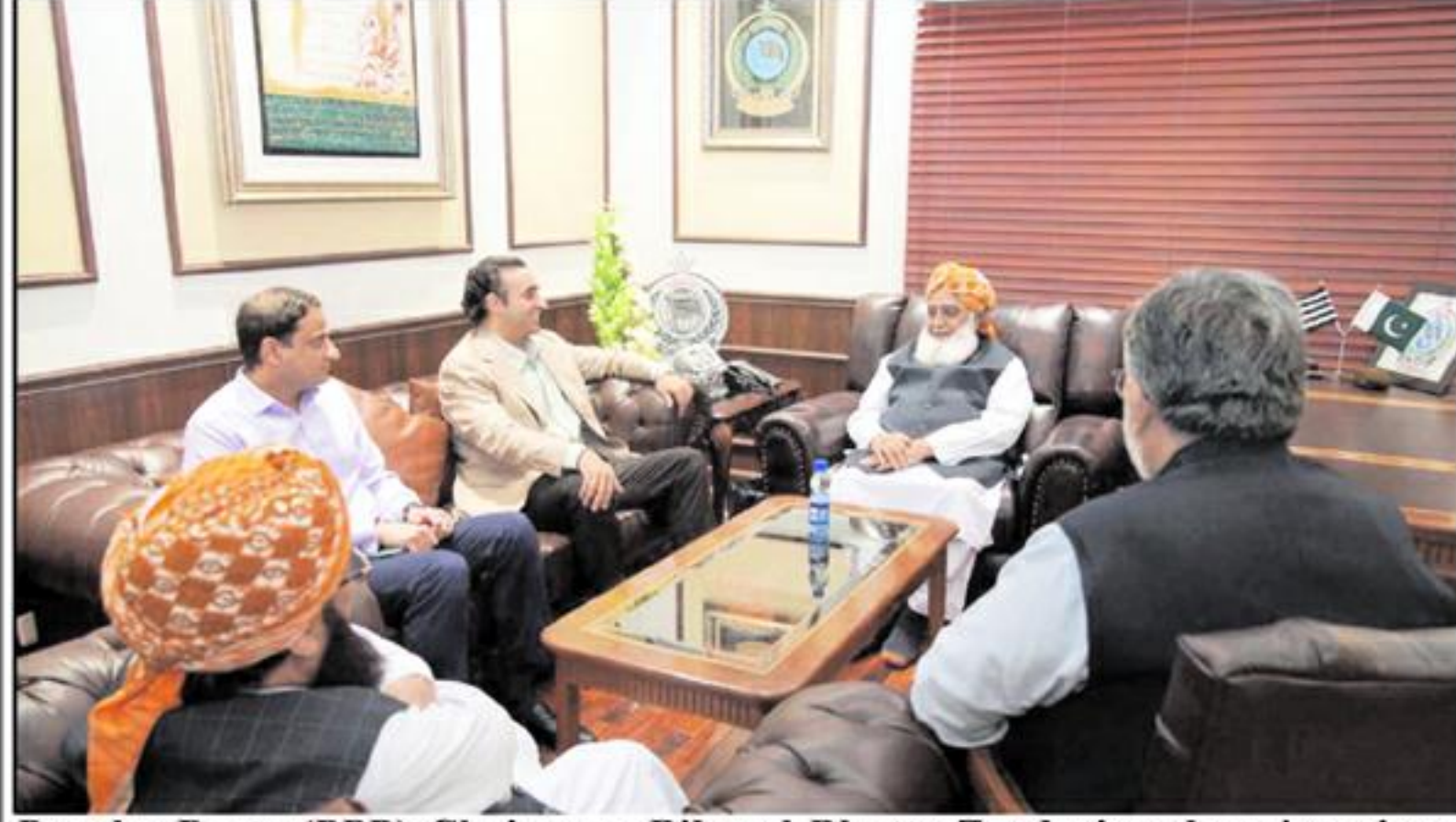
Peoples Party (PPP) Chairman, Bilawal Bhutto Zardari exchanging views with Maulana Fazal-ur-Rehman, Chief of Jamiat Ulema-e-Islam (JUI-F) during meeting held in Islamabad.

The Supreme Court had also declared the PTI a parliamentary party. The majority judgement explained that 39 out of the 80 MNAs, shown by the Election Commission of Pakistan (ECP) as PTI candidates, belonged to the party. The rest of the 41 independents would have to file duly signed and notarised statements before the commission within 15 days, explaining that they contested the February 8 general elections as a candidate.