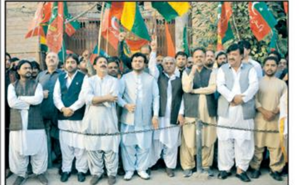
Activists of Tehreek-e-Insaf (PTI) are holding protest demonstration for release of PTI Founder Imran Khan, at Quetta press club.

water and energy." Romina Khurshid Alam said further that the Authority, which has been established at the federal level, has been entrusted with an crucial responsibility of achieving the climate resilience, environmental sustainability and low-carbon development goals by spearheading the country's response to the growing threats of climate change, coordinating efforts across sectors and implementing policies that promote climate resilience through various evidence-based policy measures.