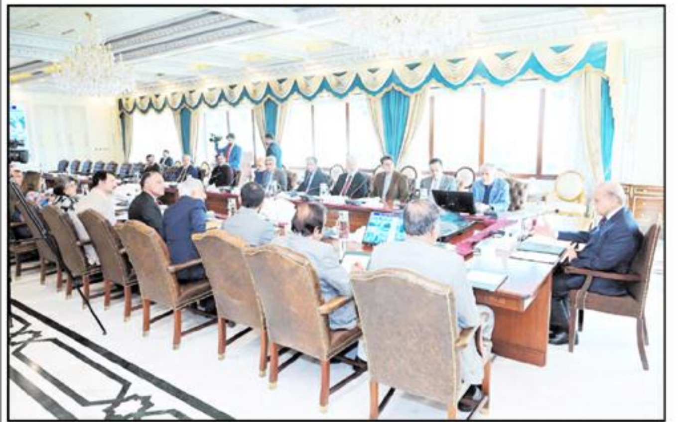
Prime Minister, Muhammad Shehbaz Sharif chairs a meeting regarding relief efforts in Gaza and Palestine by the Government of Pakistan, in Islamabad.

"Let us recommit to giving more support, care, and hope to patients, families and survivors of breast cancer," he said and expresses the hope that the collective efforts at the individual, institutional and national levels would enable the country to improve the overall health and well-being of the people and breast cancer-related deaths.