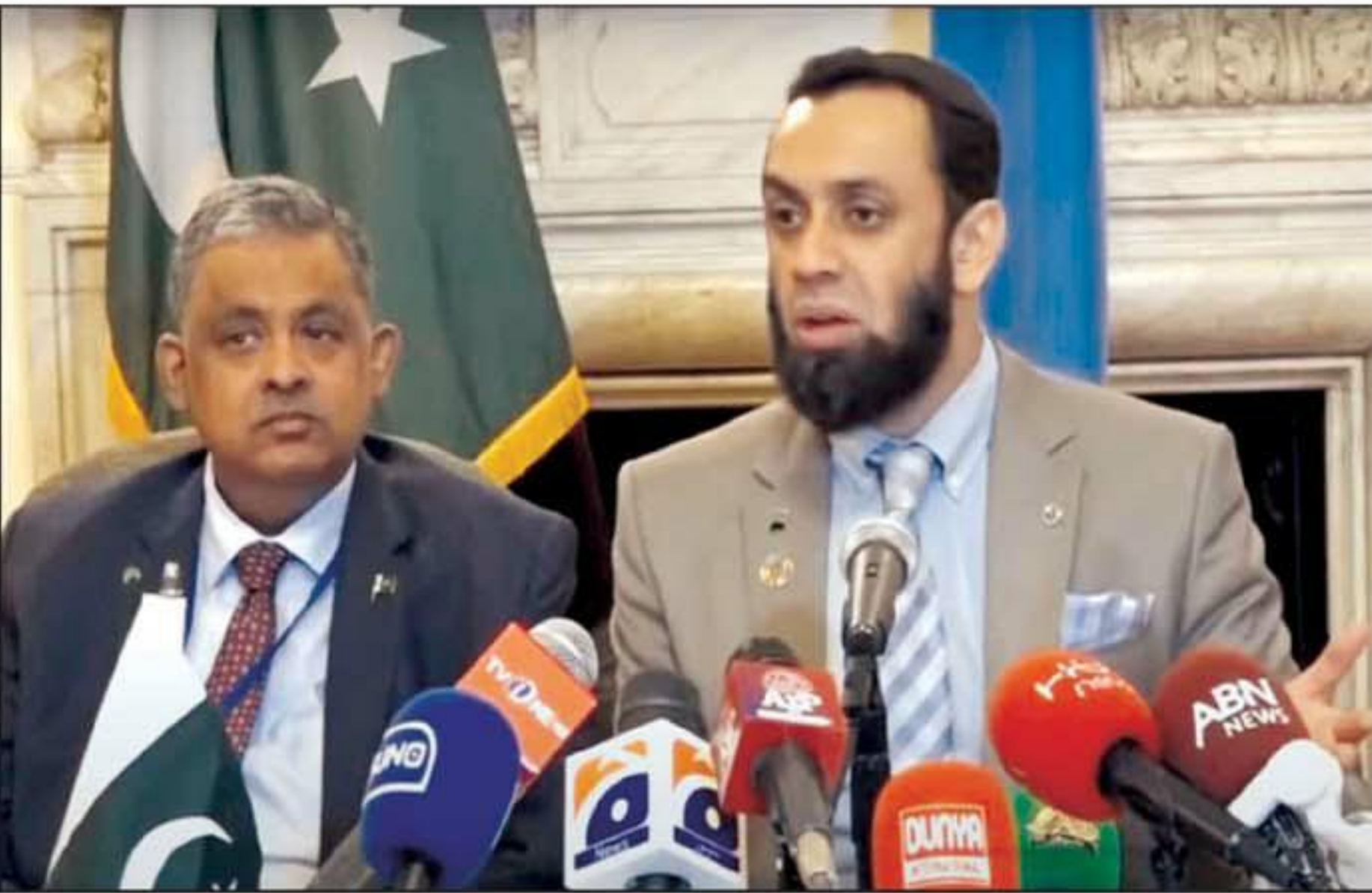
Minister for Information and Broadcasting Attaullah Tarar Speaking at a presser in New York.

Criticizing the Khyber Pakhtunkhwa government on misusing public resources for their political gains, Amir Muqam said that the KP is on the agenda to embezzle the funds and spent illegally on the party's events.