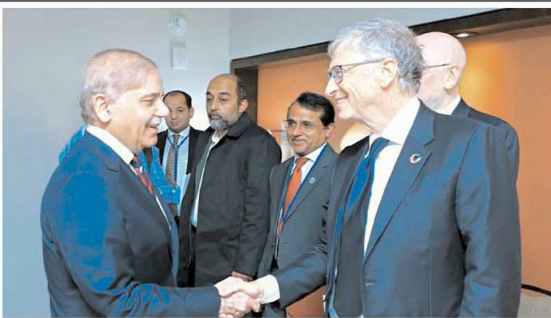
NEW YORK: Prime Minister Muhammad Shehbaz Sharif meets with the Bill Gates, founder and co-chair of the Bill & Melinda Gates Foundation (BMGF) on the sidelines of 79th session of the United Nations General Assembly.

Today, as we honor the top 50 exporters of pharmaceuticals and allied products, we recognize their invaluable contribution to not just the industry but to Pakistan's broader economic landscape, he remarked.