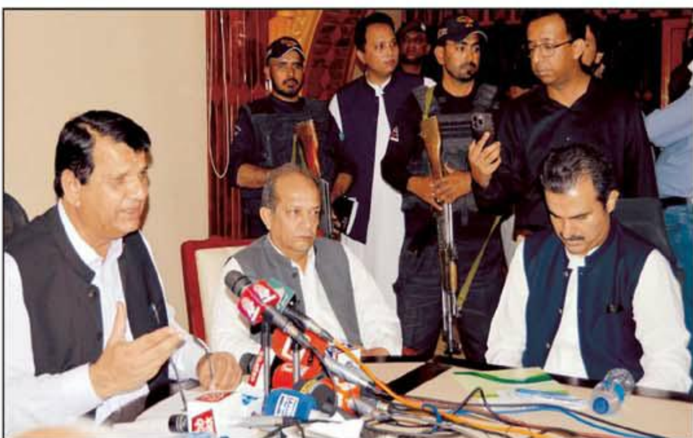
QUETTA: Federal Minister for State and Frontier Region (SAFRON) and Kashmir Affairs, Engineer Amir Muqam Addressing a press conference here in Commissionerat of Afghan Refugees Quetta.

He further noted that the purpose of the constitution is to protect the rights of every citizen, and any changes must prioritize the needs and welfare of the people.