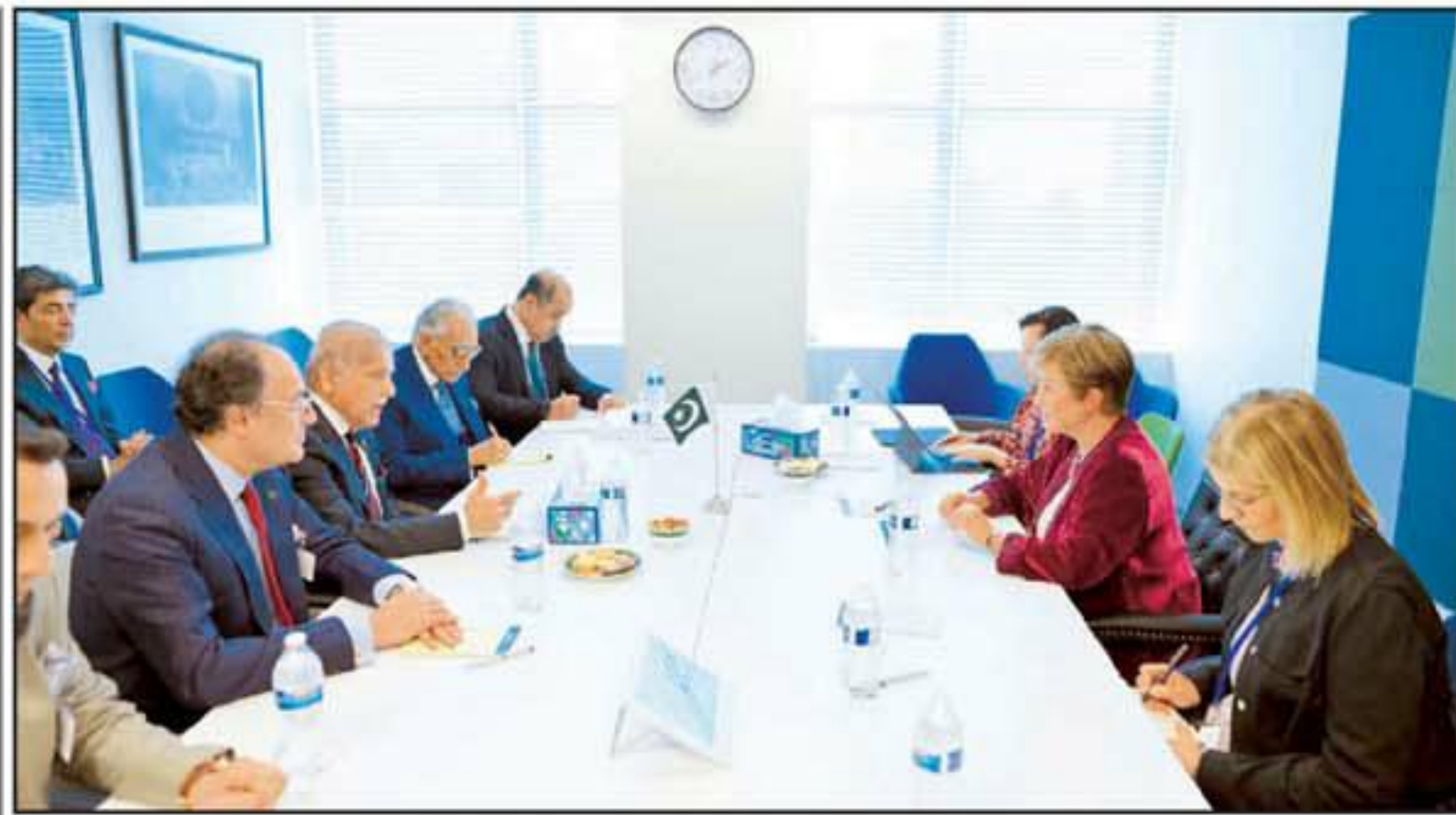
Prime Minister, Muhammad Shehbaz Sharif exchanging views with Kristalina Georgieva, Managing Director of the International Monetary Fund (IMF) during meeting on the sidelines of 79th session of the United Nations (UN) General Assembly, in New York