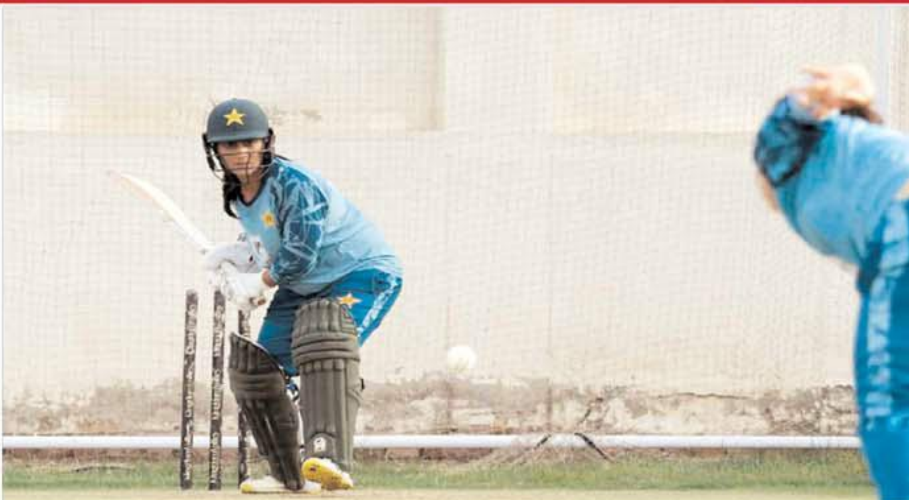
Pakistan Women Cricket Team Players are warming up and improve their cricketing techniques during the net practice match for the upcoming three International T20 Series with South Africa, in Multan.

Afghanistan have successfully played six Twenty20 and five One-day Internationals at the Greater Noida venue since 2017.