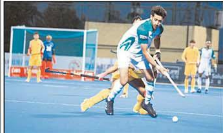
HULUNBUIR: Players in action during the Asian Hockey Champions Trophy match between Pakistan and China at the Moqi Training Base.

England collapsed to 52-4 inside eight overs in their first limited-overs international since sacking white-ball coach Matthew Mott after the Austr-alian presided over lacklustre defences of their 50-over and T20 World Cup titles. Jordan Cox, one of three England debutants, fell for 17 when he was brilliantly caught in the deep, with the sprinting Tim David diving full length to hold a two-handed chance over his shoulder.