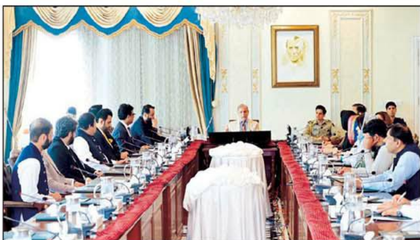
Prime Minister, Muhammad Shehbaz Sharif in a meeting with a delegation of Young Parliamentarians held in Islamabad

Khawaja Asif criticised the PTI for its past actions, including storming the Parliament, occupying the Prime Minister's House, and filing cases against the daughters of the sitting Prime Minister Shehbaz Sharif.