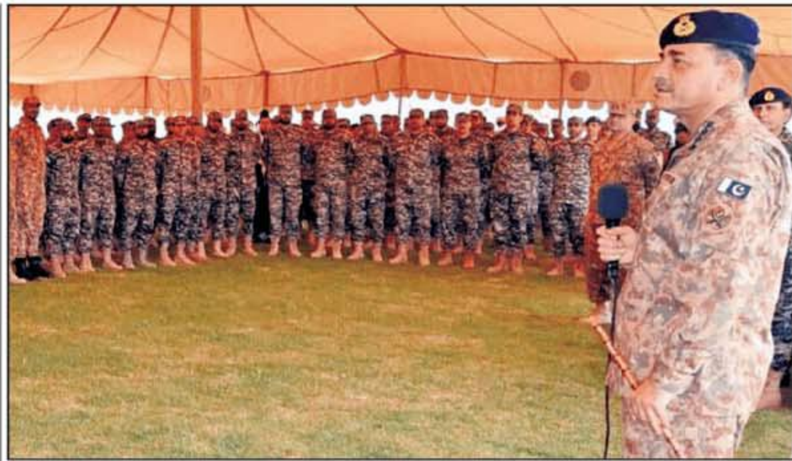
Chief of Army Staff General Asim Munir addressed Pakistani troops during a visit to Orakzai District

He also mentioned the difficulties faced in meeting the IMF's targets, particularly the increased tax burden on the salaried class. "If inflation continues to decrease, we will reduce this burden," he promised.