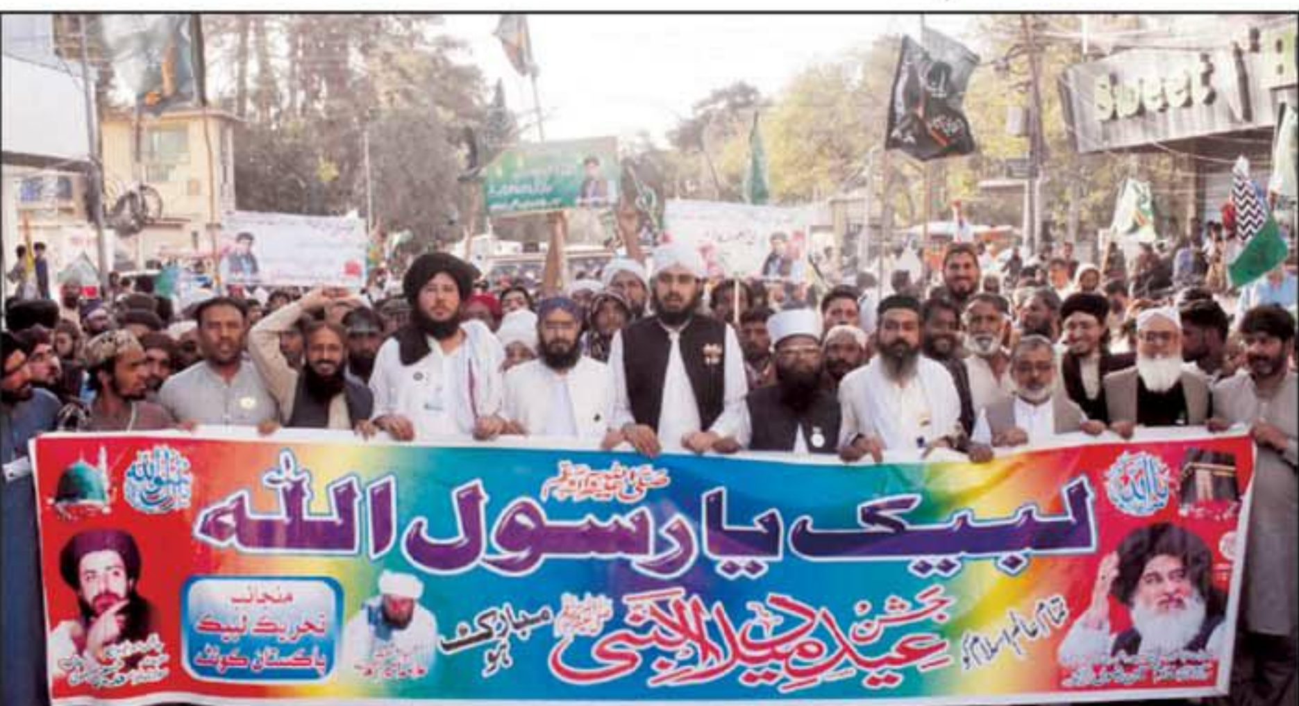
Activists of Tehreek-e-Labbaik (TLP) are holding Jashan-e-Eid Milad-un-Nabi (SAW) rally in connection of 12th Rabi-ul-Awwal the Birthday Ceremony of Holy Prophet (P.B.U.H) coming ahead, at Mannan Chowk in Quetta.