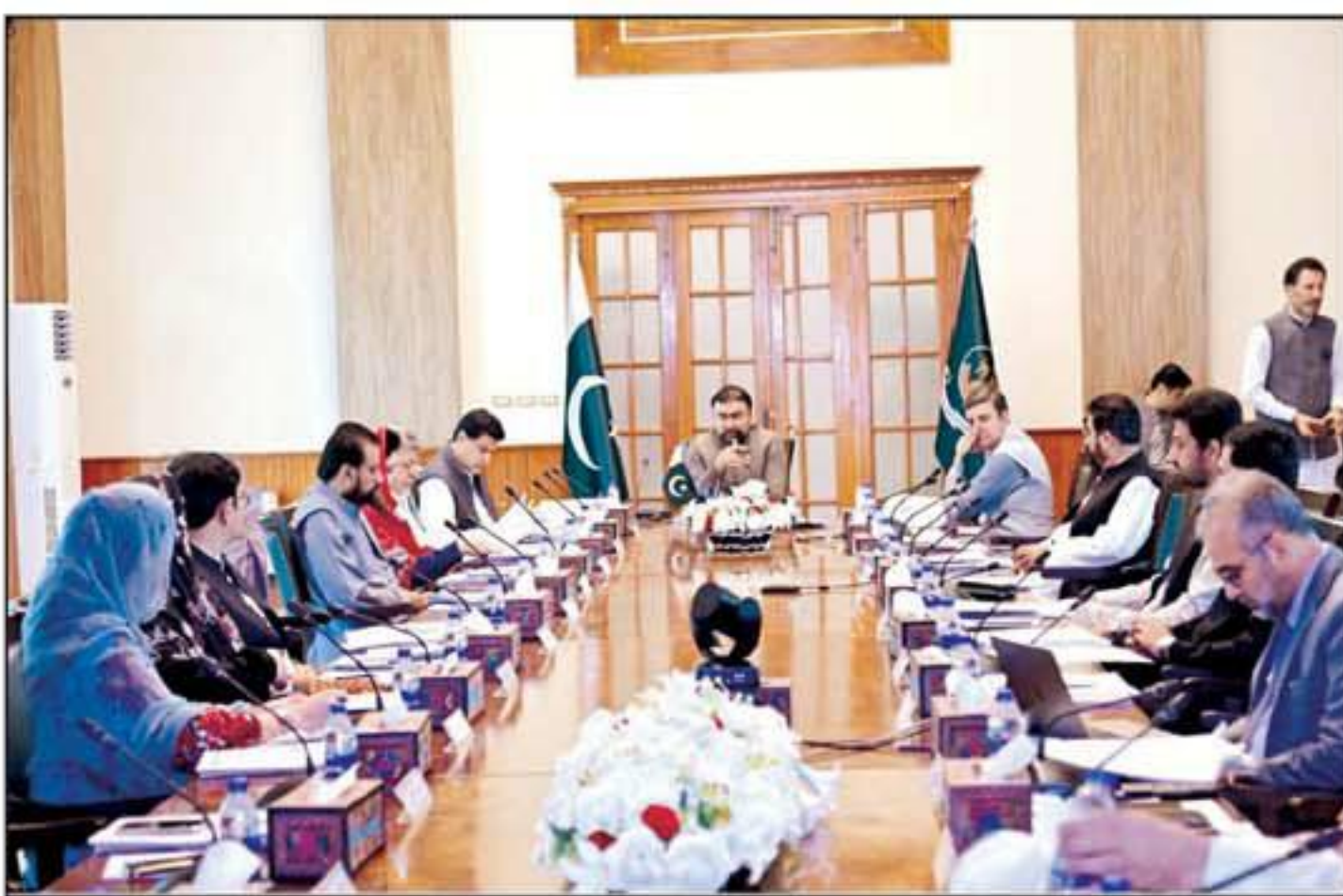
QUETTA: CM Balochistan Mir Sarfraz Bugti Chairing a Provincial Cabinet Meeting.

This is the first ever visit to Pakistan by a Secretary General of the International Maritime Organization. The visit will afford an opportunity for Pakistan and the Organization to enhance collaboration in maritime sector and blue economy. Addressing the conference, Deputy Prime Minister and Foreign Minister Muhammad Ishaq Dar reiterated Pakistan's commitment to environmental sustainability.