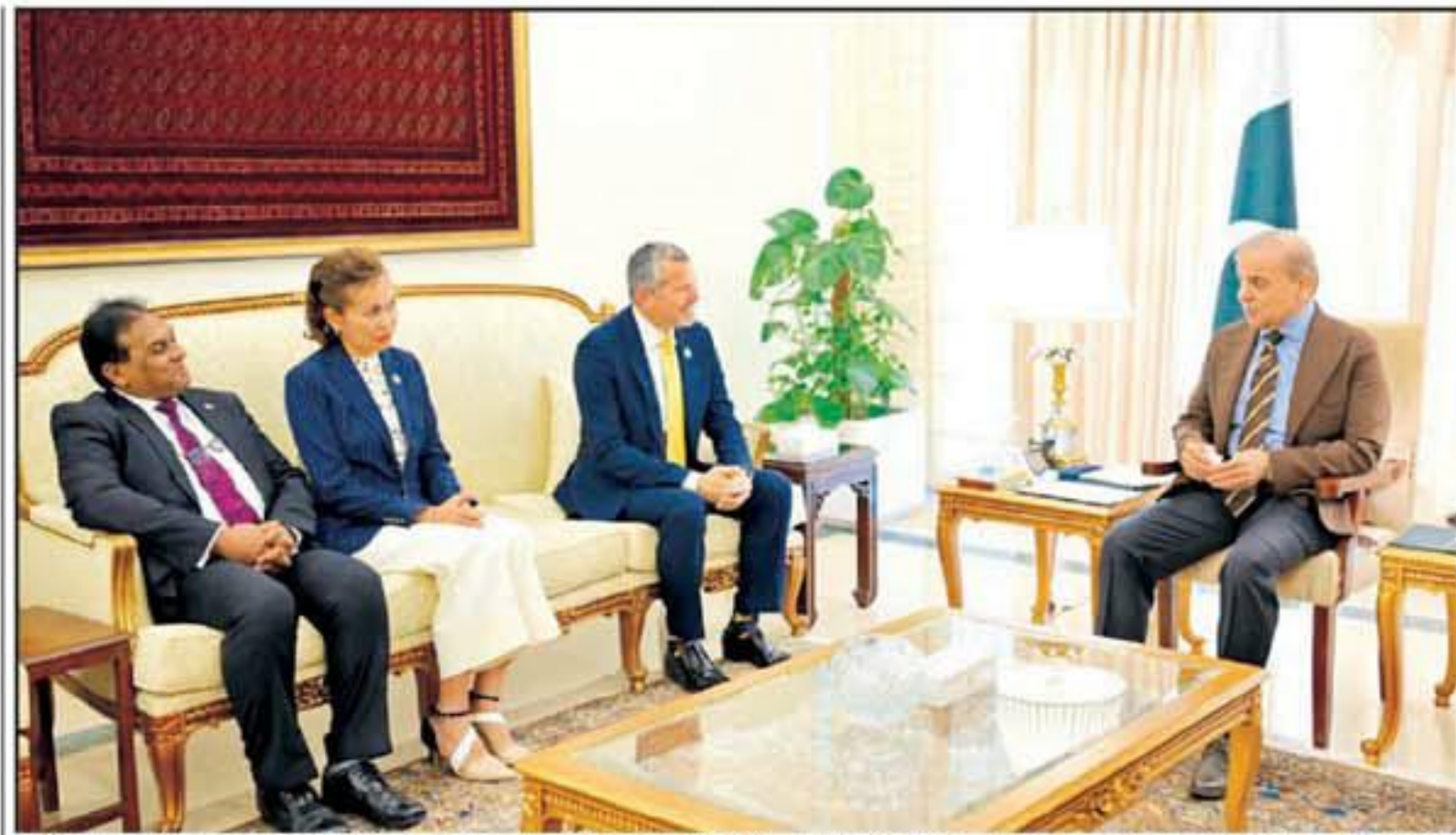
Prime Minister, Muhammad Shehbaz Sharif exchanging views with Arsenio Antonio Dominguez Velasco, visiting Secretary General of the International Maritime Organization (IMO) during meeting held in Islamabad