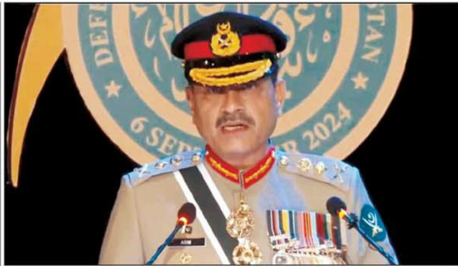
Army Chief General Asim Munir is addressing a Defence Day ceremony in Rawalpindi.

The provincial government with the support of security agencies will defend every inch of the country's land. On the occasion of Defense Day, Chief Minister Balochistan Mir Sarfraz Bugti paid homage to all the martyrs who rendered their lives for the defense of the country.