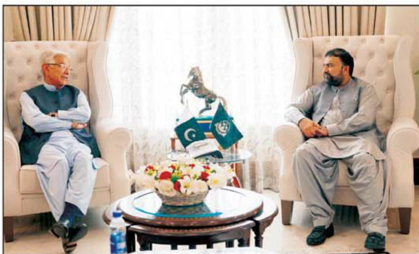
QUETTA: CM Balochistan Mir Sarfraz Bugti in a meeting with Federal Minister for Defence Khawaja Asif.

He said that in history, Balochistan could not achieve its goals of construction, creation and development based on various internal and external reasons due to which we have been left behind compared to other provinces.