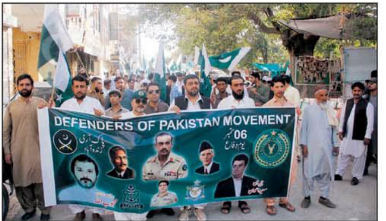
Members of Defenders of Pakistan Movement are holding rally to pay homage to the Ghazis and Shuhada of 06 September 1965 Indo-Pak War on the occasion of Defence Day of Pakistan, at Quetta press club.

Likewise, according to it, a district magistrate would not permit any assembly in any area other than the defined, designated area and the assembly would proceed and take place at the specified locality or route, in the manner and during the times mentioned in the permission.