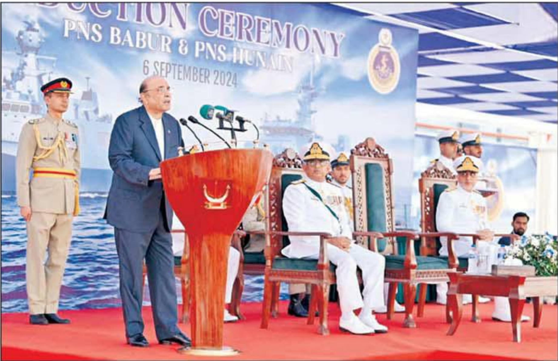
KARACHI: President Asif Ali Zardari addressing the induction ceremony of Pakistan Navy Ships Babur and Hunain, at Pakistan Navy Dockyard.

During the last year, environmental samples indicated the presence of the polio virus in different districts of the province.