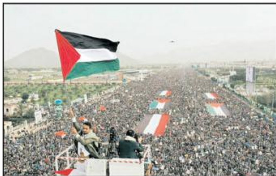
Gaza: Thousands of crowds in Al-Sabeen Square in the Yemeni capital, Sanaa, in solidarity with Palestine.