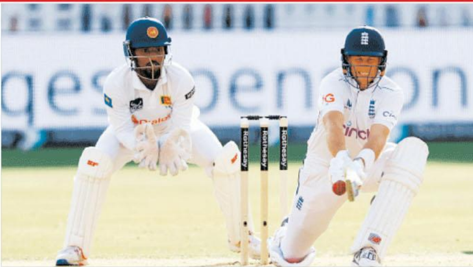
ENGLAND batter Joe Root plays a reverse sweep as Sri Lankan wicket-keeper Nishan Madushka looks on during the second Test at Lord's.

Bangladesh on the other hand are looking to record a historic first Test series victory over Pakistan.