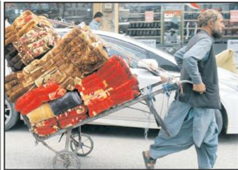
QUETTA: A man push his wheelbarrow loaded with blanket for delivery purpose.

The DC Hub has directed the Mines and Minerals Department to compel the crash plant owners to remove their machinery from the Mines and Minerals river.