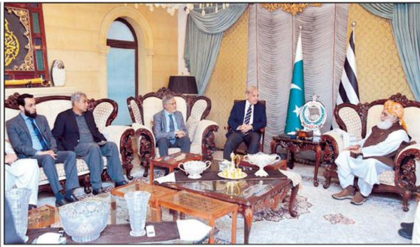
ISLAMABAD : Prime Minister Muhammad Shehbaz Sharif meets the President of Jamiat Ulema-e-Islam (F) Maulana Fazal ur Rehman.

Speaking on the floor of the Senate today, the interior minister said that the "completely-planned" Balochistan attacks were carried out by "two to three terrorist organisations".