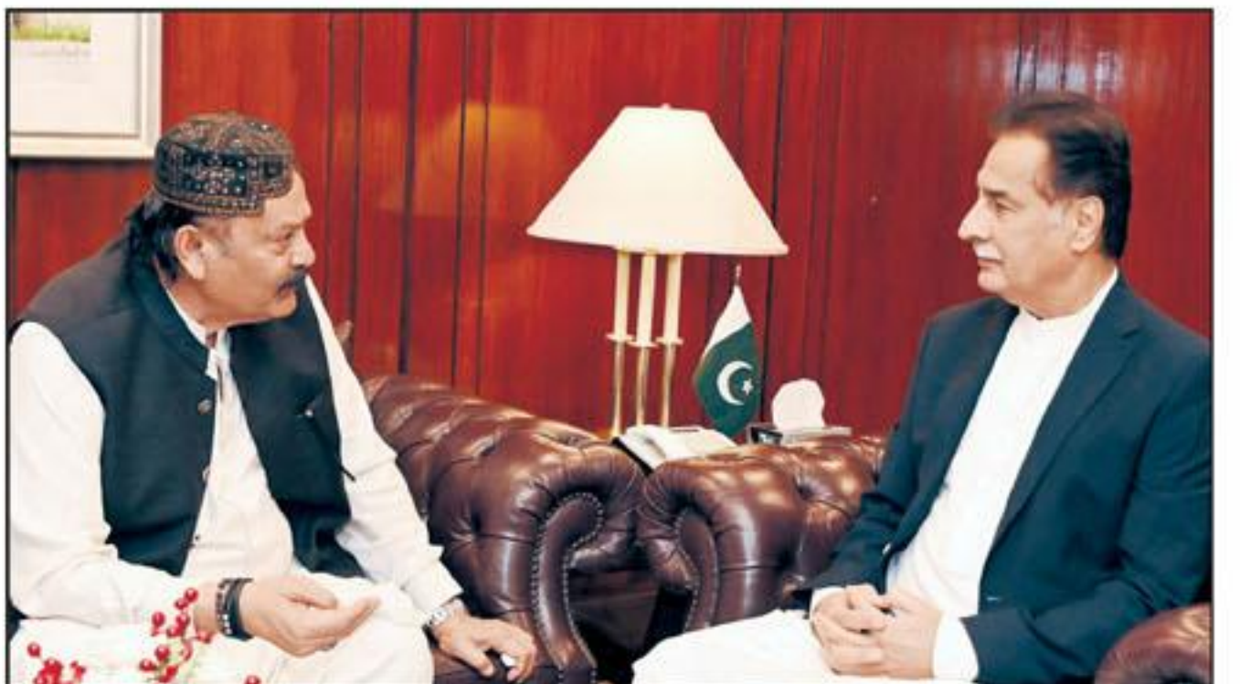
ISLAMABAD: Speaker National Assembly Sardar Ayaz Sadiq in a meeting with chairman special committee on Kashmir Rana Muhammad Qasim Noon, at Parliament House, in the Federal Capital.

Owing to these IPP contracts, energy users already receive the worst form of invoices in the world, with taxes and capacity fees accounting for 70% of their bills, according to power sector analysts.