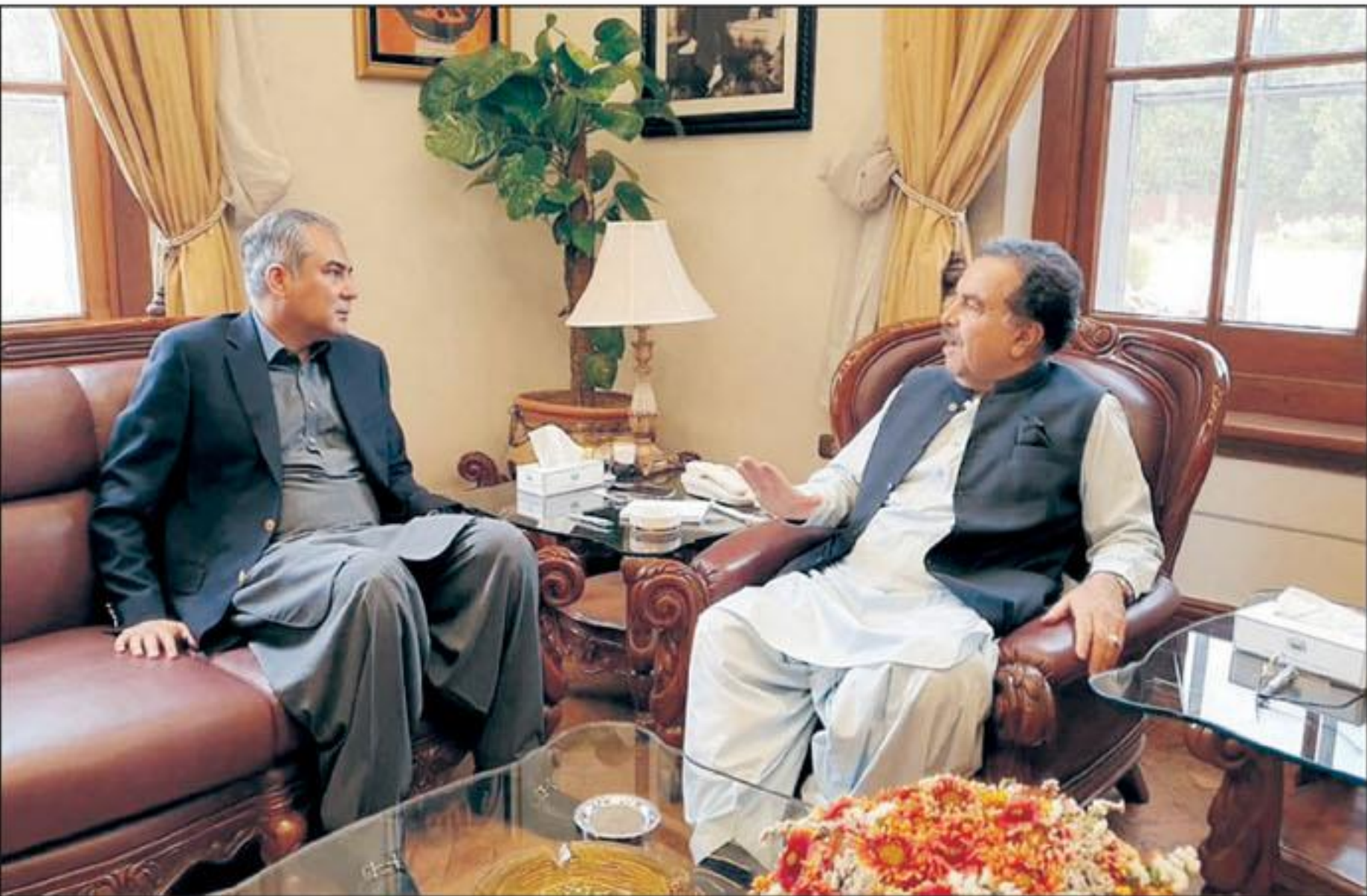
Quetta: Federal Minister for Interior Mohsin Naqvi in a meeting with Governor Balochistan Jaffar Khan Mandokhai in Governor House.

Imran also indicated that he would not take back those who left the party easily.