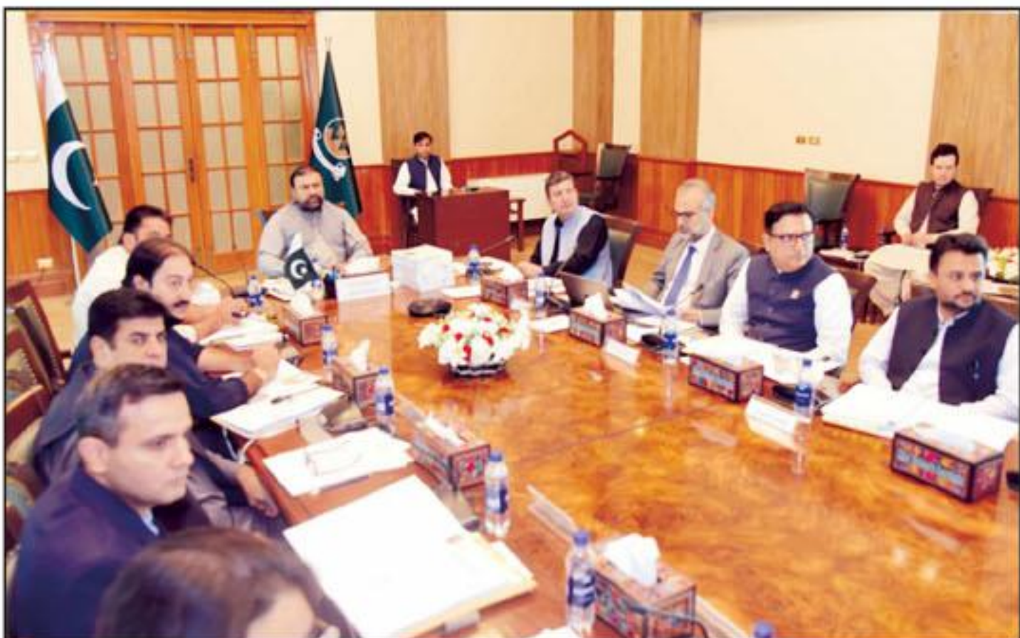
QUETTA: Balochistan Chief Minister Mir Sarfraz Bugti on Friday presided over the Balochistan Disaster Management Commission meeting to review the disaster preparedness plan.

They said that shopkeepers have increased the price of LPG per kg due to damaged gas pipeline.