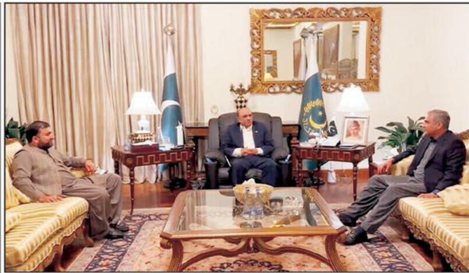
President Asif Ali Zardari holds a meeting with Interior Minister Mohsin Naqvi and Balochistan Chief Minister Sarfraz Bugti.

The Musakhail district witnessed the most horrific incident in which 23 passengers were forced off a bus and brutally slain one after another.