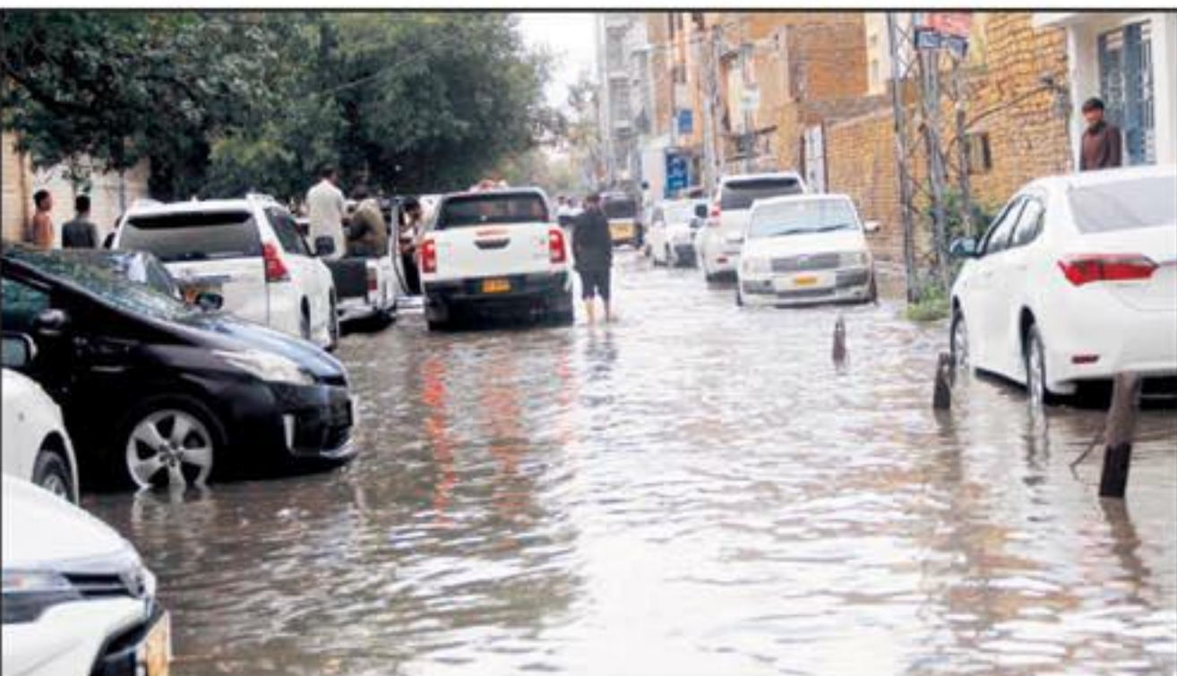
Commuters are facing difficulties in transportation due to stagnant rainwater causing of poor sewerage system after heavy downpour of monsoon season, at Adalat road in Quetta.

He cautioned against repeating past mistakes, where terrorists were released from jails under the guise of negotiations, allowing them to return to Pakistan. "We should not let those who oppose the country succeed. We have successfully conducted operations before, but negotiations led to significant errors," Dar remarked.