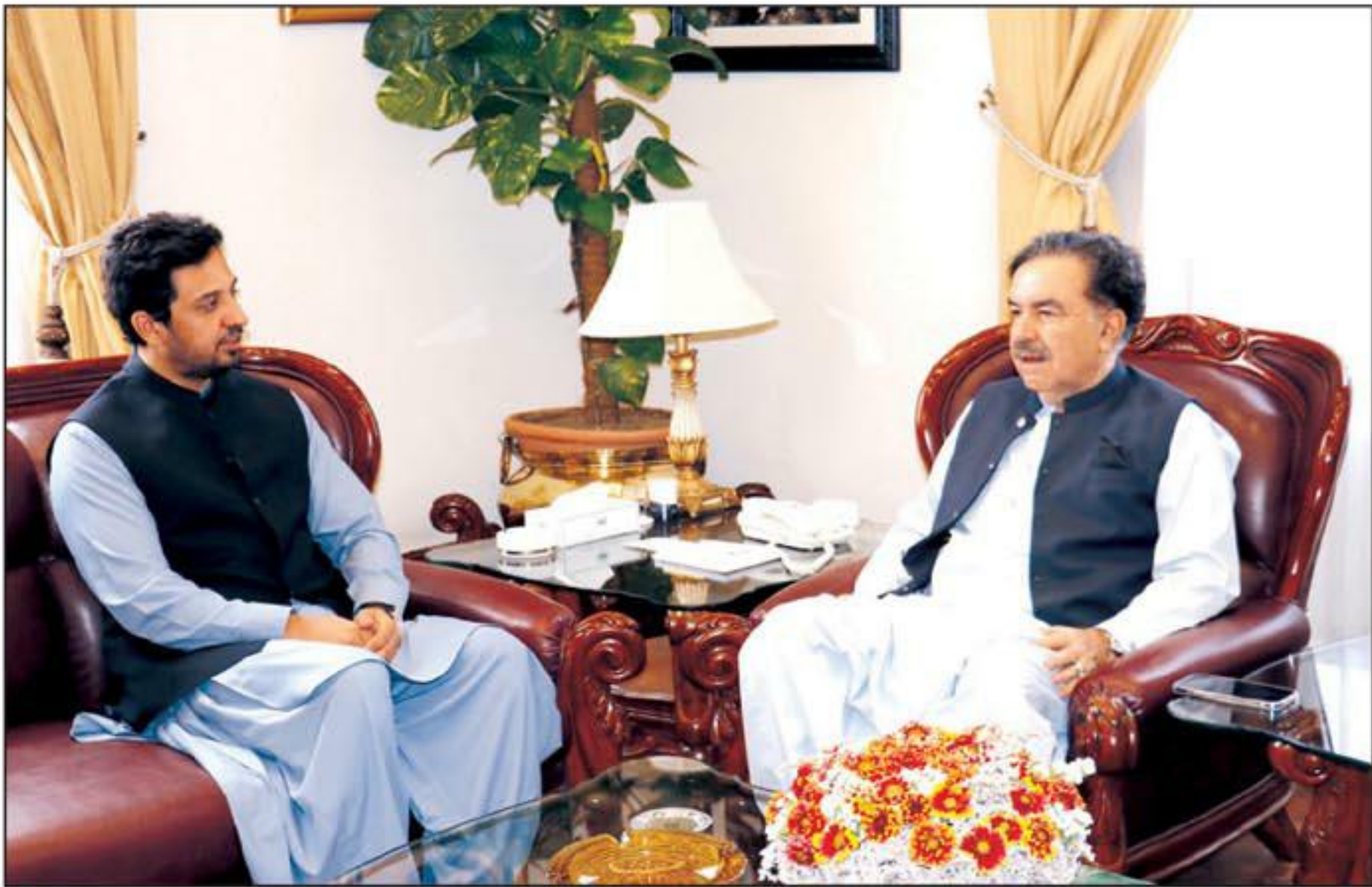
QUETTA: Governor Balochistan Jaffar Khan Mandokhel in a meeting with Provincial Finance Minister Mir Shoaib Noshervani.

The cabinet was informed that in order to improve the performance of the federal government, proper use of manpower, removal of unnecessary impediments in the policy-making and implementation of decisions, and to further strengthen the most important departments and bodies, the first phase of work on committee's recommendations about six ministries had already been initiated. The meeting was further informed that in the light of the recommendations of the committee, a total of 82 government bodies related to these ministries were being merged and dissolved into 40 such institutions, in which digitisation, smart management, efficient governance, transparent and speedy implementation of projects and better provision of facilities to the common man would be ensured.