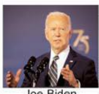
By Khawaja Farooq

In a surprising twist to the upcoming U.S. presidential election, recent polling data reveals a dramatic shift in voter preferences among traditionally Democratic-leaning groups. Notably, 95% of the American Muslim community, particularly among the younger generation, and a significant portion of liberal and educated Jewish voters are now rallying behind former President Donald Trump.